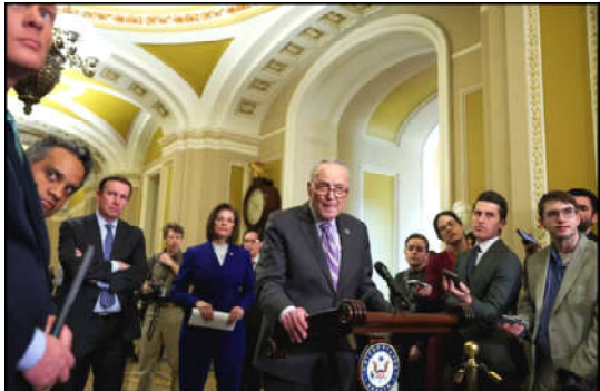
U.S. Senate Majority Leader Chuck Schumer (D-NY) listens to questions during the weekly Democratic Caucus lunch press conference at the U.S. Capitol building in Washington, U.S.

WASHINGTON (Internews): Republican presidential contender Nikki Haley, the last remaining rival to Donald Trump in the primary race, has requested U.S. Secret Service protection, the campaign said on Monday.