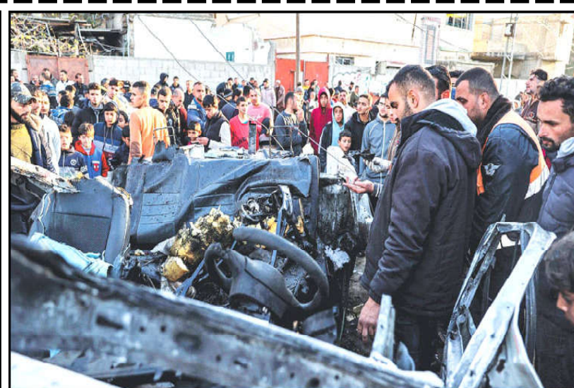
People gather to inspect the remains of a wrecked police vehicle that was destroyed by reported Israeli bombardment at Rafah in the southern Gaza Strip.

WASHINGTON (INP): US lawmakers voted Tuesday to reject a standalone Israel aid bill denounced by critics as a "cynical" bid to thwart a cross-party border security and foreign assistance package that would include cash for war-torn Ukraine.