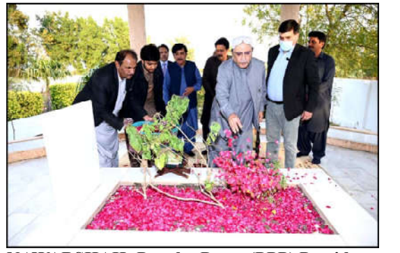
NAWABSHAH: Peoples Party (PPP) President, Asif Ali Zardari showering rose petals and offers Fatcha on the graves of his parents during his visit, at Baloo Ja Quba Graveyard in Nawabshah.

KARACHI (INP): Pakistan People's Party (PPP) Chairman Bilawal Bhutto Zardari said that only his party held public gatherings across Pakistan in connection with the General Elections 2024 which he said showed PPP's support in all parts of the country. While talking to a private news channel, the PPP Chairman said that he went to every part of the country for the election canvassing and received a 'great response' from the people. He said that his election campaign across the country is tantamount to the 'fact' that only the PPP represents the center. Bilawal also took a jibe at the Pakistan Muslim League-Nawaz (PML-N) for 'restricting' its election campaign to 'few' parts of the country. "The PML-N held electioneering in only a few constituencies and once again proved itself to be a party of Punjab," he added. The PPP Chairman said that the PML-N's leadership could not spare even half an hour to come to Karachi and run the election campaign in the port city. "The PML-N has also failed to turn to South Punjab and Balochistan. "Those who raised 'Vote Ko Izzat Do' (Respect the vote) slogans did not go to three provinces," Bilawal added. Pakistan People's Party (PPP) Chairman Bilawal Bhutto Zardari asked the Pakistan Tehreek-e-Insaf (PTI) workers and supporters to vote for the PPP instead of the independent candidates backed by the latter.