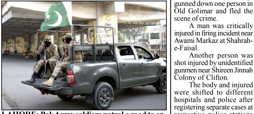
LAHORE: Pak Army soldiers patrol a road to ensure security ahead of general election, in Provincial Capital.

delivered. Ensuring safety at all levels remains a top priority, with concerted efforts aimed at conducting peaceful elections, he reiterated. Addressing the media, the IGP highlighted the shared responsibility for ensuring peaceful elections, underscoring the pivotal role of the police in maintaining security. He assured that the police force was utilizing all available resources, including Quick Response Force (QRF), which was on standby. Additionally, district Senior Superintendents of Police (SSPs) have identified sensitive polling locations, along with Designated Returning Officers (DROs), to ensure a swift response to any untoward incidents. Subsequently, the IGP visited the election control room situated in the office of DIGP South, where he received a briefing on monitoring activities from DIGP South.