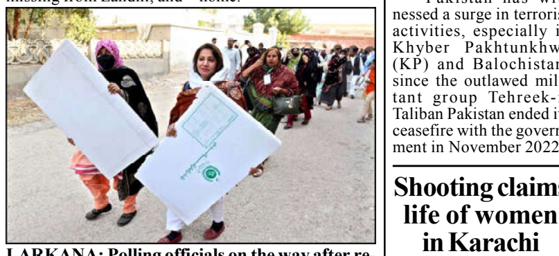
LARKANA: Polling officials on the way after receiving polling related materials for General Election -2024 at DRO office.