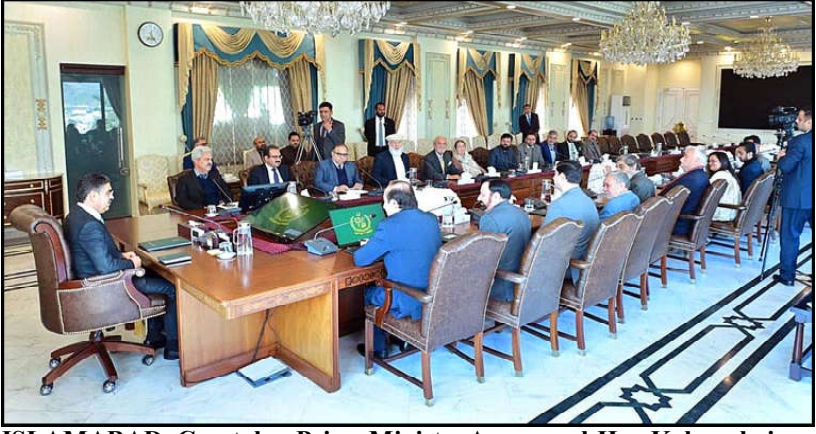
ISLAMABAD: Caretaker Prime Minister Anwaar-ul-Haq Kakar chairs a meeting of the Royal Foundation of Gilgit Baltistan.