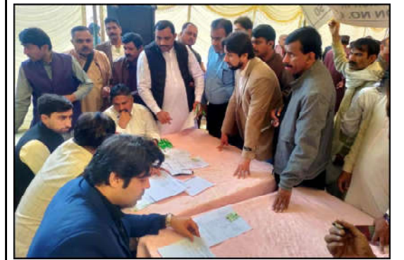
SUKKUR: Polling staff gather for collecting ballot boxes and election materials for their polling station from Election Commission Office, a day before General Elections 2024, in Sukkur.

Korangi from Superior College and Government Girls College Korangi. Meanwhile, the polling stuff in District South is being dispatched from Government Commerce College. It is to be noted that the General Elections of the National Assembly and four provincial assemblies will be held tomorrow. The election campaign by political parties and independent candidates concluded across the country last night. The Election Commission has completed all arrangements for the polling. Ninety-thousand six hundred and seventy-five polling stations have been established in all four provinces.