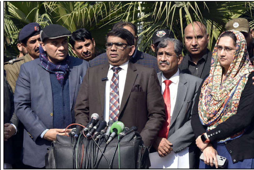
LAHORE: Punjab's Election Commissioner Ijaz Anwar Chohan talking with media persons at University of Engineering, in Provincial Capital.

15, 696 polling stations for 21.928mn voters setup in KP PESHAWAR (APP): All arrangements have been completed by Election Commission of Pakistan for free and transparent election in Khyber Pakhtunkhwa where over 21.928 million registered voters would decide fate of 713 candidates contesting for national assembly seats and 1,814 candidates of provincial assembly seats on Thursday (tomorrow).