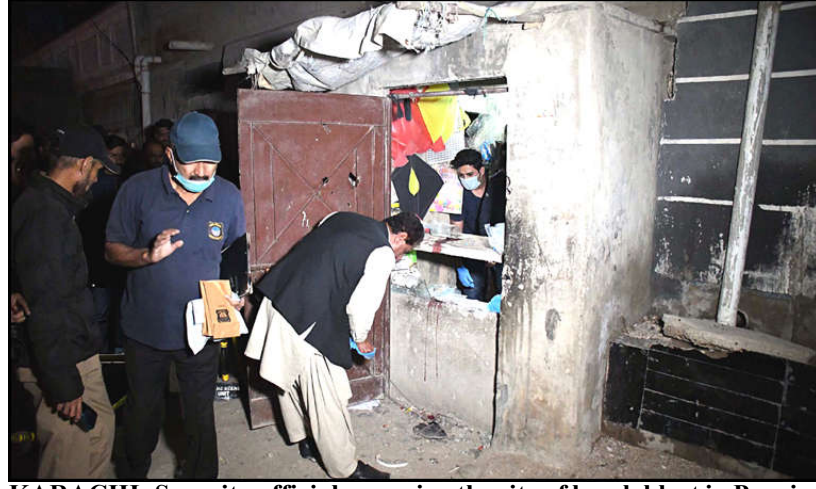
KARACHI: Security officials examine the site of bomb blast in Provincial Capital.