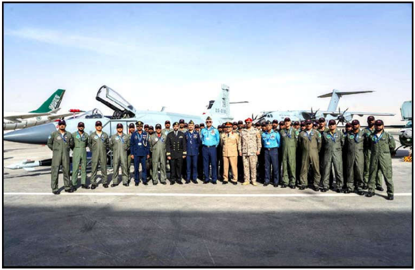
RIYADH: Deputy Chief of the Air Staff (Operations), Air Marshal Abdul Moed Khan in a group photo along with Foreign dignitaries and Pakistan Air Force (PAF) contingent during World Defence Air Show 2024 held in Riyadh.

which 1,700 would be for male and 1,519 for female voters, are being established. In Hyderabad and Qasimabad talukas based constituency NA-218, some 339,667 people are registered to exercise their right of adult franchise. The ECP is setting up 240 polling stations with 861 polling booths for 178,678 male and 160,989 female voters. Likewise, 424,448 people would elect their MNA from Latifabad taluka-based NA-219.