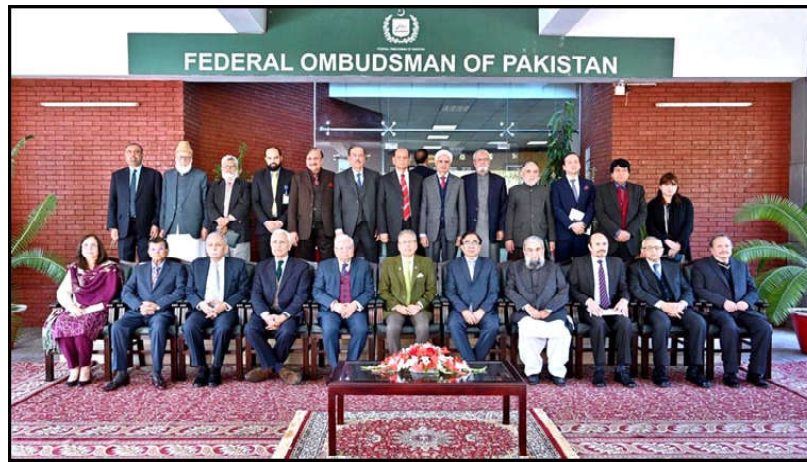
ISLAMABAD: President Dr. Arif Alvi in a group photo during his visit to the office of the Wafaqi Mohtasib.

48,190 complaints registered online in 2023, marking an increase of 47 per cent from 2022. Similarly, 22,321 complaints were received through Mohtasib's mobile App in 2023, representing a 21 per cent increase from 2022. The meeting was also briefed on the Integrated Complaint Resolution System, processing 18,469 complaints in 2023, alongside Mohtasib's teams conducting Khuli Kutcheries and inspection visits to address people's grievances against government agencies. Additionally, 2,113 cases were disposed of through the Informal Resolution of Disputes. During the meeting, the steps taken for the facilitation and resolution of complaints filed by Overseas Pakistanis were highlighted.