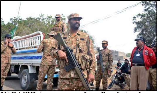
KARACHI: Army personnel standing alert on the eve of General Elections 2024 at Korangi Girls College.