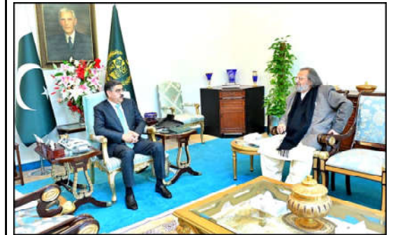
ISLAMABAD: Caretaker Minister for Federal Education and Professional Training Madad Ali Sindhi calls on Caretaker Prime Minister Anwaar-ul-Haq Kakar.

and stresses authorities to maintain necessary fundamental freedom for the sake of meaningful democratic process. At least 24 incidents of violence against political parties workers have been reported before election. UN High Commissioner for Human Rights had appealed to the authorities to ensure fully fair and free election and reiterate their resolve for democratic process. FO spokesperson said security plans have been given final shape hold the elections on Thursday as per the electoral laws of Pakistan. She said our judicial system provides for fair trial and due process. Domestic legal remedies are available in case of any complaints in the electoral process.