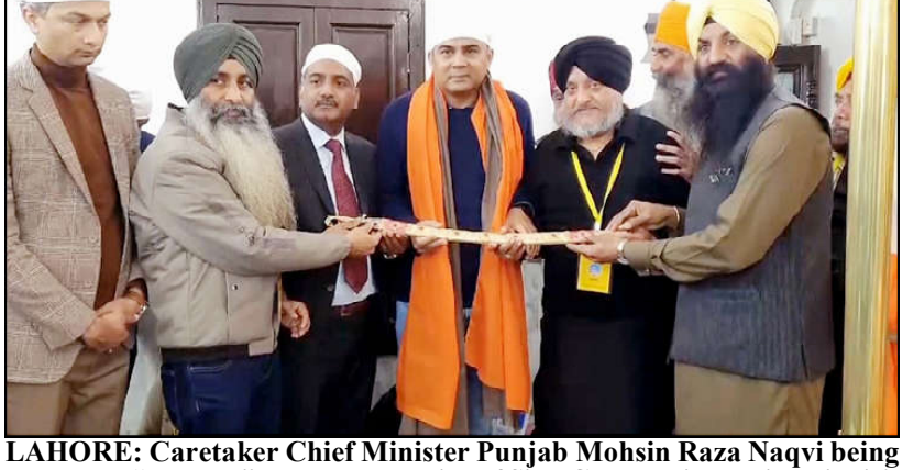
presented "Karpan" by representative of Sikh Community during his visit to Kartarpur.

The Chief Secretary directed the district administration to ensure a peaceful atmosphere and conduct of free, fair and transparent polling on the election day.