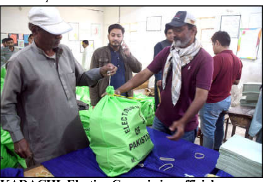
KARACHI: Election Commission officials prepare election material to be shipped to the polling stations ahead of the general election, in Provincial Capital.

They on the occasion said that Jamiat Ulma-e-Islam-JUÍ believes in peace and always played their vital role to maintain and improve the law and order situation in Sindh by following the all rules and regulations and remained peace lover.