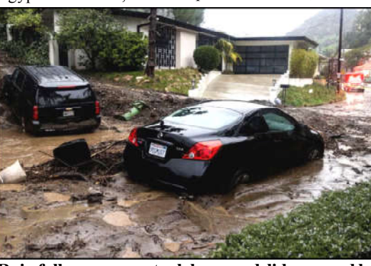
Rain falls over cars stuck by a mudslide, caused by an ongoing rain storm in Studio City, California.

Blinken faces major challenges. Hamas and Israel are publicly at odds over key elements of a potential truce. Israel has dismissed the United States' calls for could push terrified Pales- a path to a Palestinian state, and Iran's militant allies in the region have shown little sign of being deterred by U.S. strikes.