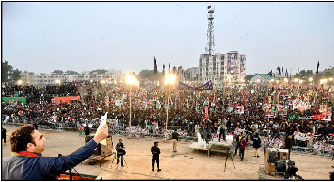
HYDERABAD: Chairman PPP Bilawal Bhutto Zardari addressing a election meeting.

Ph: 0300-3898091 Vol: 06. No. 20 Rajab 24, 1445 AH Monday February 05, 2024 Pages 04 Price Rs. 12.00