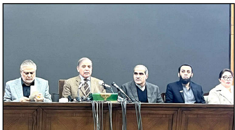
LAHORE: President PML (N) Mian Shabbaz Sharif alongwith other party leaders addressing a Press conference.

In the preamble of the Constitution of Pakistan, it is written that this country will be run by its elected representatives who come to power through elections, he maintained.