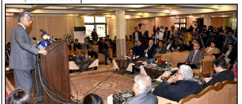
LAHORE: Honorable Chief Guest Mr. Murtaza Solangi, Caretaker Federal Minister of Information &amp; Broadcasting, addressing at seminar on "Political participation and empowerment of Youth, women, transgender and cultural minorities" organized by PID.

He informed that rallies, public meetings, and seminars would be held on Monday to draw attention of the world community towards grave human rights violations and brutalities against innocent Kashmiris by the Indian security forces. The banners highlighting the plight of innocent Kashmiris had been put on display at all important points and roads, he said adding that the Education Department was also organizing special programmes in educational institutions to draw attention towards the Kashmir issue.