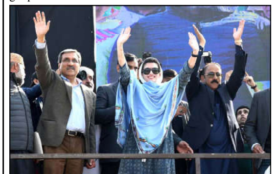
NAWAZABAD: PPP Leader Aseefa Bhutto Zardari wave to public gathering during Election Campaign.

On the sidelines of the Indo-Pacific Ministerial Forum, the Foreign Minister met with the High Representative Josep Borrell; Belgian Foreign Minister Hadja Lahbib; Spanish Foreign Minister José Manuel Albares Bueno.