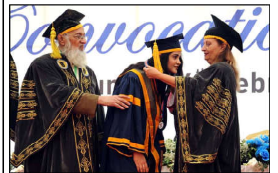
HYDERABAD: Provincial Minister for Education Rana Hussain presents Gold Medals to position holder students during 20th Convocation of ISRA University in the city.

They said that in this regard Control Rooms are set up at district and tehsil level side by side with provision of necessary facilities, posting of polling staff and all required arrangements are finalized. XENS of HESCO and SEPCO informed the meeting that from February 7 to Feb 10, 2024 no load shedding would be observed.