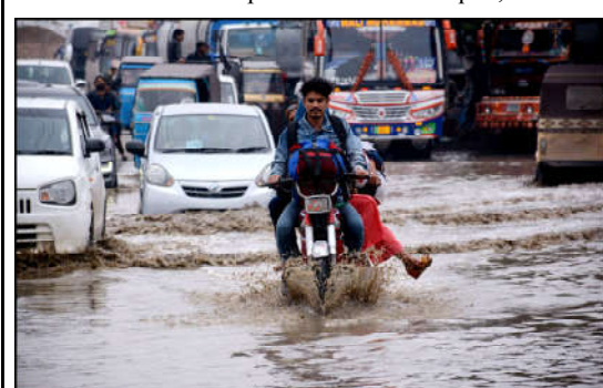
KARACHI: Vehicles passing through rain water accumulated on the Korangi road during heavy rain that experienced in the city.

enced heavy to moderate rains for the second day include North Karachi, Superhighway, Bufferzone, Nagan Chowringi, Saadi Town, North Nazimabad, Gulshan-e-Iqbal, New MA