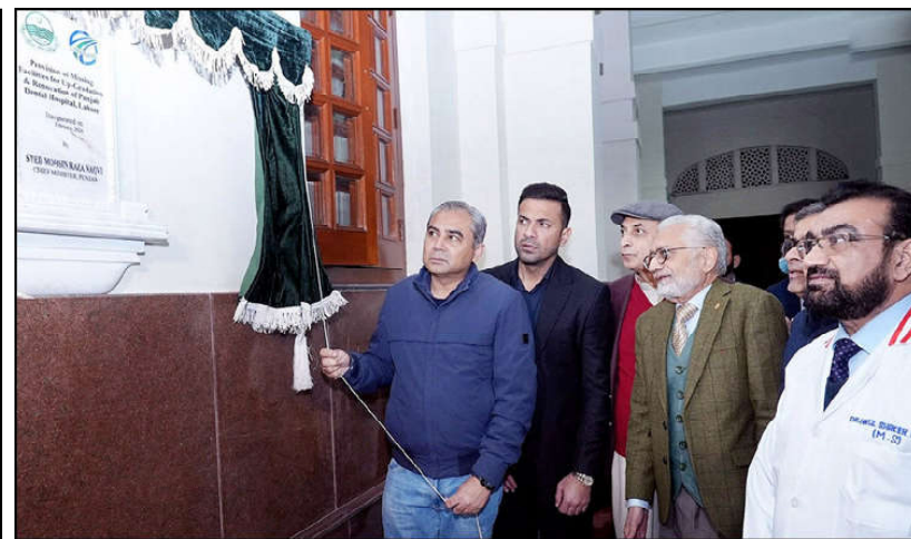
LAHORE: Caretaker Chief Minister of Punjab Mohsin Naqvi inaugurates up gradation and renovation of Punjab Dental Hospital.

seating capacity of the people in the Parade Ground would be enhanced approximately up to 18,000 after its upgradation and the height of Bab-e-Azadi project would be approximately 120 feet. Approval for the issuance of funds was accorded in the meeting to undertake remodelling of Liberty Chowk along with making an agreement with the Bank Alfalah for the biggest National Flag of South Asia and undertaking construction as well as extension of the Lahore Metro Bus Service corridor.