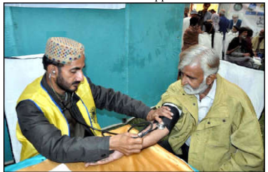
HYDERABAD: Patients are being examine by doctors during free eye medical camp organized by Host Lions Club held at Police Ground in Hyderabad.

He said that the way of dealing with and coming to power on someone's shoulders should be stopped.