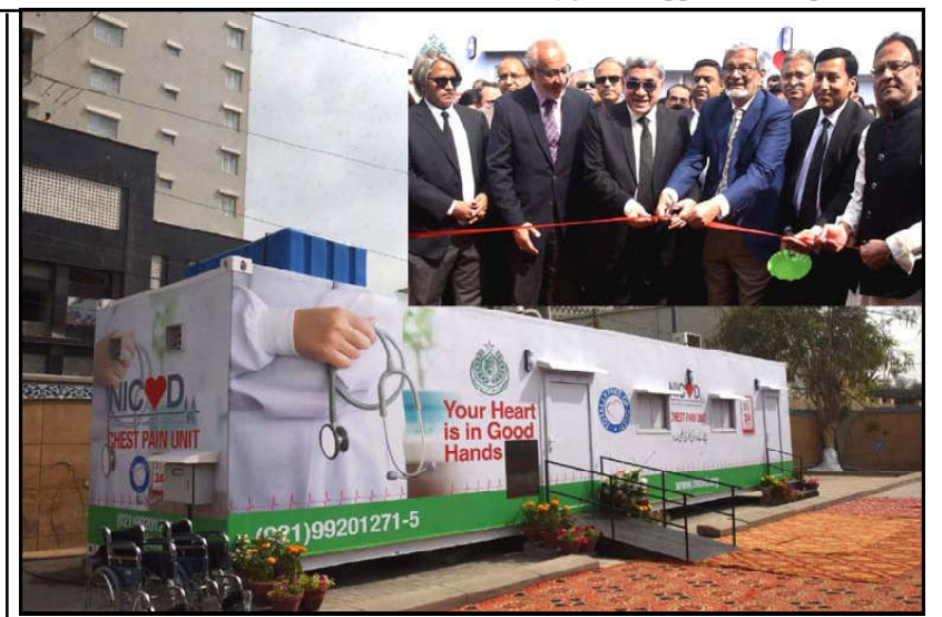
KARACHI: Caretaker Sindh Chief Minister, Justice (Retd) Maqbool Baqar along with Justice Aqeel Ahmed Abbasi, Chief Justice Sindh High Court and other Judges of Sindh High Court are cutting inaugural ribbon to inaugurate the 28th Chest Pain Unit of NICVD, at Sindh High Court Bar Association in Karachi.

He told the CM said that Shahrah-e-Faisal, particularly the area of the nursery, Drigh Road, and Old City areas, I.I Chundrigar Road some major nullas were not flowing at the required capacity, therefore he not only got them cleared but installed water board machinery to pump out stagnant water from the low lying areas.