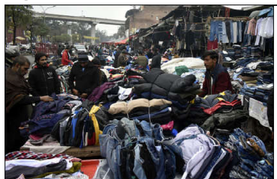
LAHORE: People are busy buying warm clothes and jackets in Landa bazaar at Shadman Sunday weekly bazaar in Provincial Capital.

Through this MoU both parties may, to the best of their mutual endeavor and capabilities, strive to enhance investment in value addition in the mining sector of KP Province, provide specific product/project information, identification of joint venture partners, facilitating procedural matters with respective authorities remaining within respective legal mandate. Similarly, partners may conduct matchmaking meetings.