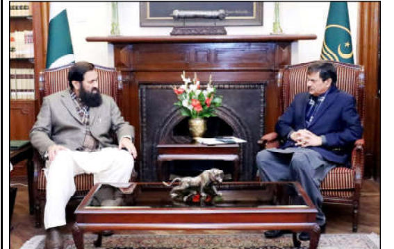
LAHORE: Provincial Minister for Education Mansoor Qadir meeting with Punjab Governor Muhammad Baligh-ur-Rehman.