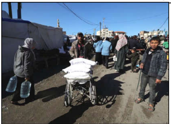
A Palestinian man carries bags of flour distributed by the United Nations Relief and Works Agency (UNRWA), amid the ongoing conflict between Israel and Hamas, in Rafah in the southern Gaza Strip.

Putin said Russia wouldn't just welcome but would "insist" on an international inquiry on what he described as a "crime" by Ukraine.