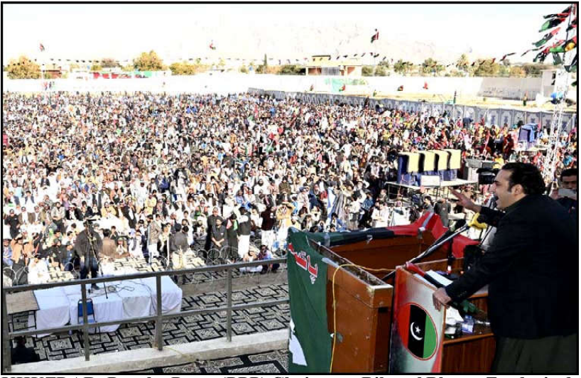
KHUZDAR: Peoples Party (PPP) Chairman, Bilawal Bhutto Zardari addresses during public gathering meeting as a part of Election Campaign in connection of General Election 2024 coming ahead, in Khuzdar.