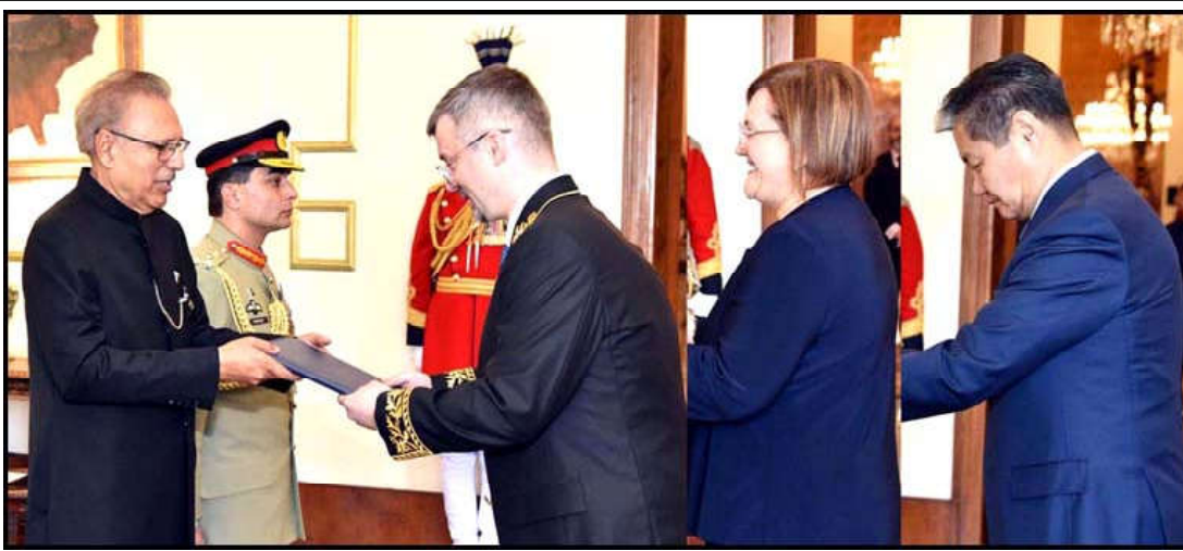
ISLAMABAD: The Ambassadors-Designates of Russia, Italy and Mongolia presenting their diplomatic credentials to President Dr. Arif Alvi, at Aiwan-e-Sadr.