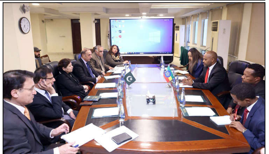
ETHIOPIA: Finance Minister Dr. Shamshad Akhtar, exchanging views with Ethiopian State Minister of Finance Eyob Tekalign Tolina during the meeting. The Federal Democratic Republic of Ethiopia and the Islamic Republic of Pakistan on Thursday explored different avenues for economic cooperation during a bilateral meeting took place here in Islamabad at the Ministry of Finance.

decreased by $6 billion, and the trade deficit contracted by $7.8 billion. He said: "These positive trends reflect our government's unwavering commitment to promoting trade and economic growth. We will continue to implement policies that support our exporters, diversify our export base, and enhance trade facilitation. I am confident that Pakistan is on the right track to achieving its trade goals and becoming a leading player in the global economy."