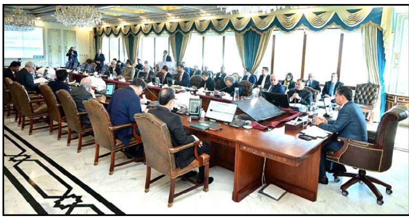
ISLAMABAD: Caretaker Prime Minister Anwaar-ul-Haq Kakar chairs a meeting of the Caretaker Federal Cabinet.

ISLAMABAD (Online): Public holiday has been announced on February 8 in connection with general election. Election Commission of Pakistan (ECP) has approved public holiday on February 8. Notification in this regard has been issued. All the public and private offices, educational institutions and business centers will remain closed. The EC while announcing the holiday has said this decision has been taken to facilitate voters so that they could not face any difficulty in exercising their right to vote. The announcement for holding general election on February 8 has been made.