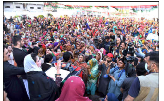
SANGHAR: Bibi Aseefa Bhutto Zardari, the daughter of Shaheed Mohtarma Benazir Bhutto addressing to party women workers gathering during Election Campaign at Khipro.