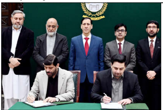
PESHAWAR: Caretaker Chief Minister Khyber Pakhtunkhwa Justice (R) Syed Arshad Hussain Shah witnessing signing of MoU between KP IT Board and Alkhidmat Foundation.

He said that public private partnership is a successful model. Governor Punjab further said that youth are the most valuable asset of the country. He said that along with formal education, the aspect of moral education is also important. Governor Punjab said that as Chancellor, he has given instructions to the Vice Chancellors to give special attention to the character building of the youth.