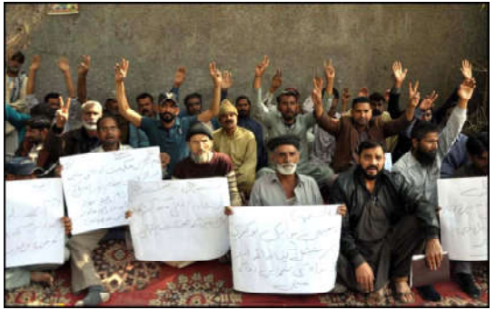
HYDERABAD: Terminated employees of Municipal Corporation Hyderabad are holding protest demonstration for restoration of their jobs, at Hyderabad press club.