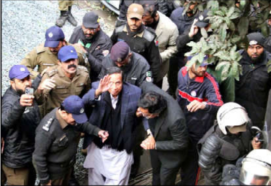
LAHORE: Former Chief Minister Punjab and Tehreek-e-Insaf (PTI) President, Chaudhry Parvez Elahi arriving for case hearing, at District Court in Lahore.

KARACHI (APP): Caretaker Federal Minister for Information, Broadcasting and Parliamentary Affairs Murtaza Solangi on Thursday said that the caretaker government was fully prepared and committed to conduct general elections on February 8. He was addressing a seminar on "Challenges and Roadmap for the New Government", organized by the Press Information Department. The minister said that as the government's spokesperson, he had been reiterating the caretaker government's commitment for holding elections as per the schedule given by the Election Commission of Pakistan. "The election process should continue in any case and major issues facing the country, including economy, foreign policy, local governments, governance and civil service reforms, should also be discussed to find their solution," he remarked. Solangi said that despite many flaws in the democratic system and electoral process, everyone was in agreement that the electoral process should not be stopped and elections should be held. He said that since the formation of the caretaker cabinet on August 17, 2023, the government had been consistently reiterating its commitment that the elections would definitely be held and also on the scheduled date of February 8.