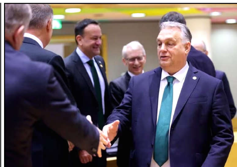
Hungary's Prime Minister Viktor Orban attends a European Union summit in Brussels, Belgium.