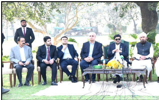
KARACHI: Sindh Governor Kamran Khan Tessori addressing a press conference at governor house.