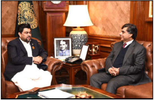
KARACHI: Caretaker Interior Minister Dr. Gohar Ejaz meeting with Sindh Governor Kamran Khan Tessori at governor house.

ISLAMABAD (APP): Caretaker Prime Minister Anwaar-ul-Haq Kakar on Thursday directed to improve the performance of the Drug Regulatory Authority of Pakistan (DRAP) and accelerate action against drug smugglers and hoarders. Chairing a meeting of the Federal Cabinet, the prime minister instructed to compile the recommendations for necessary legislation regarding the deregulation of drug prices and its onward presentation before the Parliament by the next elected government. Addressing the cabinet meeting, he said the government was taking all possible steps to provide medicines to the common man at reasonable prices. He further said the government was framing such policies which would benefit the common man and also help develop the pharmaceutical industry. The cabinet approved the increase in the prices of 146 essential life-saving medicines, keeping in view the rising prices of their raw material in the global market under the hardship category. The meeting was informed by the Ministry of National Health Services and DRAP that through the online portal of the Authority, citizens could file complaints regarding the non-availability of medicines in the market.