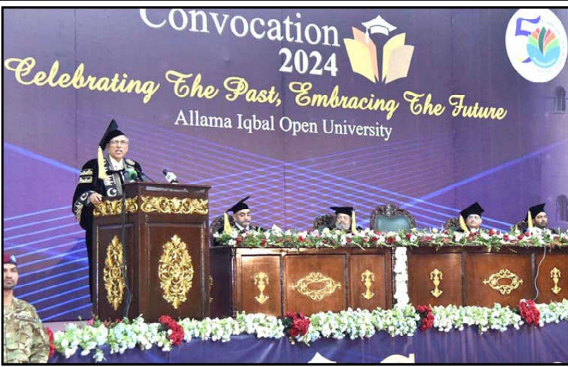
ISLAMABAD: President Dr. Arif Alvi addressing the convocation of Allama Iqbal Open University (AIU) at Jinnah Convention Centre.