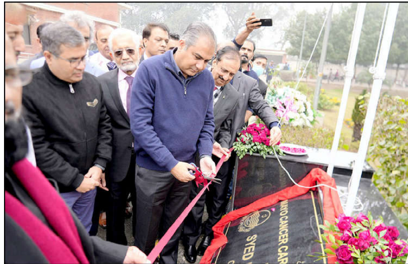
LAHORE: Caretaker Chief Minister Punjab Mohsin Naqvi cutting the ribbon to inaugurate Mayo Cancer Care Hospital Manawan.

King Edward Medical College University. A state of the art hospital has been built for the treatment of cancer patients at the government level, he added. The CM apprised that the cancer treatment is highly expensive which a common man cannot afford, adding that free treatment will be provided to the patients in this hospital. It is a dire need of the people of Punjab to have a high-quality cancer hospital at the government level. It is the foremost responsibility of the government to provide a state of the art hospital for cancer patients at the government level, he added. CM Naqvi while addressing the inaugural ceremony of the Mayo Cancer Care Hospital apprised that the first complete cancer care hospital of Punjab has been established.