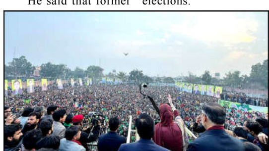
NAROWAL: Senior Vice President PML-N Maryam Nawaz addressing a public gathering in Zafarwal.

Bilawal said the former PTI chairman used to call the political opponents thieves, adding that if the people attached to the PTI founder were "angels".