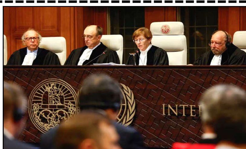
President of the International Court of Justice (ICJ) Judge Joan Donoghue speaks during a hearing in a case whereby Ukraine accused Russia of violating an anti-terrorism treaty by funding pro-Russian forces, including militias who shot down the Malaysia Airlines flight MH17, and discrimination, in The Hague, Netherlands.

border, with some urging direct strikes on Iran itself. But Biden's administration believes hitting Iranian territory could cause the region to erupt, with strikes on Iranian-backed militias and possibly on Iranian Revolutionary Guard facilities in other countries more likely, US media reported. "It's very possible that what you'll see is a tiered approach here, not just a single action but potentially multiple actions," National Security Council spokesman John Kirby told reporters aboard Air Force One. Secretary of State Antony Blinken said that the response "could be multi-leveled, come in stages, and be sustained over time."