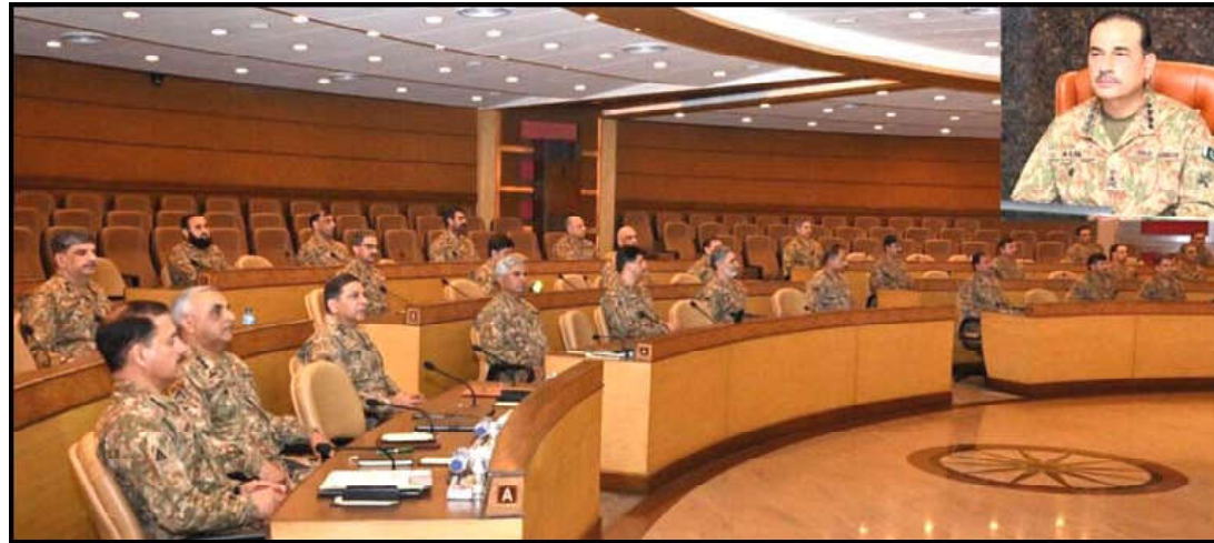
RAWALPINDI: Chief of Army Staff (COAS) General Syed Asim Munir chairing the 262nd Corps Commanders' Conference (CCC) at the General Headquarters.

"The PML-N has not seen as much relief as they (PTI) are getting from courts today," she claimed.