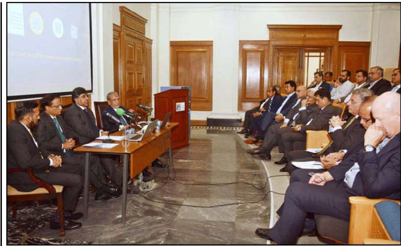
KARACHI: Federal Minister for Interior, Commerce, Industries, Overseas Pakistanis and Investment, Dr. Gohar Ejaz addressing to foreign and local investors at Overseas Chamber of Commerce and Industry Karachi.