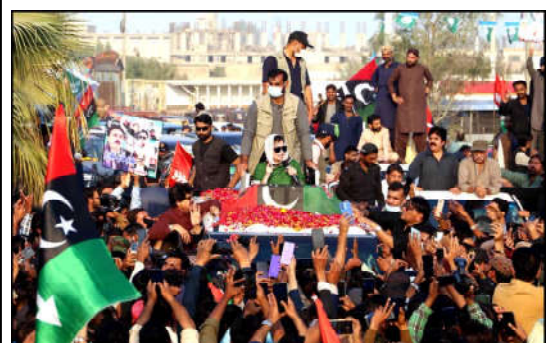
HYDERABAD: Peoples Party (PPP) Leader, Aseefa Bhutto Zardari addresses during election campaign rally in connection of General Election 2024 coming ahead, at Fatch Chowk in Hyderabad.