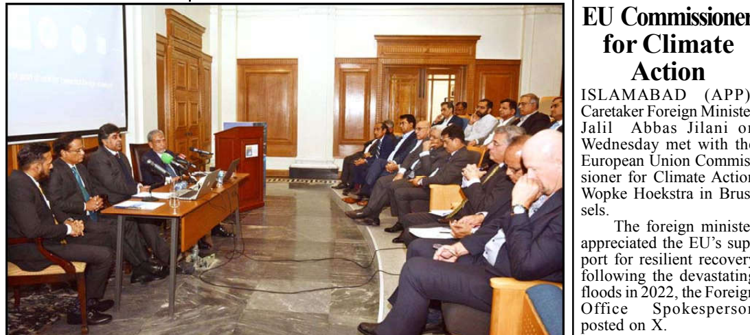
KARACHI: Federal Minister for Interior, Commerce, Industries, Overseas Pakistanis and Investment, Dr. Gohar Ejaz addressing to foreign and local investors at Overseas Chamber of Commerce and Industry Karachi.

The Provincial Election Commissioner along with Joint Provincial Election Commissioner also visited the storage place of ballot papers and other sensitive election material. He directed the polling staff to fully implement the instructions of the Election Commission regarding the delivery of election materials, transport and security arrangements.