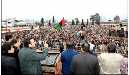
Chairman Pakistan People's Party Bilawal Bhutto Zardari is addressing the election rally of Pakistan People's Party in Malakand district.

The PTI founder left for his barrack after saying this.