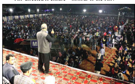
KARACHI: Jamiat-e-Islami (JI) Karachi Chief, Hafiz Naeem-ur-Rehman addresses to participants during Aptitude Test Examination ceremony of the IT courses program under "Bano Qabil Mega Project" organized by Al-Khidmat Foundation, held at Orangi Town area in Karachi.

HYDERABAD (APP): The Hyderabad Electric Supply Company (HESCO) during the ongoing operation against power thieves and defaulters detected 409 more power theft connections in the last 24 hours, including one industrial, five commercial and 403 domestic connections. The HESCO authorities disconnected all these connections and issued detection bills of 199,698 units worth of 5.945 million rupees to the consumers involved in the theft.