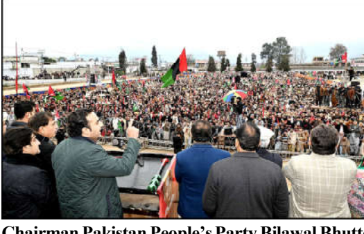
Chairman Pakistan People's Party Bilawal Bhutto Zardari is addressing the election rally of Pakistan People's Party in Malakand district.

"We will try both with and without the govern-ment to do our job to address the challenges people faced today," he said while highlighting the urgency for the next elected government to address the poly crises such as culture of intolerance. extreme polarization amid the heavily divided global landscape.