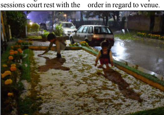
ISLAMABAD: Children are playing with Hail outside their house at sector I-8 after the heavy Hail Strom in the Federal Capital.

high court rules and section 352 of criminal procedure will be applicable only when sessions court passes