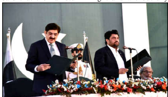
KARACHI: Governor Sindh, Kamran Khan Tessori administering the oath to the Newly-elected Chief Minister Sindh, Syed Murad Ali Shah.

hesitation". On February 27, 2019, the Pakistan Air Force (PAF) had shot down two Indian planes that had violated Pakistani airspace. One of the Indian pilots was captured by Pakistan, but was later handed over as a gesture of peace. A press release issued by the army's media wing, the Inter-Services Public Relations (ISPR) today, said: "Feb 27, 2019, marked a significant event in our history, demonstrating the resolve of the people of Pakistan and the professionalism of the armed forces in response to unwarranted aggression from India, motivated by political considerations and electoral concerns."