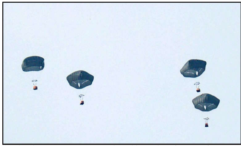
AID is being dropped by a Jordanian military aircraft over Rafah, southern Gaza Strip.