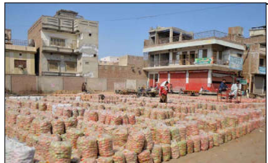
MULTAN: Vendor displaying tomato bags for bidding at Vegetable Market.

BEIJING (APP): Pakistan and China have decided to start a new phase of China Pakistan Economic Corridor (CPEC) with a lot of focus on industrial cooperation, agriculture, mining and energy.