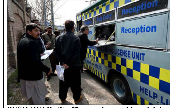
PESHAWAR: Traffic warden making driving licenses through DL-Van for journalists in front of Press Club.