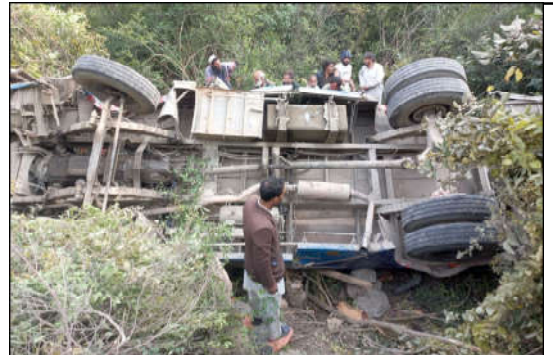
HARIPUR: People rescue victims of a passenger bus accident at a road, as a passenger bus fell into a ravine in Sarbrot area of Haripur, more than 12 people died and 15 people were injured.