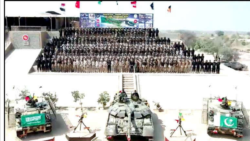
On job training of Royal Saudi Land Forces with Pakistan Army concludes in Multan.

Assembly Speaker Raja Pervaiz Ashraf summoned the maiden sitting of lower house of Parliament on Feb 29 as President Arif Alvi refused to summon the session on account of an 'incomplete house'. APP adds: The Election Commission of Pakistan (ECP) on Tuesday began issuing nomination papers to candidates for the presidential election. According to an ECP spokesperson, the candidates can submit their nomination papers at the Election Commission Secretariat in Islamabad, as well as the offices of provincial election commissioners in Punjab, Sindh, Balochistan, and Khyber Pakhtunkhwa till 12 noon pm on March 2.