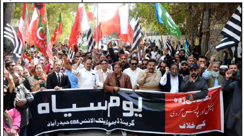
HYDERABAD: Workers of GDA, PTI, JUI(F), JI and Awami Tehreek hold a protest rally against alleged rigging in general election 2024 and observe Black Day against torture and arrest of the workers of Sindhyani Tehreek and JUI (F) during a rally in Karachi.