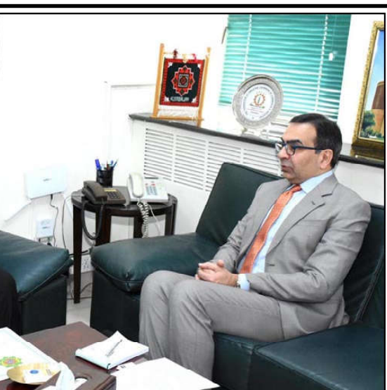
ISLAMABAD: Ambassador of Turkmenistan H.E. Atadjan Movlamov called on Interim Federal Minister for Energy Muhammad Ali.

LAHORE (APP): Lahore Electric Supply Company (LESCO) has detected a total of 57,806 connections from where the customers were pilfering electricity in all its circles of five districts (Lahore, Sheikhpura, Nankana Sahib, Kasur and Okara) in 167 days of grand anti-power theft campaign.