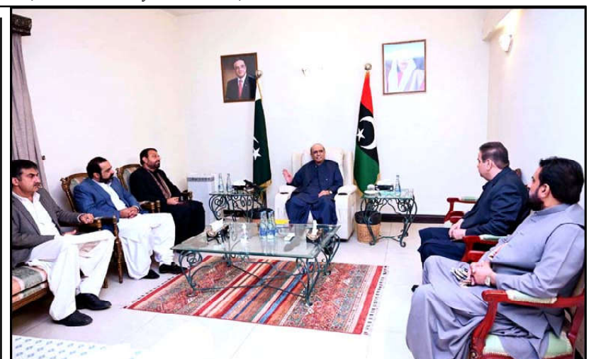
ISLAMABAD: Peoples Party (PPP) Co-Chairman, Asif Ali Zardari exchanging views with a delegation of Awami National Party (ANP) led by Zamarud Khan, Dawood Khan and Nawabzada Umar Farooq during meeting held in Islamabad.