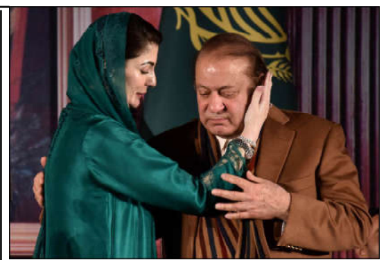
LAHORE: Newly-elected Chief Minister Punjab Maryam Nawaz gives congratulatory hug to her Father Former Prime Minister Nawaz Shareef after taking oath at Governor House.

As per the initial police report, the accident occurred due to overspeeding.