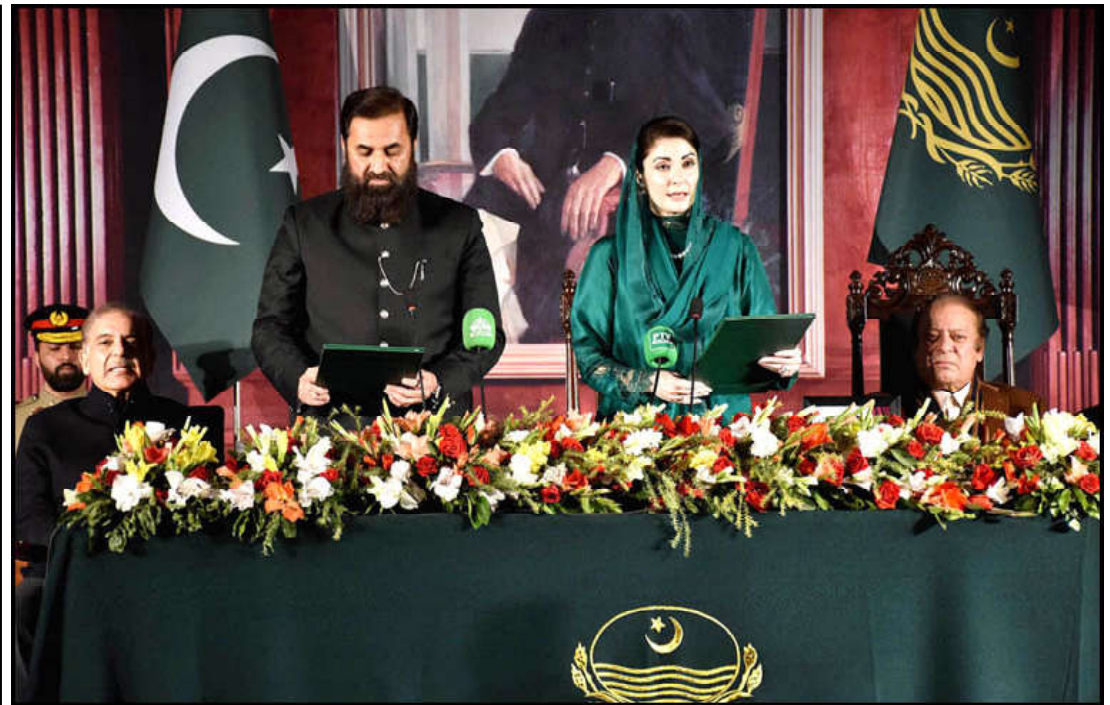
LAHORE: Governor Punjab Baligh Ur Rehman administering the oath to the Newly-elected Chief Minister Punjab Maryam Nawaz at Governor House.

The sources said that the decision was made during an emergency meeting headed by NA speaker and attended by the officials of the NA Secretariat and constitutional experts. The NA speaker decided to call the session under Article 91 (2), the sources added. There was no constitutional hurdle in summoning the NA session despite the president's denial, constitutional experts briefed the speaker. The president was bound by the law to convene the NA session within 21 days after the elections, they added.