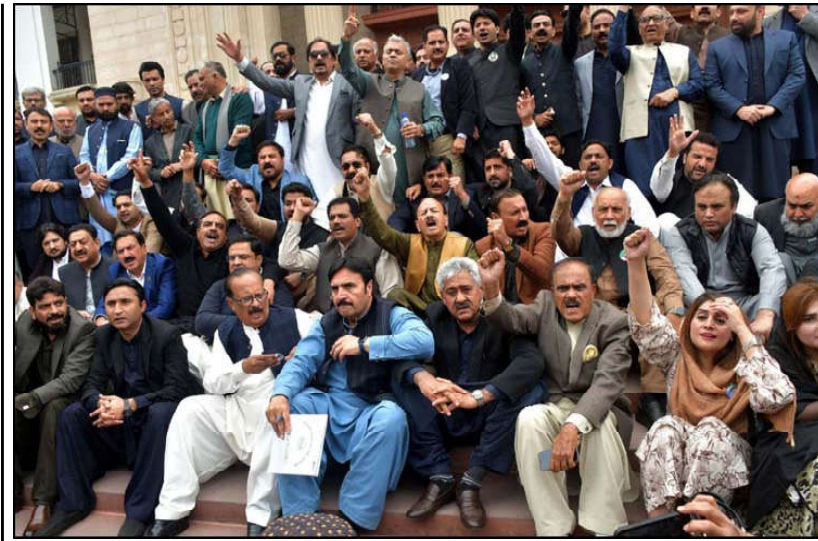
LAHORE: Opposition leaders in Punjab Assembly are holding protest demonstration against alleged rigging in General Election 2024, at Punjab Assembly in Lahore.