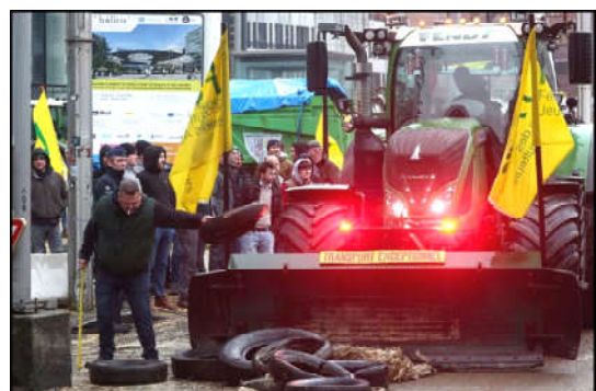
A man holds a fire during a protest of European farmers over price pressures, taxes and green regulation, on the day of an EU Agriculture Ministers meeting in Brussels, Belgium.

Mr Sullivan said "there will have to be indirect discussions by Qatar and Egypt with Hamas because ultimately they will have to agree to release the hostages". His comments follow an Israeli official's statement to CNN that Tel Aviv will send a delegation to Qatar to continue talks on the release of prisoners and a pause in military operations in Gaza. Axios, a US media outlet, mentioned that the delegation would have a "limited mandate" and that the talks would be "technical". Responding to a question about Israeli premier's post-war Gaza plan, Mr Sullivan expressed concerns, saying, "From what I've seen in the reporting, I have some concerns." On Thursday, Mr Netanyahu presented a document to his cabinet, seeking open-ended control over security and civilian affairs in the Gaza Strip.