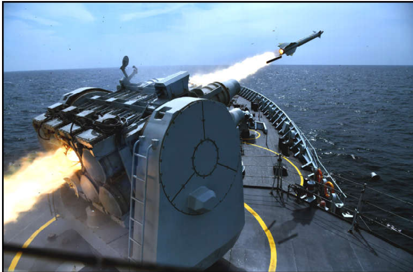
Pak Navy demonstrates successful shooting down of aerial target by Surface to Air Missile.

We have also faced difficult times when every tide was against us, and cruelty and brutality were inflicted on us. But thank God, we did not leave the field," she stressed.