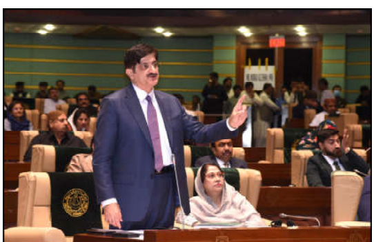
KARACHI: Syed Murad Ali Shah Speaker on the Assembly floor after being elected as Chief Minister of Sindh.

He reiterated the resolve of Pakistan Navy to ensure seaward defence of Pakistan and safeguard national maritime interests at all costs.