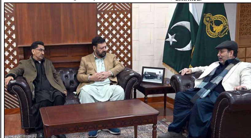
ISLAMABAD: Chief Minister Gilgit-Baltistan Haji Gulbar Khan is meeting with Governor Gilgit-Baltistan Syed Mehdi Shah.

Youths aspiring to migrate to Europe were enticed by traffickers who collected between Rs 2.5 to Rs 3 million per person. The traffickers told the youths that they would take them first to Libya by air from where they would travel to Italy by boat.