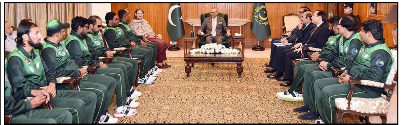
ISLAMABAD: Pakistan Blind Cricket team called on the President Dr. Arif Alvi at Aiwan-e-Sadr.