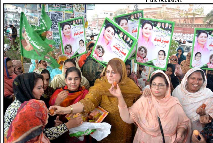
MULTAN: Activists of Muslim League (PML-N) are distributing sweets among each other after Maryam Nawaz elected as Chief Minister Punjab during celebration demonstration, in Multan.

ISLAMABAD (APP): Caretaker Minister for Information, Broadcasting and Parliamentary Affairs Murtaza Solangi Monday informed the Senate that around 71,000 Out-Of-School Children (OOSC), out of 81,000, had been brought back in educational institutes of the federal capital, with 86 per cent enrollment. Responding to a motion regarding the increasing number of out-of-school children and its impact on the country's future, he said, that last year during an inter-ministerial conference, which is one of the biggest forums, provinces had been asked to play their active role in increasing enrollment of the OOSC in educational institutes.