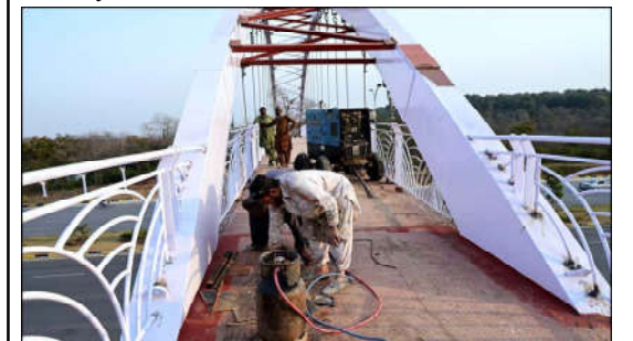
ISLAMABAD: A welder finishing grills of a new pedestrian bridge over the Srinagar Highway in the Federal Capital.

ISLAMABAD (APP): Caretaker Minister for Sports, Culture, and Youth Affairs Sindh Dr. Syed Junaid Ali Shah on Sunday emphasized the importance of government support in unlocking the potential of the Pakistani film industry. Speaking to a private news channel during the screening of the movie 'Texali Gate' in Karachi, Dr. Shah emphasized the need for significant improvement in the Pakistani film industry. He highlighted the challenges faced by the film industry in the era of commercialization. He proposed that the government should either provide subsidies or support cinema houses to make movie tickets more affordable for the general public. Dr. Shah underscored the untapped potential within the film industry, emphasizing that with government attention and patronage, the industry could flourish. Ayesha Umar, the producer and leading actress of the film, expressed optimism about the success of 'Texali Gate,' describing it as a portrayal of the harsh realities.