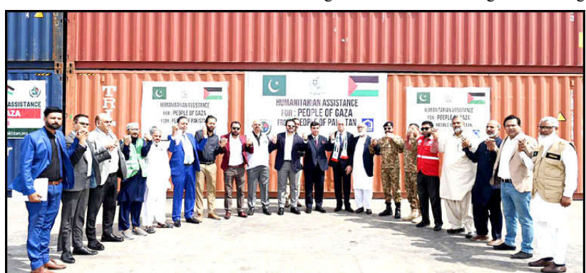
ISLAMABAD: 7th consignment of relief goods being dispatched for the people of Gaza from Government of Pakistan.

Moreover, for the first landing, the airplane's landing gears were opened, however at the second landing time one of the pilots again closed the landing gear.