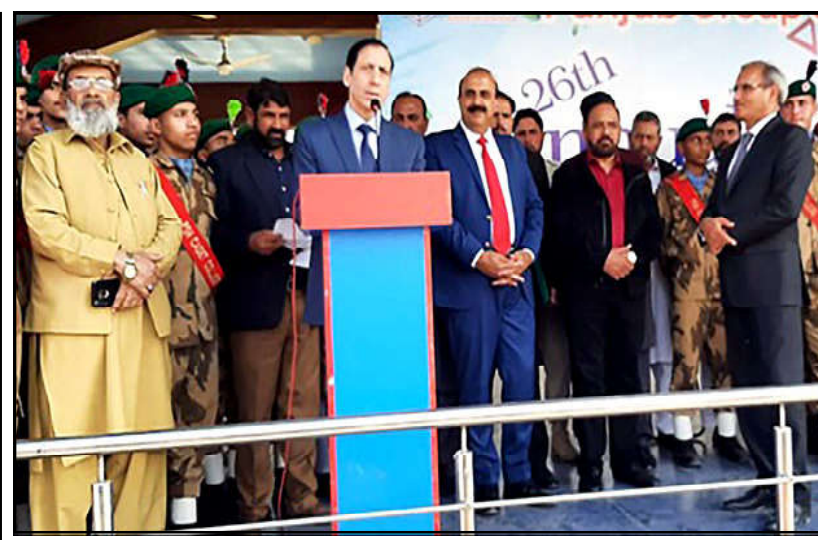
ISLAMABAD: Caretaker Chief Minister Khyber Pakhtunkhwa Justice (retd) Syed Arshad Hussain Shah addressing during a ceremony at Pakistan Sweet Home.