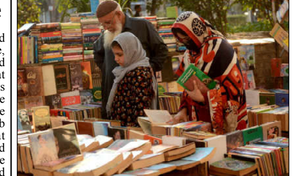
LAHORE: People selecting and purchasing old books from a roadside setup at Mall Road.

the people of province, ensuring law and order, restoration of health cards and to improve the education system of KP. He said the PTI founder picked a team that won the world cup [in 1992] and he would adopt same passion to elect the provincial cabinet. The PTI's candidate for KPC's slot said that 55 percent of the newly-elected members of his party were those who won for the first time. The recent elections have exposed the turncoats and separated them from those who were loyal to the party, he added.