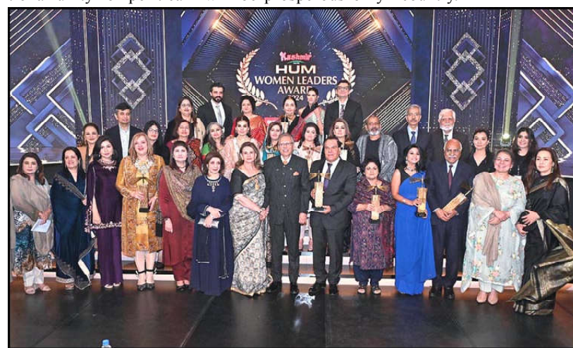
ISLAMABAD: President Arif Alvi, in a group photograph, with the organizers & recipients of the awards at the 5th edition of HUM Women Leaders Awards-2024 ceremony held at the Jinnah Convention Center.