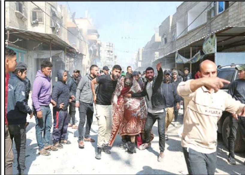
Palestinians help an injured man at the site of a strike on a house in Rafah.

camp, tempers are rising and on Friday dozens of people held an impromptu protest. "We didn't die from air strikes but we are dying from hunger," said a sign held by one child. In the camp, bedraggled children waited expectantly, holding plastic containers and battered cooking pots for what little food is available. Residents have taken to eating scavenged scraps of rotten corn, animal fodder unfit for human consumption and even leaves. Gaza's health ministry said a two-month-old baby identified as Mahmud Fathu had died of "malnutrition". "The risk of famine is projected to increase as long as the government of Israel continues to impede the entry of aid into Gaza," as well as access to water.