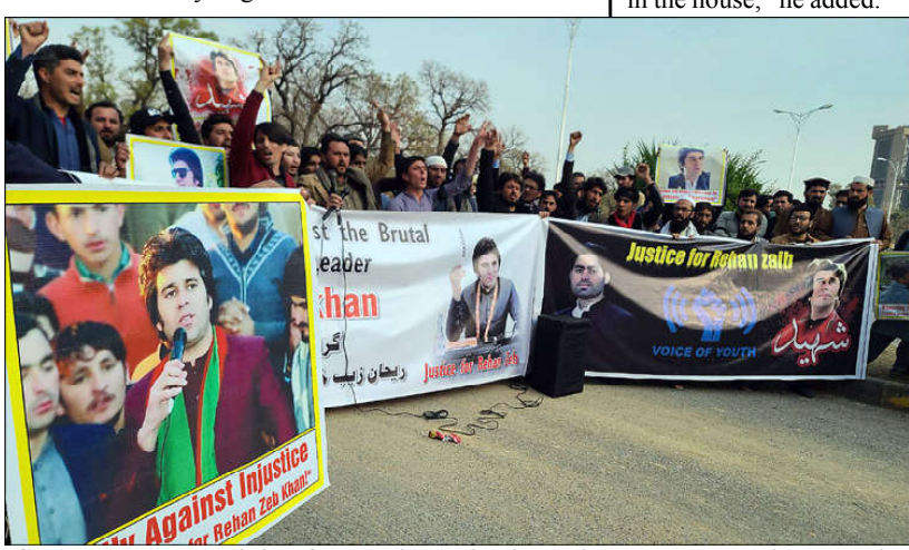
ISLAMABAD: Activists from Tribal District Bajaur protest against the killing of a young political leader