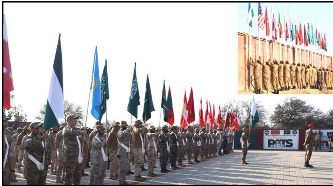
7th International Pakistan Army Team Spirit Exercise-2024 opened at the National Counter Terrorism Centre at Pabbi.

Vol. XIV No. 46 Reg. mails-B / ID-445 Monday February 26, 2024, Shaban 15, 1445 A.H. Ph: 2158688, 2158997 Pages 4: Rs. 12