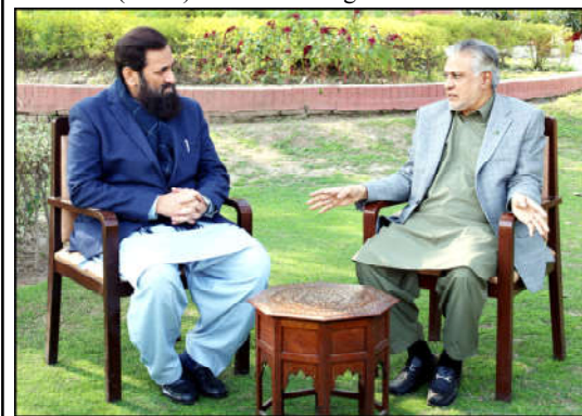
LAHORE: Governor Punjab Muhammad Balighur Rehman meeting with leader of the house in Senate Ishaq Dar.

He also expressed his gratitude for the support of the people in electing him as MPA. The speaker said that it was a proud moment for him. He said this assembly passed a resolution for the creation of the nation. The father of the nation, Quaid-e-Azam Mohammed Ali Jinnah, sat in this assembly, adding that Liaquat Ali Khan waved the Pakistani flag here.