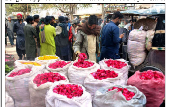
HYDERABAD: A vendor displaying the rose flowers to attract the customers in connection with shab-e-barat at flowers market.

work and passion of the organizers of Defense Welfare Society who are providing technical education to students in this era of inflation, which is valuable and praiseworthy.