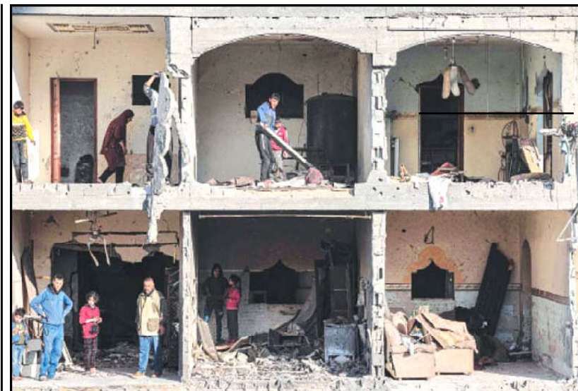
Palestinian men check whatever is left of the homes in a building hit by over-night Israeli air strikes in Rafah refugee camp in the southern Gaza Strip.

have shipping through the Red Sea, instead of transit having to move some other way because you've got missiles being launched into (the area) with relatively good accuracy. "Nearly all the instability that takes place in the Middle East is as a direct result of that regime in Iran. The United States had the lead in deterring them and we've lost that." Pompeo praised Saudi Aramco for stabilizing oil markets following an attack claimed by the Iran-backed Houthis on its facilities in Abqaiq-Khuras in eastern Saudi Arabia, but pinpointed that attack as the beginning of the end of the US and the West being able to deter Tehran.