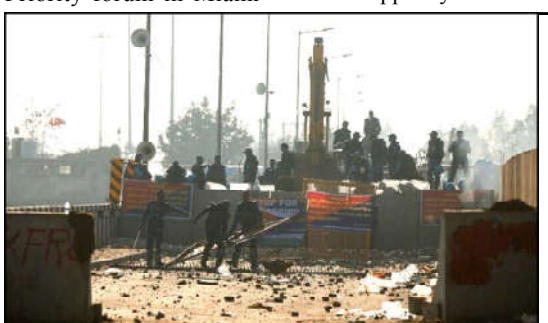
Police move a makeshift barricade at the site of a protest as farmers march towards New Delhi to push for better crop prices promised to them in 2021, at Shambhu Barrier, the border between Punjab and Haryana states, India.

whelming majority," he told the Security Council. China is aware that the United States has tabled its own draft resolution. China hopes that the United States will show a responsible attitude, respond positively to the international call and respect the established consensus among Security Council members, said Zhang. "We need to point out that the essence of any action of this council is to achieve an immediate cease-fire." Any message sent out via our action must be clear, unequivocal, unambiguous, and unmistakable, rather than prevaricate or beat about the bush," he said. "At this point, the Council needs to demonstrate a strong resolve rather than negotiating skills only." The military offensive into Rafah must cease immediately, he said, according to XINHUA.