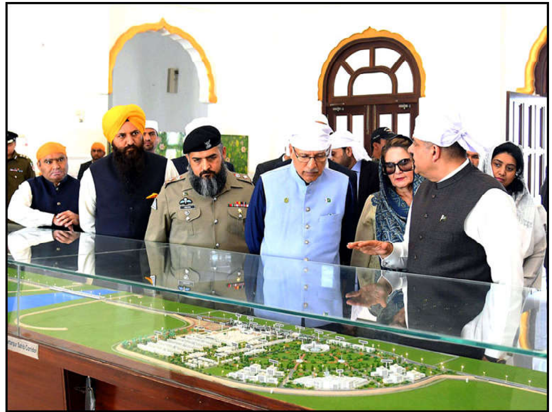
NAROWAL: President Dr. Arif Alvi being briefed about the Kartarpur Corridor.

She said that during the tenure of the interim government, the authorities had "maintained economic stability".