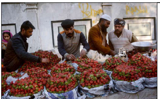
LAHORE: Vendors arranging and displaying strawberry to attract the customers.