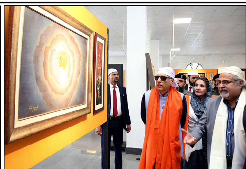
NAROWAL: President Dr Arif Alvi visiting different sections of the Kartarpur Corridor.