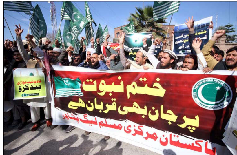
PESHAWAR: Activists of Markazi Muslim League (PMML) are holding protest demonstration against supreme court ruling, at Peshawar press club.

The court accepted the plea for his meeting with his wife