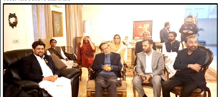
LAHORE: A delegation of MQM including Governor Sindh Kamran Khan Tessori, Syed Muastafa Kamal and Farooq Sattar meeting with PMML-Q Chaudhry Shujaat Hussain.

Delivering the oral statement on behalf of Pakistan, the Federal Minister for Law and Justice said that Israeli occupation continued to severely impede the exercise of the right to self-determination by the Palestinians. "Through its illegal settlement policy, Israel is trying to create irreversible facts on the ground; perpetuate its illegal occupation, and deny access to the Holy places in Jerusalem. Israeli policies and practices amounted to systematic racial discrimination and apartheid against the Palestinians. The ICJ would fail to discharge its judicial functions if it did not stop Israel from profiting "from its own continuing grave wrongs," the statement added.