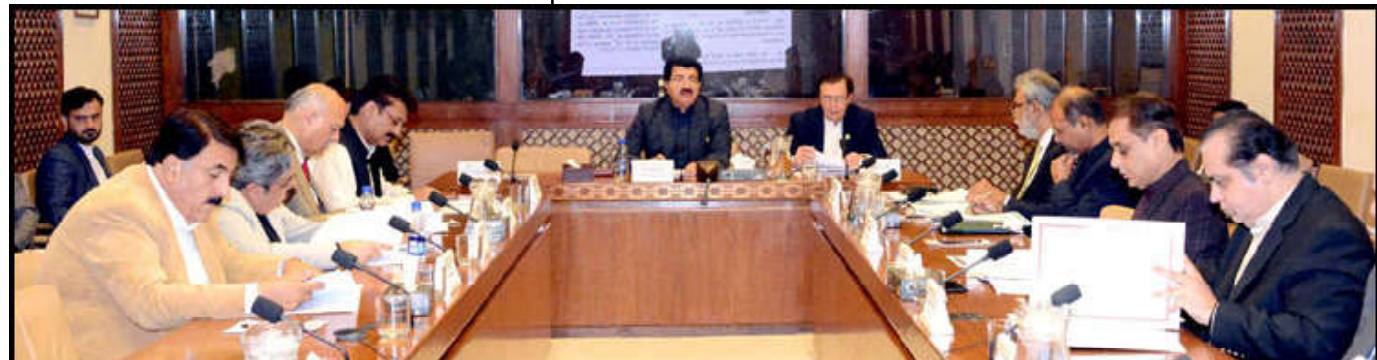
Chairman Senate, Muhammad Sadiq Sanjrani presiding over a meeting of the Senate Finance Committee at Parliament House, Islamabad.

On the occasion of the International Day of Social Justice, the Islamabad Employees Social Security Institution (IESSI) with the collaboration of the International Labour Organization (ILO) Pakistan and the Labour Department ICT organized a free medical camp for the brick kiln community here on Friday.