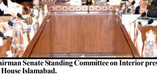
Senator Mohsin Aziz, Chairman Senate Standing Committee on Interior presiding over a meeting of the Committee at Parliament House Islamabad.

The chairman committee however was of the view that the enhancement of sentences as proposed by the Mover are not reasonable as the same will be misused. The bill however was passed with amendments. The Bill further amended the Code of Criminal Procedure, 1898 [The Criminal Laws (Amendment) Bill, 2024] introduced by Senator Samina Mumtaz Zehri on Amendments in Sections 3, 4 & 5 of the Ordinance was withdrawn by the mover as the Ordinance in which the amendment was being proposed has already been repealed by an Act of