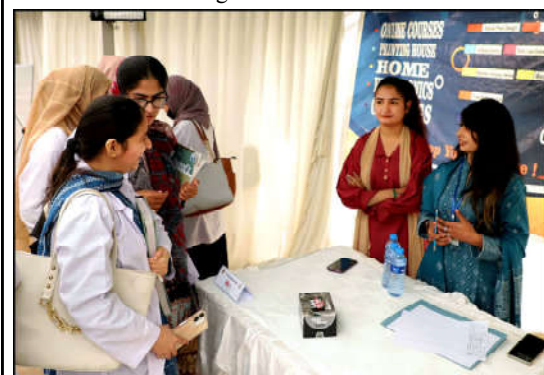
HYDERABAD: Participants visiting a stall during Job fair at Isra University.

He urged the Pakistan and Saudi Arabia to focus on further improving bilateral trade and investment relations that would create new jobs and bring prosperity to both countries.