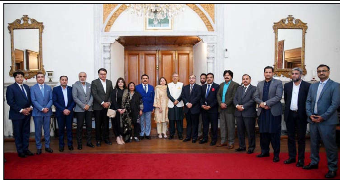
LAHORE: President Dr. Arif Alvi in a group photo with a delegation of the Lahore Chamber of Commerce and Industry, who called on him, at Governor House.