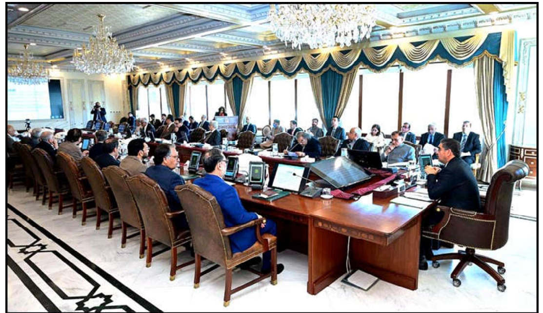
ISLAMABAD: Caretaker Prime Minister Anwaar-ul-Haq Kakar chairs a meeting of the Caretaker Federal Cabinet.