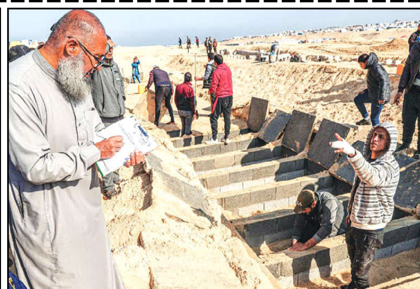
GAZASTRIP: A man records the names of the deceased during the funeral of Palestinians killed in overnight Israeli strikes at a cemetery in Rafah.

in Ukraine, the death of Russian opposition leader Alexei Navalny and U.S. assertions that Russia plans to put a nuclear weapon in space have led to the biggest crisis in relations between Russia and the West since the Cold War. Some Russian and U.S. diplomats say they do not remember a time when relations between the world's two biggest nuclear powers were worse, including during the 1962 Cuban Missile Crisis. Biden said last week after prison officers announced Navalny's death in a Russian penal colony that it was "a consequence of something that Putin and his thugs did." Navalny had previously accused Putin of trying to kill him, an allegation the Kremlin denied.