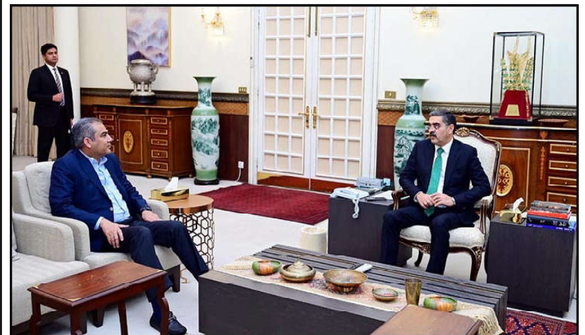
ISLAMABAD: Caretaker Chief Minister of the Punjab Syed Mohsin Raza Naqvi calls on Caretaker Prime Minister Anwaar-ul-Haq Kakar.