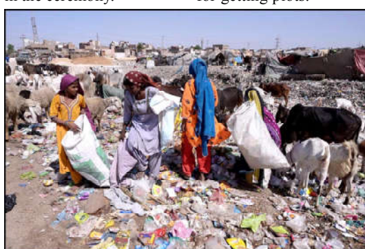
HYDERABAD: Gypsy women searching for the valuable items from heap of garbage at Latifabad area.