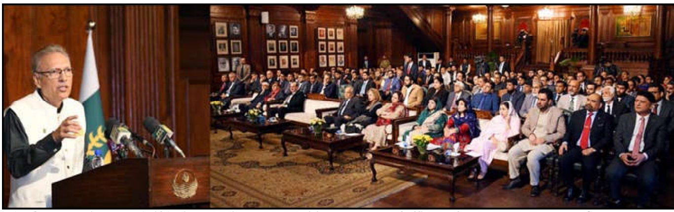
LAHORE: President Dr. Arif Alvi addressing the recognition ceremony of officers of the Federal Insurance Ombudsman and representatives of insurance companies, at Governor House.