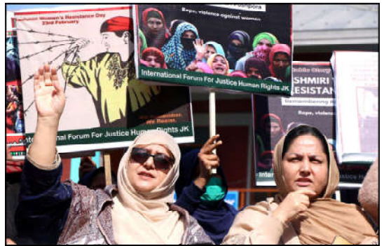
MUZAFFRABAD: Women activists of International forum for justice shouting slogans during protest ahead of Kashmiri Women's Resistance Day 23rd February, in the city.

ganda, lies, defamation of government officials and harassment, and the companies owning these platforms would have to control this illegal activity. "The state of Pakistan will not in any way allow these platforms to spread baseless, false and fabricated propaganda in the country", he added. The minister said if this baseless propaganda was not stopped by these social media platforms, the state would have to take strict measures under the law. He said there were means of legal review against any decision of the judiciary and if anyone had a complaint, a review petition could be filed.