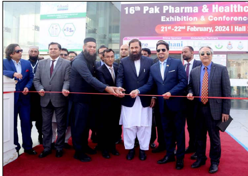
LAHORE: Governor Punjab Muhammad Balighur-Rehman inaugurates 16 th Pak Pharma and Health Care Exhibition at Expo Center Lahore.

He said that organising Pak Pharma and Healthcare Exhibition is a good initiative which will give boost to the pharmaceutical industry. Governor Punjab said that it is encouraging to see that 115 foreign and local exhibitors are participating in this exhibition. He said that he appreciates the organizers of the exhibition for their efforts in arranging this exhibition regarding pharmaceuticals manufacturing and associated health related products and services. Governor Punjab said that this exhibition will provide an excellent opportunity to all those who are interested in promoting their products and services. Governor Punjab further said that the Punjab government is fully focused on providing international standard medical services in the provincial hospitals. Governor Punjab said that it is a good sign that Pakistani pharmaceutical companies are exporting medicines to different countries of the world, which is increasing the country's foreign exchange. In response to a question, Governor Punjab Muhammad Balighur Rehman said that it is the responsibility of the government to maintain balance in the regulation of drug prices.