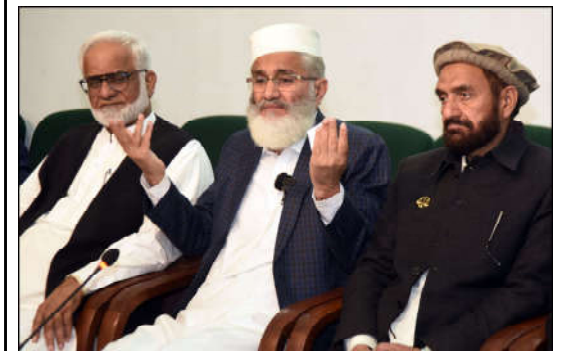
ISLAMABAD: Feb21- Leader of Jamaat-e-Islami Siraj-ul-Haq addressing press conference at Al-Falah Hall sector F-8, in the Federal Capital.