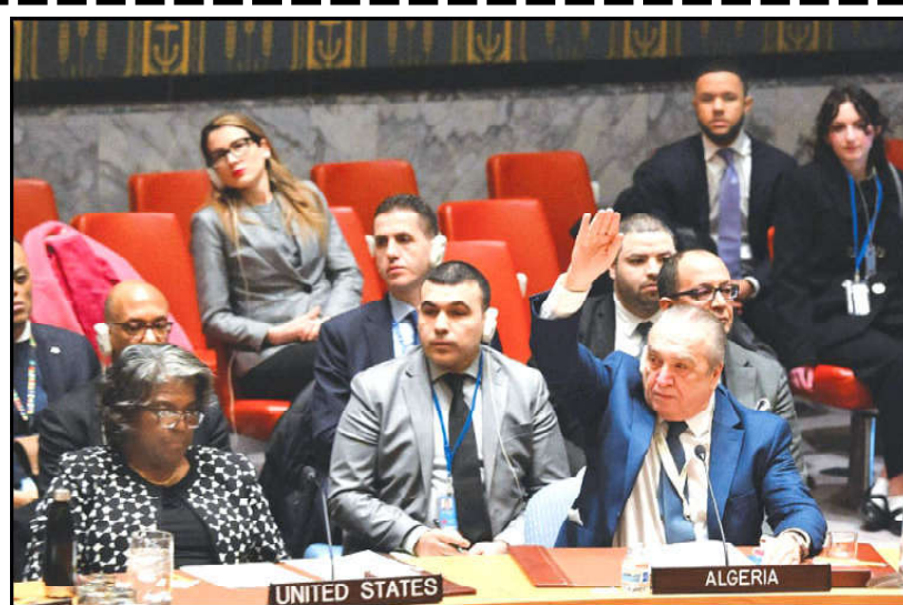
US Ambassador Linda Thomas-Greenfield is seen alongside Algerian Ambassador Amar Bendjama during a UN Security Council vote calling for a ceasefire in Gaza, at UN Headquarters.

spected by all parties". The latest Council meeting on the Middle East crisis spiralling outwards from the war in Gaza has ended, with another US veto and an abstention on the part of the UK, while Algeria's resolution gained support from 13 out of the 15 members around the iconic horseshoe table. Qatar's Ambassador Alya Ahmed Saif Al-Thani speaking on behalf of the Gulf Cooperation Council, called on the UN to assume its responsibilities and condemn the Israeli threat of unleashing its military operation in Rafah. More than a million displaced are sheltering there with nowhere else to run to. "We are living the worst humanitarian disaster the world has ever seen," she said. "We also condemn the forced displacement of civilians and regret the suspension of the financing of UNRWA," she said. For its part, Qatar will continue its facilitating efforts to free all hostages, to protect civilians in Gaza and to secure a ceasefire. Riyad H. Mansour, Ambassador and Permanent Observer of the State of Palestine, said the Algerian-led draft resolution was brought to the Council "precisely" because Israel persists with its onslaught "despite near unanimous" calls by the international community for a ceasefire.