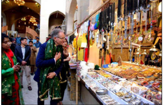
LAHORE: Australian High Commissioner, H.E. Neil Hawkins with Embassy delegation visiting stall during visit to the shrine of Bibi Pakdaman.