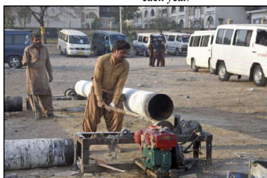
ISLAMABAD: Labourers are busy installing new water pipeline at sector F-5 in the Federal Capital.