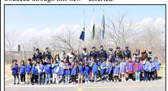
ISLAMABAD: A group photo of the private school children who visited Islamabad Capital Police Traffic Office, Faizabad.