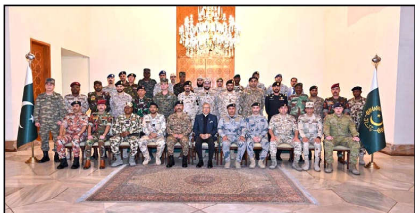
ISLAMABAD: President Dr Arif Alvi in a group photo with a delegation of military officers from friendly countries undergoing training at Command and Staff College Quetta, at Aiwan-e-Sadr.