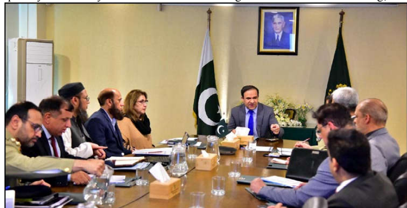
Caretaker Federal Minister for IT and Telecommunication, Dr. Umar Saif chairing meeting regarding Spectrum Availability in Islamabad.