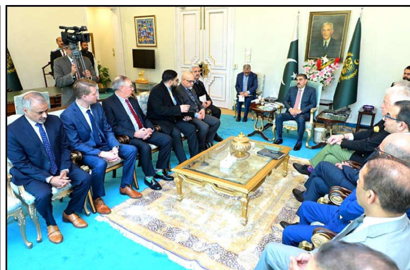
ISLAMABAD: A delegation of Miracle Salt Collective Inc called on Caretaker Prime Minister Anwaar-ul-Haq Kakar.