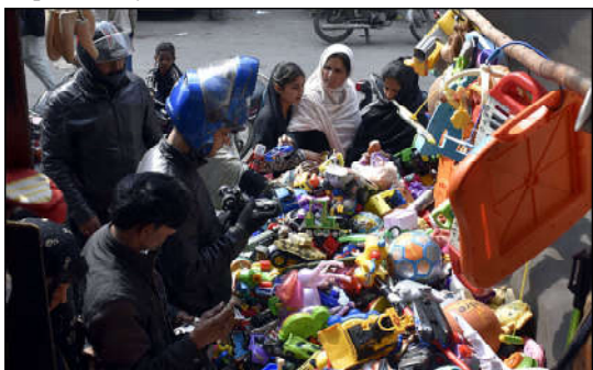
LAHORE: People are busy buying secondhand toys at a Landa bazaar in Provincial Capital.