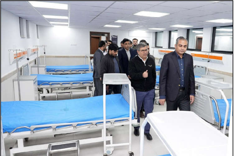
LAHORE: Caretaker Chief Minister Punjab Mohsin Naqvi inspecting the Newly Installed Beds after inauguration of upgraded Surgical Block, Medical Block and Admin Block at Services Hospital.