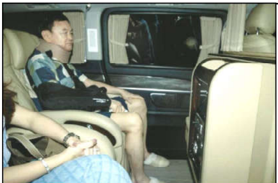
Former Thai Prime Minister Thaksin Shinawatra arrives at his family compound following his release.

The Health Ministry is part of the Hamas-run government in Gaza but maintains detailed records of casualties. Its figures from previous wars in Gaza have largely matched those of U.N. agencies, independent experts and even Israel's own tallies.