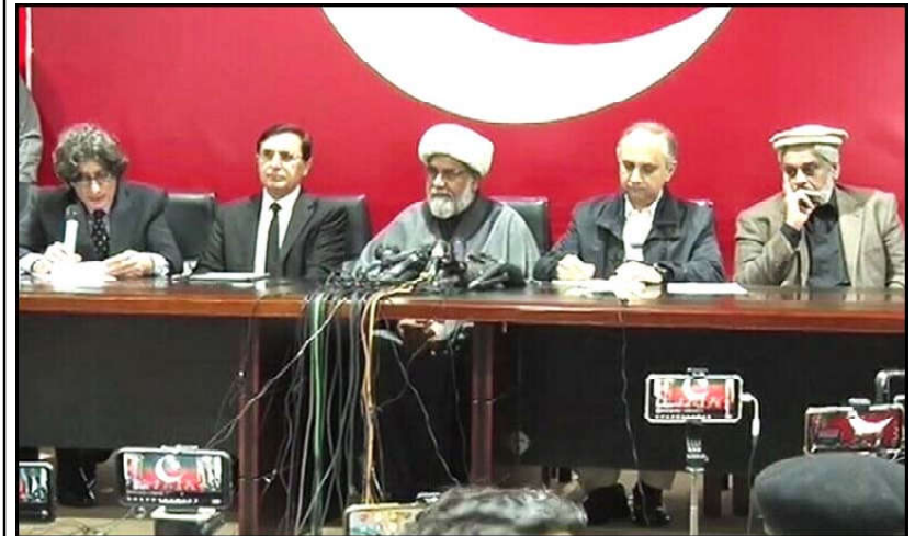
ISLAMABAD: Leaders of Pakistan Tehreek-e-Insaf (PTI) and Sunni Ittehad Council (SIC) addressing a Press conference

Prime Minister Kakar said that there should be no doubt about the government's commitment to the noble civil servants serving the State and the people of Pakistan.