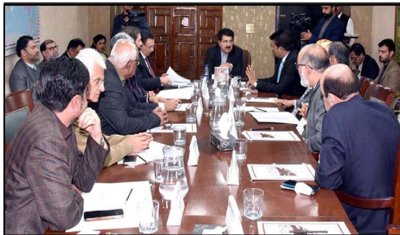
ISLAMABAD: Chairman Senate, Muhammad Sadiq Sanjrani presiding over a Senate House Business Advisory Committee meeting at Parliament House.

The PTI top leader said the PTI will also submit documents to the ECP in this regard today. During the presser, the PTI leader also reiterated the rigging allegation claiming that his party had won 180 NA seats in the February 8 polls. However, as per the result issued by the ECP, the PTI-backed candidates have won as many as 92 seats in the National Assembly.