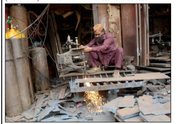
LAHORE: A blacksmith is busy at his workplace cutting large pieces of iron and making molds.

"At this time Automated Teller Machine (ATM) has also been introduced in CDNS which will provide enough facilities to the users," he added. Replying to a question, he said the CDNS had collected an investment of Rs 55 billion by January 9, 2023-24, through Islamic investment bonds.