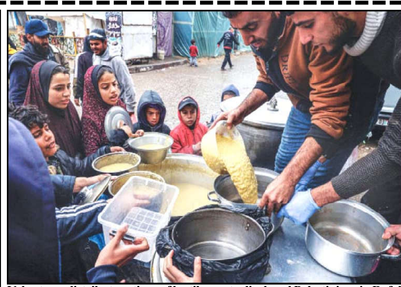
Volunteers distribute rations of lentil soup to displaced Palestinians in Rafah in the southern Gaza Strip.

But now, after more than four months of war that has flattened huge swathes of the Strip, Gazans are inching closer towards famine, according to the UN's World Food Programme.