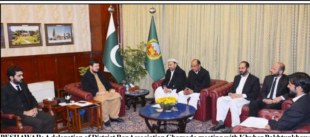
PESHAWAR: A delegation of District Bar Association Charsada meeting with Khyber Pakhtunkhwa Governor Haji Ghulam Ali.

PESHAWAR (APP): Talking to media here outside Peshawar High Court (PHC) he said a legal team was looking into matters related to joining any political party, however, the final decision would be taken by the party chairman. Gandapur said that after coming to power, he would take measures to make the province financially.