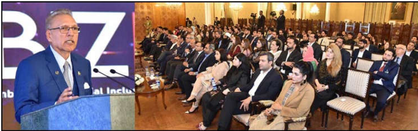
ISLAMABAD: President Dr. Arif Alvi addressing the 3rd edition of Hosting Business Net 2024, a platform to promote financial inclusion and digital transformation, at Aiwan-e-Sadr.

Vol. XIV No. 41 Reg. mails-B / ID-445 Tuesday February 20, 2024, Shaban 09, 1445 A.H. Ph: 2158688, 2158997 Pages 4: Rs. 12