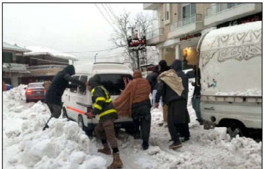
ABBOTTABAD: Rescue officials trying to remove a vehicle stuck in snow covered area after the heavy snowfall of winter season, which more decreases the temperature below in minus degree Celsius, at Nathiagali area in Abbottabad.

Vice Chancellors (VCs) of public and private universities besides parents and graduating students were in attendance.