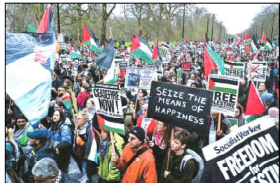
LONDON: Pro-Palestinian activists wave flags and carry placards during a march.

Security Conference. "And there's also, I think the imperative, that's more urgent than ever, to proceed to a Palestinian state that also ensures the security of Israel," he added. The Biden administration has been working to secure a mega-deal that will see ties between Saudi Arabia and Israel normalise. The Saudi as well as other Arab countries are seeking the creation of a Palestinian state as part of the deal. On Friday, Biden called for a temporary truce in Gaza for a potential prisoner swap deal. He said he had held "extensive" conversations with Israel's Prime Minister Benjamin Netanyahu on this and negotiations were "underway".