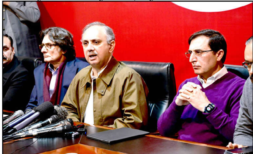
ISLAMABAD: PTI leader Umar Ayub addresses press conference.