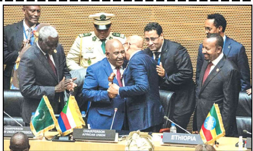
ADDIS ABABA: Outgoing chairperson of the African Union (AU) and President of Comoros, Azali Assoumani, congratulates the newly elected AU chairperson, President of Mauritania Mohamed Ould Ghazouani. Also seen are Ethiopian Prime Minister Abiy Ahmed and Moussa Faki, Chairperson of the African Union Commission.

with a gun stood in front of us and denied us access to this facility," he said after later attending the summit. Ethiopia insisted Mohamud was warmly welcomed and that the Somali delegation was blocked when its security detail tried to enter a venue with weapons. Mogadishu has accused Addis Ababa of violating its sovereignty over a January maritime deal with Somaliland, which declared independence in 1991 in a move not recognised by the international community. Under the memorandum of understanding, Somaliland agreed to lease 20 kilometres (12 miles) of its coast for 50 years to landlocked Ethiopia, which wants to set up a naval base and a commercial port on the coast.