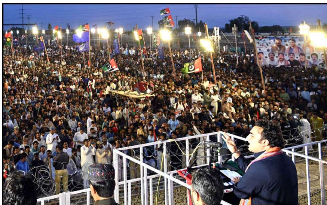
THATTA: Peoples Party (PPP) Chairman, Bilawal Bhutto Zardari addresses to his supporters during the public gathering meeting held in Thatta.