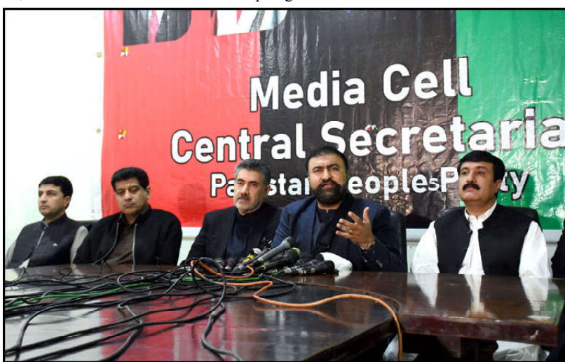
ISLAMABAD: Leader of Pakistan People's Party Sarfraz Bugti addressing a press conference in the Federal Capital.

Bilawal emphasised the need for a political party that prioritised addressing the people's concerns amid economic and political turmoil. He called for unity among politicians for the collective betterment of the country, transcending personal interests.