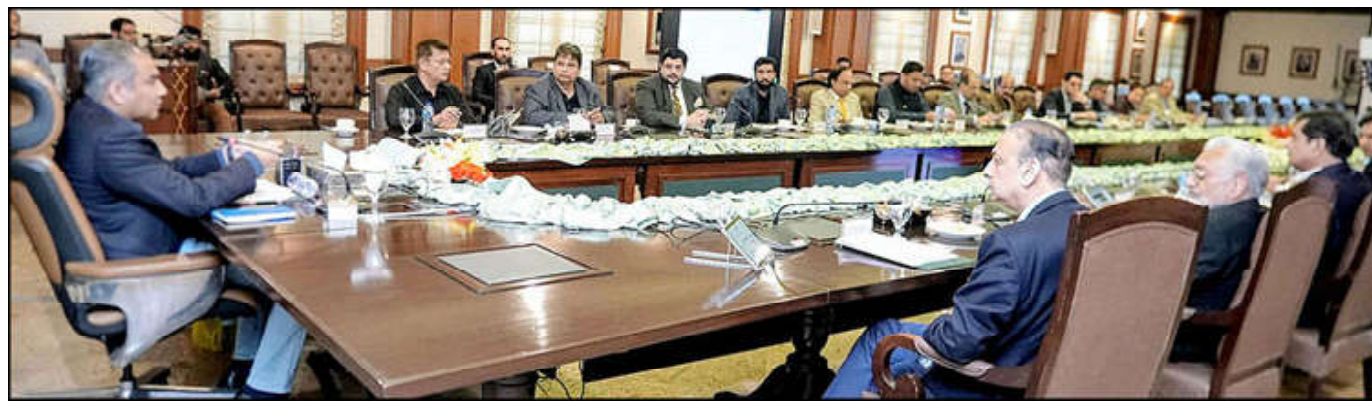
LAHORE: Caretaker Chief Minister Punjab Mohsin Raza Naqvi presides over the 41 st Provincial Cabinet meeting.

intellectual, and physical education that are the hallmark of Sadiq," the governor said. He said, "His connection with Sadiq Public School is longstanding. As the Chairman of the Board of Governors, it is a heavy responsibility for him to play a role in the betterment of this institution. "Sadiq has played a crucial role in bringing me to this position," he added. The governor emphasized the importance of both curricular and extracurricular activities in his speech. Additionally, Governor Punjab stated, "Today's event,