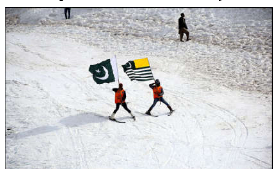
BAGH: Skiers take part in the Ganga Choti Winter Sports Festival near Bagh, Azad Jammu and Kashmir (AJK).