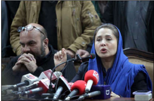
PESHAWAR: Tehreek-e-Insaf (PTI) Leaders, Taimur Khan Jhagra, Shandana Gulzar addressing a press conference, at Peshawar press club.