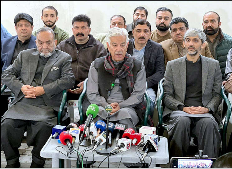
SIALKOT: Former Minister Defence Khawaja Asif, addressing media persons at his residence at cantt.

Malik said the PTI had attacked very foundation of the state as well as its institutions and values, adding that the government wasn't meant to act after an event, serving as district returning officers (DROs) and returning officers (ROs) in Rawalpindi—on social media by sharing not only their images and home addresses but also of the family members. The purpose was to influence and threaten the government servants for changing their loyalties to the PTI instead of state, Malik said. Addressing the state, he warned that if no action wasn't taken against the elements running the campaign from outside and inside the country, they would go ahead with the "May 9 Part II". Blasting the former Rawalpindi commissioner, he said Chatha had nothing to do with the election process in any capacity and was facing multiple inquiries.