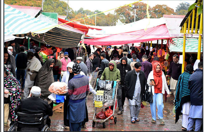
ISLAMABAD: People are busy in purchasing grocery at Sunday weekly bazaar at Aabpara area during rain in the Federal Capital.