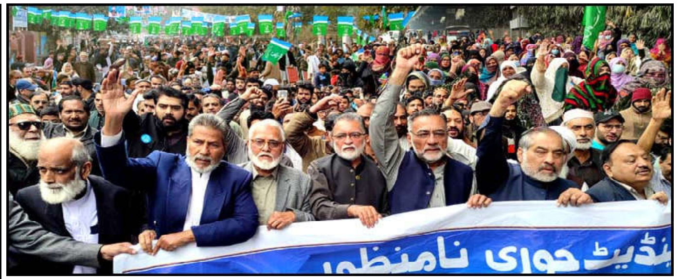
LAHORE: Activists of Jamat-e-Islami (JI) are holding protest demonstration against alleged rigging in General Election 2024, at Lytton road in Lahore.