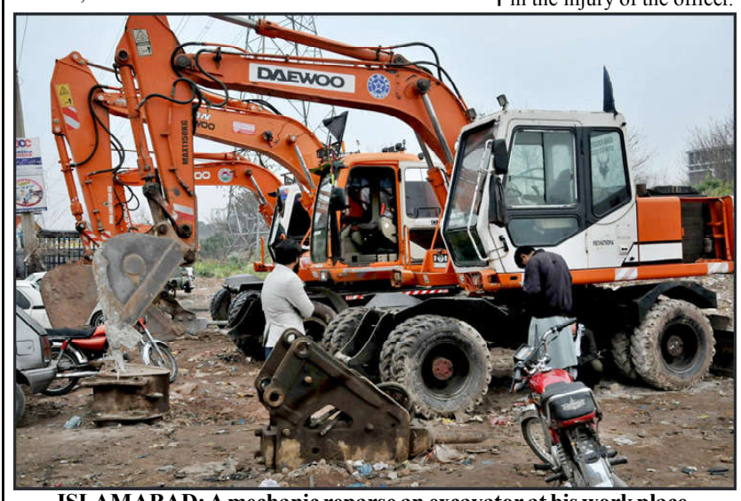
ISLAMABAD: A mechanic repairs an excavator at his work place.

lem nor a land dispute that can be resolved by military and brutal acts. Contrary to this, it added, Kashmir is purely a political dispute that has been recognized by the United Nations and its Security Council as an issue of right to self-determination. The statement, taking a dig at the so-called and puppet Hindutva Bharatiya Janata Party regime for its heinous criminal record in IIOJK, said the freedom and peace-loving people of Jammu and Kashmir only want their political and birthright to self-determination, which is a peaceful and democratic formula for settlement of the lingering Kashmir dispute. The statement appealed to the United Nations's Secretary General, António Guterres, to help settle the Kashmir dispute according to the resolutions of the World Body and the aspirations of the Kashmiri people and put pressure on India to stop human rights violations in IIOJK.