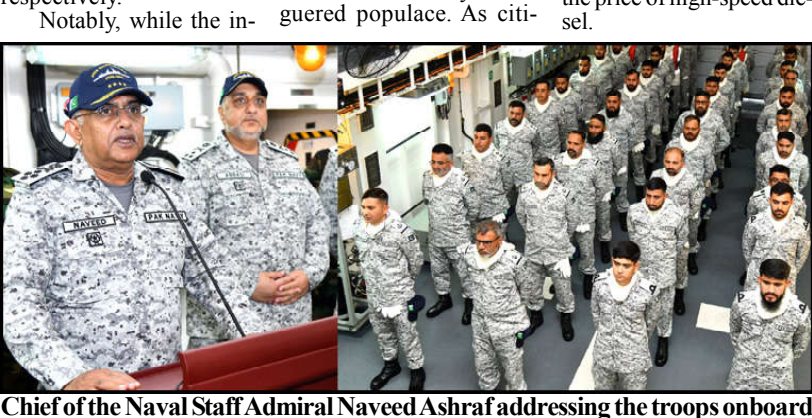
PN ship during exercise SEASPARK 2024

Following a hike of Rs13.55 per liter in petrol prices from February 1, authorities are now contemplating an increase in the price of high-speed die-