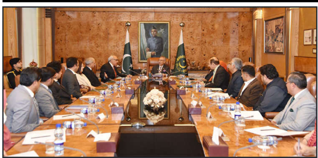
A delegation of karakoram International University, Gilgit Baltistan and University of Batistan, Skardu,