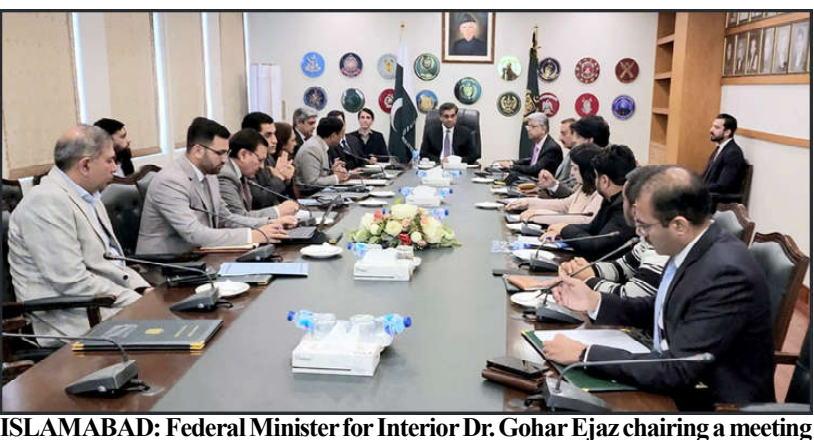
on Integrated Sanitation and Water Supply System for Islamabad and Rawalpindi.

The Foundation was also taking measures for education and upbringing of the orphan children, it was