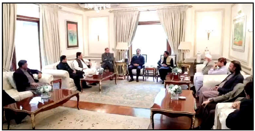
LAHORE: Newly elected independent candidates meeting with President PML (N) Shahbaz Sharif on eve of their joining the party.