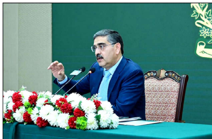
ISLAMABAD: Caretaker Prime Minister Anwaar-ul-Haq Kakar talks to National and foreign media in a press conference.

grievances. In Sweden, the similar exercise almost took 10 to 11 days while in Indonesia, almost a month was consumed to furnish results, he added. To another question, the prime minister said that mobile phone services were suspended on the polling day due to security threats as the government could not compromise on the security of people. On the other hand, the broadband internet services were available on that day, enabling the people to get connected, he said and rebuffed the allegations that the move was aimed at managing the social media. He said there were other occasions throughout the year, when the mobile services had been suspended to avert security threats.