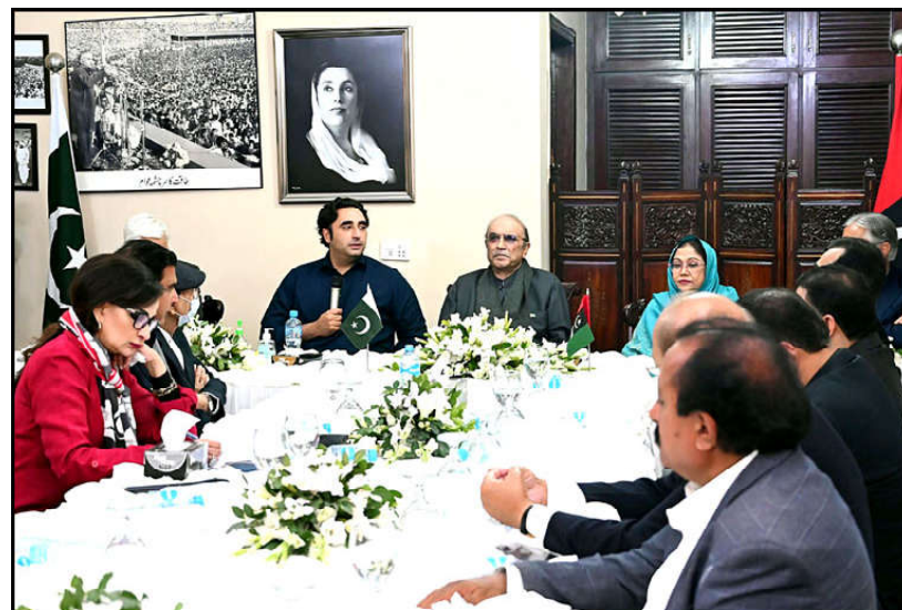
ISLAMABAD: President Pakistan People's Party Parliamentarians Asif Ali Zardari, Chairman Pakistan People's Party Bilawal Bhutto Zardari chairing PPP Central Executive Committee (CEC) at Zardari House in the Federal Capital.