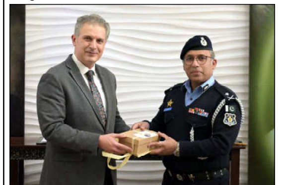
Safe City's centralized system, cutting-edge technology-equipped cameras, and

The delegation was briefed about the important measures taken by the Islamabad Police during the recent General Elections 2024, to maintain the law and order situation in Islamabad and to ensure the protection of life and property of the citizens. Moreover, the delegation also visited the control room in Safe City. The delegation was also briefed about its role in the secu-