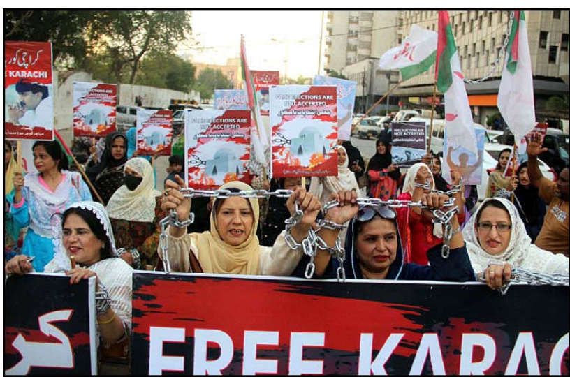
KARACHI: Women activists of Muttahida Qaumi Movement (Pakistan) hold a protest in favor of their demands outside press club in Provincial Capital.

The board of CDA had already approved to launch and develop housing schemes with the participation of the private sector. The civic body had also invited Expression of Interests (EOIs) for the selection of reputed firms to execute the project. The selected real estate firm would invest while developing and planning the project.