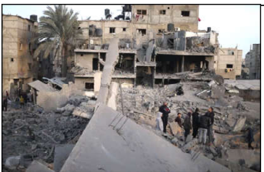
Palestinians gather at the site of an Israeli strike on a house, amid the ongoing conflict between Israel and the Palestinian Islamist group Hamas, in Rafah in the southern Gaza Strip.

watching and you can be sure (Russian President) Vladimir Putin is watching the Senate, too." Since last August, Democratic President Joe Biden has been urging Congress to hurry new aid to Ukraine. Following Hamas' Oct 7 attack on Israel he also requested funds for the US ally along with humanitarian aid for Palestinians in Gaza. Congress' haltingly slow response to Biden's call comes as Ukrainian officials have warned of weapons shortages at a time when Russia is pressing ahead with renewed attacks. "There's no good reason to delay the security and humanitarian assistance ... any longer," Senate Foreign Committee member Brian Schatz, a Democrat, said during Sunday's debate of the bill. "Ukraine is running dangerously low on munitions on the eve of the second anniversary of Putin's invasion," added Schatz.