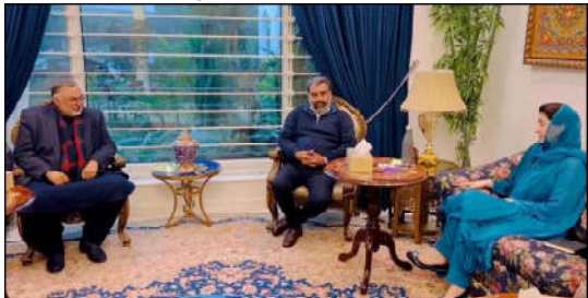
LAHORE: Newly elected members of Punjab Assembly met with Senior Vice President and Chief Organizer of Pakistan Muslim League (N) Maryam Nawaz Sharif.

According to the leadership of both the parties, the situation is not easy for both of them as according to the final results issued by the ECP, no party has been able to secure a simple majority and the PTI-backed independent candidates are ahead of them with 93 seats.