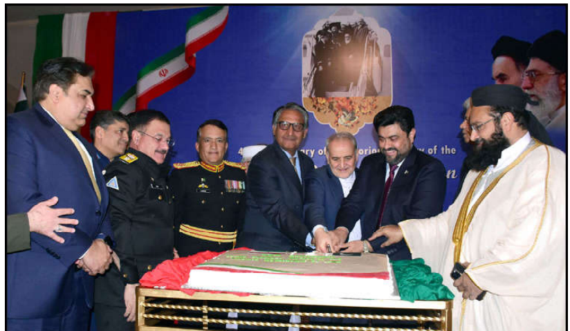
ISLAMABAD: Foreign Minister Jalil Abbas Jilani, Governor Sindh Kamran Tessori, Ambassador of Iran to Pakistan Dr Reza Amiri Moghaddom, and others cutting the cake during National Day of Iran ceremony at a local hotel, in the Federal Capital.