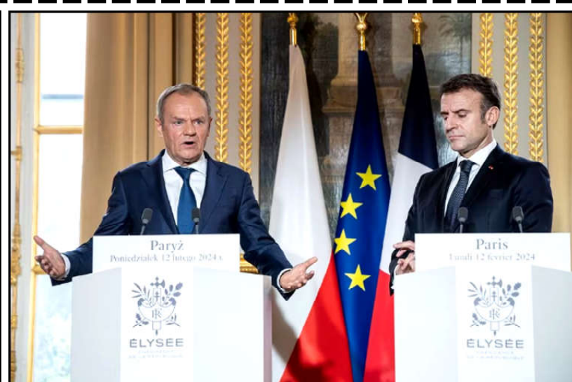
French President Emmanuel Macron and Polish Prime Minister Donald Tusk deliver a statement to the media as part of their meeting at Elysee Palace, Paris, France.