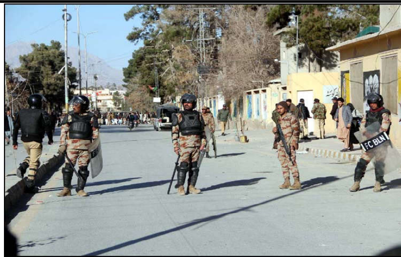
QUETTA: Security officials are standing high alert to avoid untoward incident during the protest demonstration different political party against rigging in General Election 2024, outside DC Office.