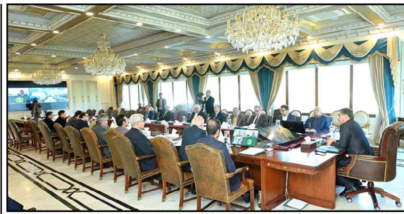
ISLAMABAD: Caretaker Prime Minister Anwaar-ul-Haq Kakar chairs a review meeting regarding progress on Pakistan's investment agreements with friendly countries.

On the recommendation of Ministry of Kashmir & Gilgit-Baltistan Affairs, the Cabinet approved the amendment of Section 5(2) of the Adaptation Act. According to the amendment, in this section, instead of Azad Jammu and Kashmir Council, the words Azad Government of State of Jammu and Kashmir shall be used to transfer the license fee and renewal fee of mobile phone network spectrum from Pakistan Telecommunication Authority to Azad Government of State of Jammu and Kashmir.