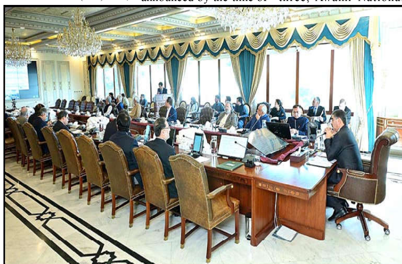
ISLAMABAD: Caretaker Prime Minister Anwaar-ul-Haq Kakar chairs a meeting of the Federal Cabinet.

The PML-N Quaid said that his party's agenda was based on welfare of people, adding that Shehbaz Sharif had worked a lot for empowerment of youth in the country. He said more initiatives would be taken to empower youngsters and to provide free medicine.