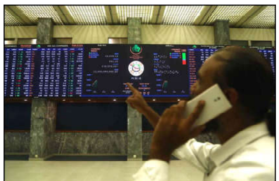
KARACHI: Brokers are busy in trading at Pakistan Stock Exchange (PSX) in Karachi.

Another area of focus was digital lending.