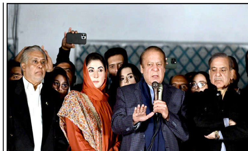
LAHORE: Pakistan's former Prime Minister and leader of the Pakistan Muslim League (PML-N), Nawaz Sharif along with his brother, Shehbaz Sharif and his daughter Maryam Nawaz, speaks with supporters at Model Town.

In Balochistan, PML-N secured eight seats, PPPP eight, JUI six, Independent candidates four, JI one, Awami National Party (ANP) and PTIP one each, out of 105 seats.