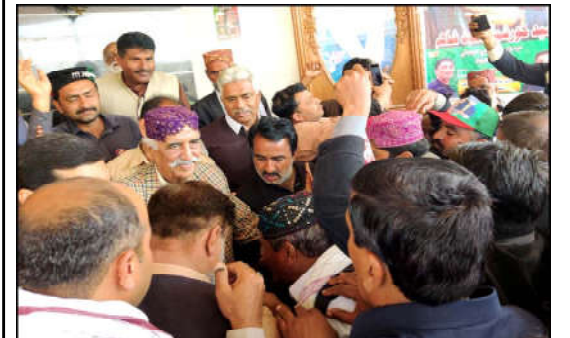
SUKKUR: Peoples Party (PPP) Leader, Syed Khursheed Shah celebrates with supporters after his victory in the General Election 2024, in Sukkur.