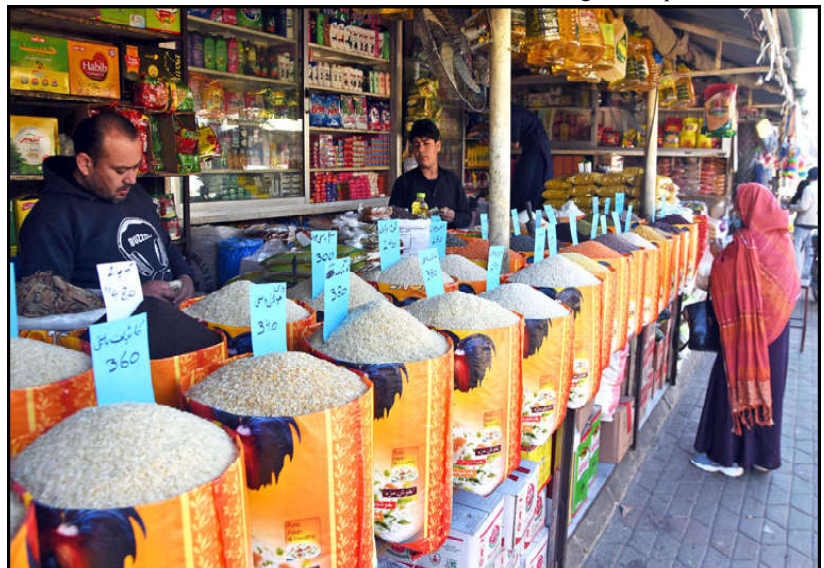
ISLAMABAD: A vendor is displayed rice attraction for customers on his stall at Friday weekly bazaar at sector H-9, in the Federal Capital.