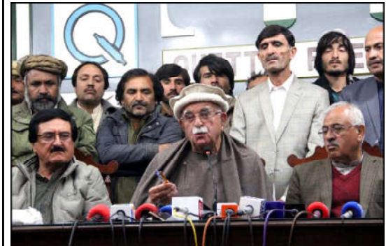
QUETTA: Pashatunkhwa Milli Awami Party (PKMAP) Chairman, Mehmood Khan Achakzai addresses to media persons during press conference, at Quetta press club.

Ishaq Dar who is head of PML-N Election cell has said in his tweet "we have collected all data and results in PML-N election cell. PML-N has emerged as single majority party in National Assembly (NA).