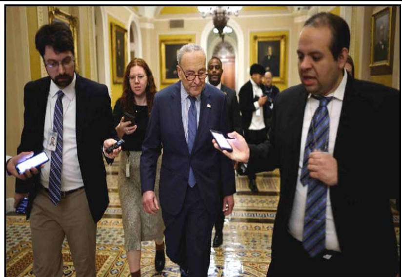
US Senate Majority Leader Charles Schumer (D-NY) talks to reporters as he walks to his office at the Capitol in Washington, DC.

Palestinian state, rather than anything more binding, to try to get a defence pact with Washington approved before this year's US presidential election. US Secretary of State Antony Blinken, who is touring the region, said Saudi Crown Prince Mohammed bin Salman had "reiterated Saudi Arabia's strong interest in pursuing" normalisation when they met this week. "But he also made clear what he had said to me before, which is that in order to do that two things are required: an end to the conflict in Gaza and a clear, credible, time-bound path to the establishment of a Palestinian state."