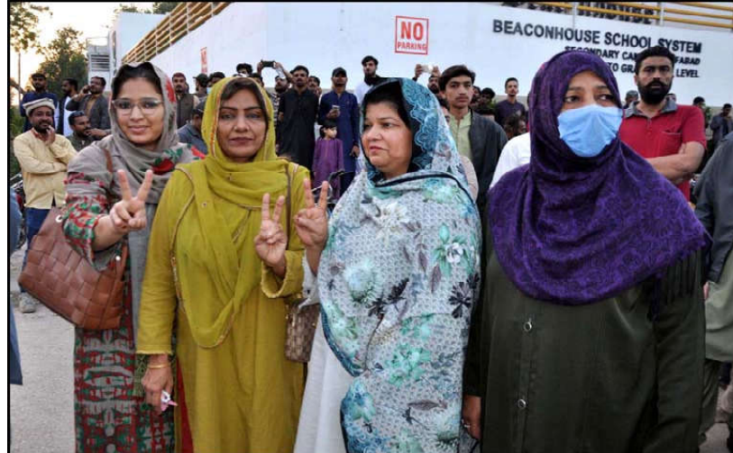
HYDERABAD: Activists of Tehreek-e-Insaf (PTI) are holding protest demonstration against rigging in General Election 2024, outside R.O Office in Hyderabad.

Poland's agriculture minister said he understood the challenges farmers were facing but he hoped the protests could be organised in a way to be "the least burdensome for citizens".