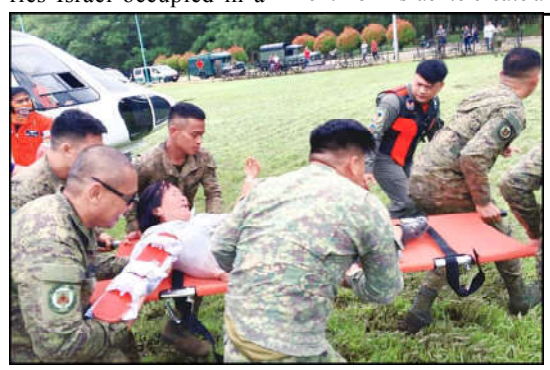
TAGUM (Philippines): Soldiers transfer an injured person to a hospital after evacuation from Maco region which was hit by landslides.