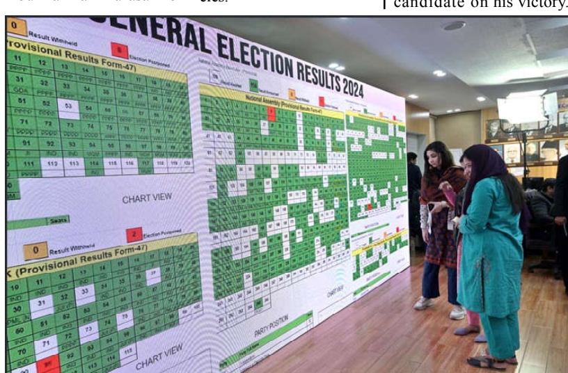
ISLAMABAD: Journalists stand in front of a screen displaying live election results in the Election Commission office a day after General Elections 2024.

"Nawaz Sharif wishes to become the prime minister [...] but I don't my party will form a coalition with him if he projects himself as the premier," Shah said hours after the world's fifth-biggest democracy voted to elect its leaders.