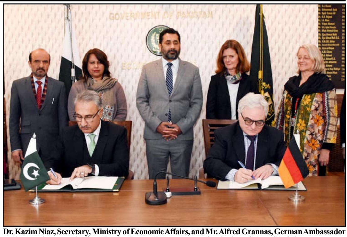
to the Islamic Republic of Pakistan, witnessed the ceremony for signing of Euro 45 million agreements on Technical Development Cooperation for starting new bilateral cooperation projects on 7th February, 2024 in Islamabad.

development cooperation has been supporting Pakistani Government initiatives for over 60 years. We work together with our partners in support of their socioeconomic reform agenda contributing to a sustainable, crisis-proof