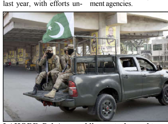
LAHORE: Pak Army soldiers patrol a road to ensure security ahead of general election, in Provincial Capital.

the ratio of the implementation. It was stated that the increased use of technology in Mohtasib had enhanced people's accessibility, with 48,190 complaints regishighlighted the role and pertered online in 2023, markformance of the institution. ing an increase of 47 per He informed that cent from 2022. Similarly, ceived through Mohtasib's mobile App in 2023, representing a 21 per cent increase from 2022. The meeting was also briefed on the Integrated Complaint Resolution System, processing 18,469 complaints in 2023, alongside Mohtasib's teams conducting Khuli Kutcheries and inspection visits to address people's grievances against govern-