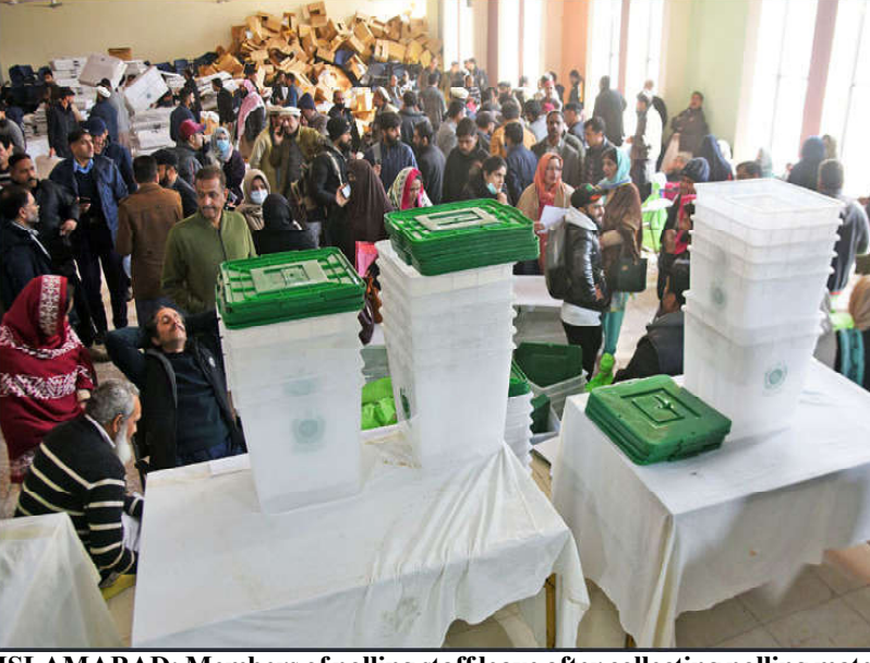
ISLAMABAD: Members of polling staff leave after collecting polling material for general elections at a collage sector G-8, in the Federal Capital.

The Higher Education Commission (HEC) also introducing Smart University project to equip university campuses with blanket Wi-Fi coverage, in order to enable the deployment of other smart instruments as needed, he