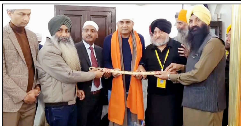
LAHORE: Caretaker Chief Minister Punjab Mohsin Raza Naqvi being presented "Karpan" by representative of Sikh Community during his visit to Kartarpur.

The Chief Secretary directed the district administration to ensure a peaceful atmosphere and conduct of free, fair and transparent polling on the election day.