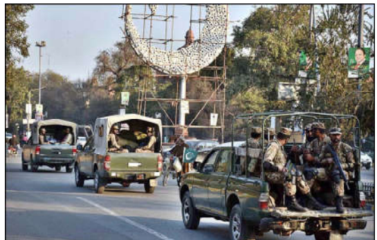
LAHORE: A convoy of army personnel patrols along a road in the city to develop a sense of protection among the masses and maintain law and order situation during the General Election 2024.

ISLAMABAD (Online): PTI has filed review petition in Supreme Court (SC) against decision on withdrawing the election symbol of bat from the party. PTI while praying the court to review January 13 decision regarding intra party election requested that Peshawar High Court (PHC) decision be restored. PTI has filed petition seeking review of SC decision on PTI intra party election and symbol of bat. It has been said in the petition that intra party elections were held as per party constitution.