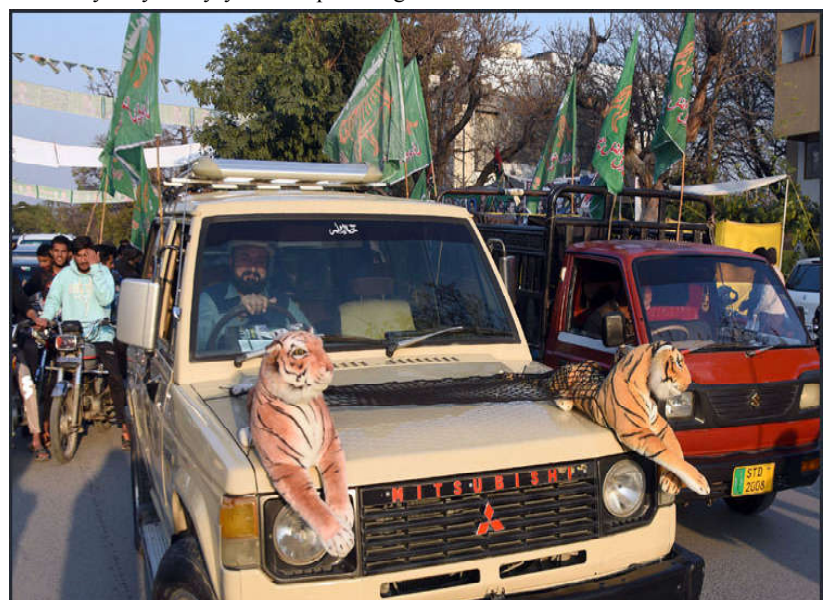
ISLAMABAD: Supporters of Pakistan Muslim League (N) installed party symbol 'Lion' on his vehicle during an election campaign rally last day of campaign, at a road in the Federal Capital.