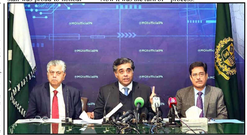
ISLAMABAD: Federal Minister for Interior, Dr. Gohar Ejaz and Murtaza Solangi, Federal Minister for Information and Broadcasting addressing a press conference, in Islamabad.

WASHINGTON (APP): Pakistan's Ambassador to the United States, Masood Khan, Monday termed India's repressive actions in Kashmir as crimes against humanity, and called on the international community to save the Kashmiri people. "The Kashmiris are the most disenfranchised people on the face of the earth; they are victims of genocide, crimes against humanity and ethnic cleansing," he said at a special event to observe Kashmir Solidarity Day at the Embassy of Pakistan Washington, DC. "We feel the pain of our Kashmiri brothers and sis-