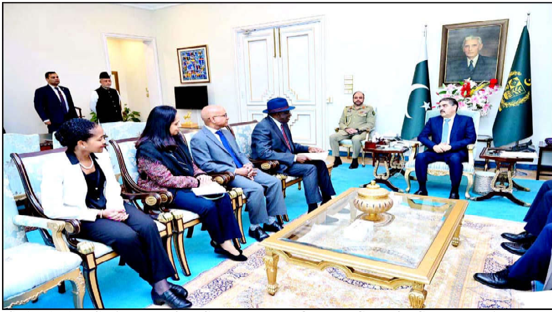
ISLAMABAD: Chairperson of the Commonwealth Observer Group for General Election H.E. Dr. Goodluck Ebele Jonathan along with the delegation called on Caretaker Prime Minister, Anwaar-ul-Haq Kakar.

Vol. XIV No. 31 Reg. mails-B / ID-445 Wednesday February 07, 2024, Rajab 26, 1445 A.H. Ph: 2158688, 2158997 Pages 4: Rs. 12