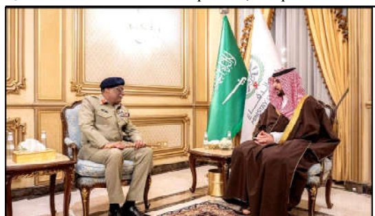
RAWALPINDI: Chairman Joint Chiefs of Staff Committee (Chairman JCSC) General Sahir Shamshad Mirza, called on Prince Khalid Bin Salman Bin Abdulaziz Al-Saud during his official visit to KSA.

work. On this occasion, the CPO Security Division, SSP Security Division, DG Ministry of Foreign Affairs, and Chinese diplomats were also present. He issued directives to senior officers for the en-