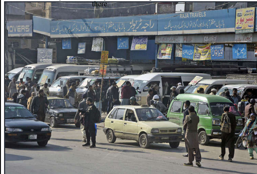
ISLAMABAD: People stands at a bus station at Faizabad in the Federal Capital due to travelling their home towns for cast their votes during general holiday for general election 2024 head on 28 Feb in all over the country.

ISLAMABAD (APP): Cold wave will continue gripping upper parts of the country during the next 24 hours, according to the Pakistan Meteorological Department (PMD). "Mainly cold and dry weather is expected in most parts of the country while very cold in upper parts", the PMD said. However, rain wind-thunderstorms with snow-fall over mountains are expected at isolated places in northeast Balochistan and Gilgit Baltistan. Cold waves are likely in upper Punjab during the evening/night. Shallow fog is likely to persist at isolated places in plain areas of Punjab during morning hours. As per the synoptic situation, continental air was prevailing over most parts of the country. A shallow westerly wave was likely to affect north-eastern parts of Balochistan and southern Punjab in the next 24 hours.