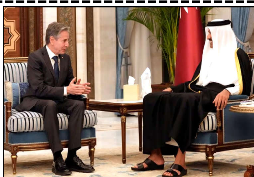
U.S. Secretary of State Antony Blinken meets with Qatar's Amir Sheikh Tamim bin Hamad Al Thani at Lusail Palace, in Doha, Qatar.

Guterres, in consultation with UNRWA Commissioner General Philippe Lazzerini, has assigned the leadership of this crucial review to Catherine Colonna, a former foreign affairs minister of France. The panel will collaborate with three reputable research organizations—the Raoul Wallenberg Institute in Sweden, the Chr. Michelsen Institute in Norway, and the Danish Institute for Human Rights. In a statement released in New York, the UN chief emphasised the importance of this review, stating, "The Review Group's mandate is to assess whether the Agency is doing everything within its power to ensure neutrality and to respond to allegations of serious breaches when they are made."