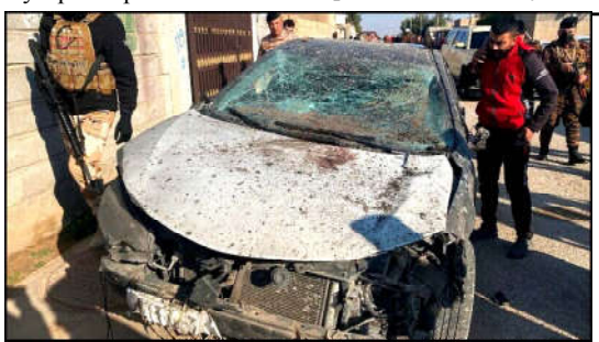
Security forces inspect a damaged car at the site of a U.S. airstrike in al-Qaim, Iraq.

US Lieutenant General Douglas Sims, the director of the Joint Staff, said the attacks appeared to be successful, triggering large secondary explosions as the bombs hit "militant weaponry". He said the strikes were undertaken knowing that there would likely be casualties among those in the facilities. Despite the strikes, the Pentagon has said it does not want war with Iran and does not believe Tehran wants war either, even as Republican pressure has increased on US President Joe Biden to deal a blow directly. US Defence Secretary Lloyd Austin said after the strikes that Biden had directed additional action against the IRGC and those linked to it. "This is the start of our response," Austin said.