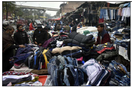
LAHORE: People are busy buying warm clothes and jackets in Landa bazaar at Shadman Sunday weekly bazaar in Provincial Capital.

Through this MoU both parties may, to the best of their mutual endeavor and capabilities, strive to enhance investment in value addition in the mining sector of KP Province, provide specific product/project information, identification of joint venture partners, facilitating procedural matters with respective authorities remaining within respective legal mandate. Similarly, partners may conduct matchmaking meetings.