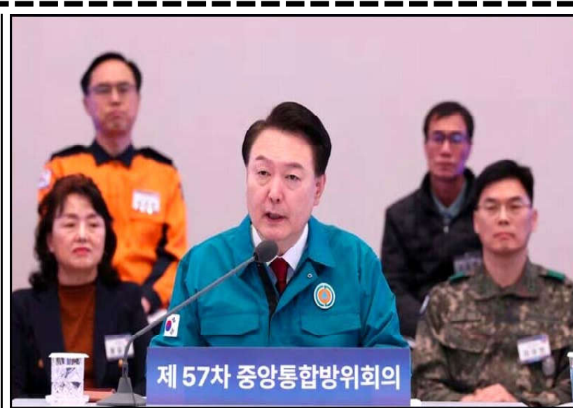
South Korean President Yoon Suk Yeol presides over the central integrated defence meeting in Seoul, South Korea.

Monitoring Desk NEW DELHI: India will remove its troops in the Maldives by May, the Maldivian Foreign Ministry said on Saturday, as the two countries seek agreement on a pullout that has strained ties. The roughly 80 soldiers stationed in the Indian Ocean archipelago will be replaced by civilians, officials from both countries said. As global powers jostle for influence in the Asia-Pacific region, India and China have wooed the Maldives, which has traditionally been close to neighbour India. New Delhi's ties with Male have under strain since Mohamed Muizzu was elected president of the Maldives last year, pledging to end the country's "India First" policy. He has called for the withdrawal by March 15 of the troops stationed to provide support for military equipment given to the Maldives. Russia has recently