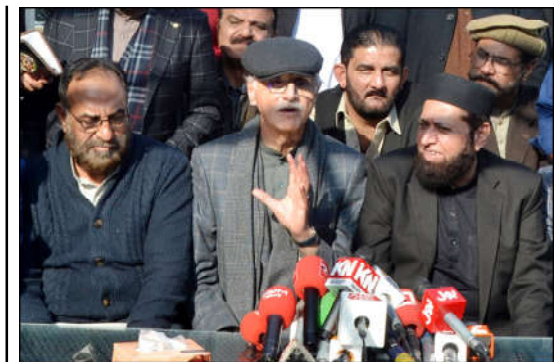
MULTAN: Isteqam-e-Pakistan Party (IPP) Chairman Jahangir Tareen addressing a press conference.