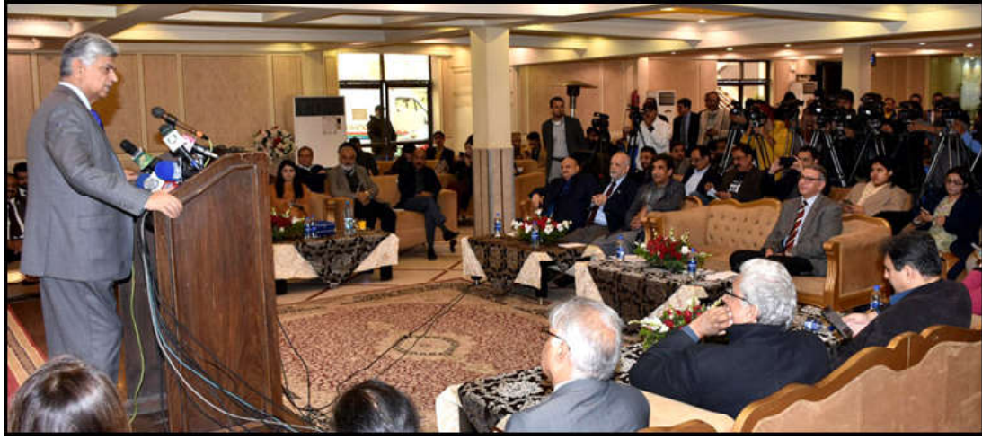
LAHORE: Honorable Chief Guest Mr. Murtaza Solangi, Caretaker Federal Minister of Information & Broadcasting, addressing at seminar on "Political participation and empowerment of Youth, women, transgender and cultural minorities" organized by PID.

Vol. XIV No. 29 Reg. mails-B/ID-445 Monday February 05, 2024, Rajab 24, 1445 A.H. Ph: 2158688, 2158997 Pages 4: Rs. 12