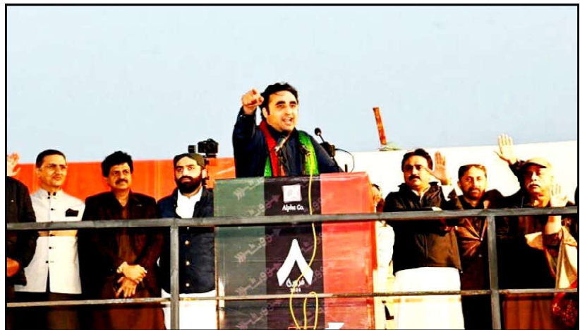
HYDERABAD: Chairman PPP Bilawal Bhutto Zardari addressing a election meeting.

"President Geingob will always be remembered for his services to the Namibian nation and his distinguished legacy as a leader of the Global South. Our heartfelt condolences to President Geingob's family and the people of Namibia," she added.