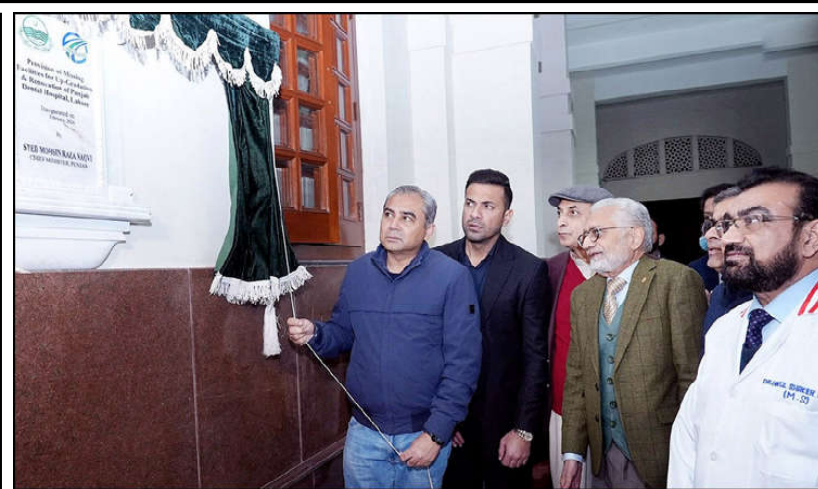
LAHORE: Caretaker Chief Minister of Punjab Mohsin Naqvi inaugurates up gradation and renovation of Punjab Dental Hospital.

seating capacity of the people in the Parade Ground would be enhanced approximately up to 18,000 after its upgradation and the height of Bab-e-Azadi project would be approximately 120 feet. Approval for the issuance of funds was accorded in the meeting to undertake remodelling of Liberty Chowk along with making an agreement with the Bank Alfalah for the biggest National Flag of South Asia and undertaking construction as well as extension of the Lahore Metro Bus Service corridor.