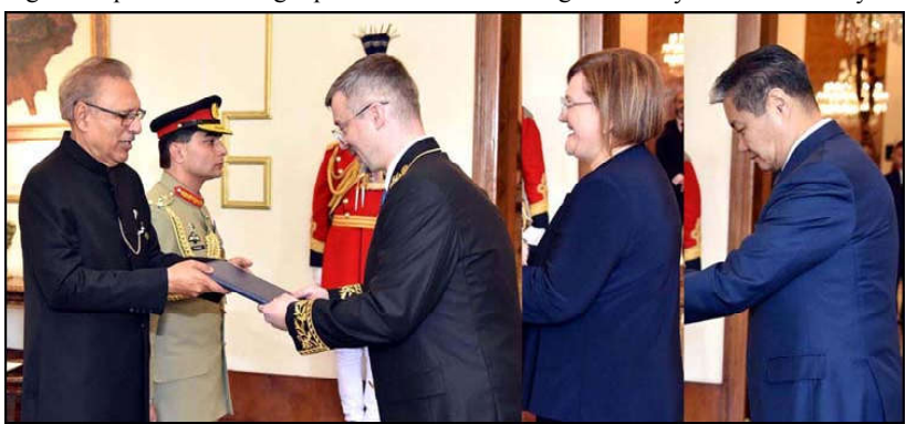
ISLAMABAD: The Ambassadors-Designates of Russia, Italy and Mongolia presenting their diplomatic credentials to President Dr. Arif Alvi, at Aiwan-e-Sadr.