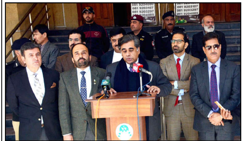
QUETTA: Caretaker Interior Minister Dr. Gohar Ejaz addressing a Press conference regarding holding of peaceful elections

and major issues facing the country, including economy, foreign policy, local governments, governance and civil service reforms, should also be discussed to find their solution," he remarked. Solangi said that despite many flaws in the democratic system and electoral process, everyone was in agreement that the electoral process should not be stopped and elections should be held. He said that since the formation of the caretaker cabinet on August 17, 2023, the government had been consistently reiterating its commitment that the elections would definitely be held and also on the scheduled date of February 8.