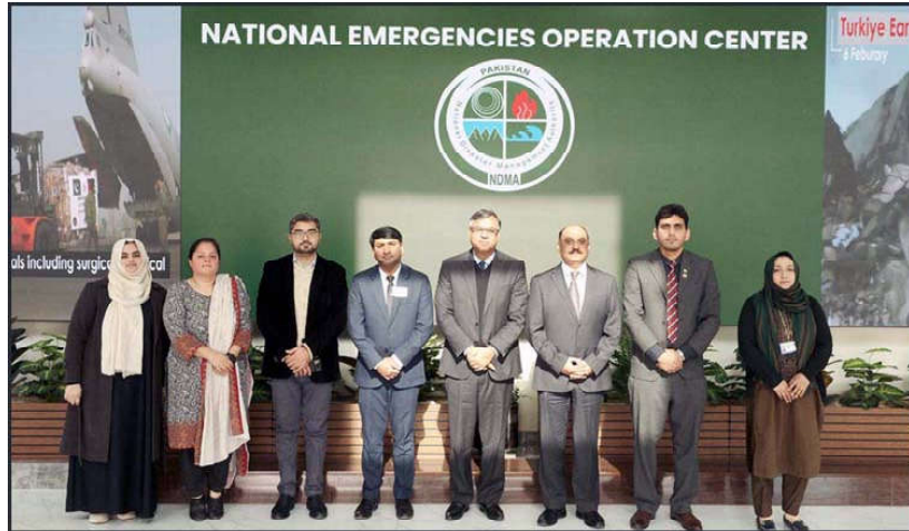
ISLAMABAD: Group photo of Kohsar University Delegation at National Emergencies Operation Center (NEOC) of NDMA.