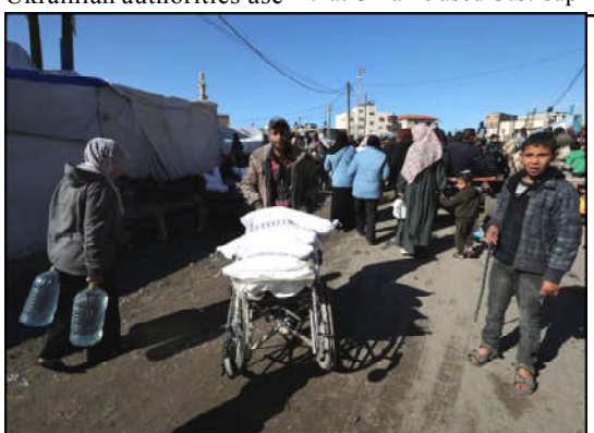
A Palestinian man carries bags of flour distributed by the United Nations Relief and Works Agency (UNRWA), amid the ongoing conflict between Israel and Hamas, in Rafah in the southern Gaza Strip.

Germany, have suspended funding to the UN agency for Palestinian refugees, UNRWA, over accusations that several staff members were involved in the Oct 7 raids in Israel. Withholding the funds was "perilous and would result in the collapse of the humanitarian system in Gaza", the heads of the UN agencies said in a joint statement. Meanwhile, mediation efforts gathered pace following a Sunday meeting of top US, Israeli, Egyptian and Qatari officials that produced a proposed framework for a new truce and prisoner release. The Israeli army said on Wednesday its troops had killed 15 "terrorists" in northern Gaza, and captured 10 "militants" during an attack on a school where they were allegedly hiding.