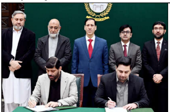
PESHAWAR: Caretaker Chief Minister Khyber Pakhtunkhwa Justice (R) Syed Arshad Hussain Shah witnessing signing of MoU between KP IT Board and Alkhidmat Foundation.

because many health problems are caused by consuming contaminated water. He said that public private partnership is a successful model. Governor Punjab further said that youth are the most valuable asset of the country. He said that along with formal education, the aspect of moral education is also important. Governor Punjab said that as Chancellor, he has given instructions to the Vice Chancellors to give special attention to the character building of the youth.