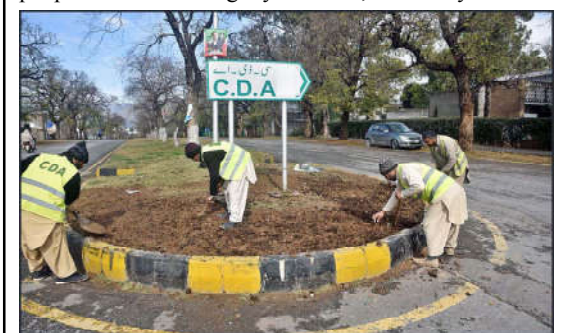
ISLAMABAD: CDA workers busy in preparing center path of road for plantation in the Federal Capital.

The event brought together young Pakistani and Kashmiri artists, creating a platform for an artistic exploration of Kashmiri identity and resilience and expressing solidarity with the people of Indian Illegally