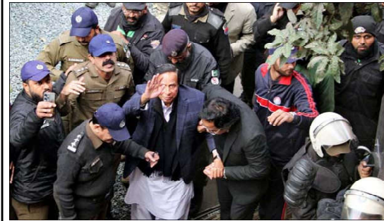
LAHORE: Former Chief Minister Punjab and Tehreek-e-Insaf (PTI) President, Chaudhry Parvez Elahi arriving for case hearing, at District Court.

It also instructed that the applicants may be apprised of the objections/deficiencies with regard to their requests for transfer of plots and houses within three days in addition to provision of two additional printers for facilitating the public/visitors.