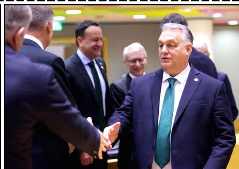
Hungary's Prime Minister Viktor Orban attends a European Union summit in Brussels, Belgium.

plied Patriot air defense systems to shoot down a Russian military transport plane in the Belgorod region on Jan. 24. Russian authorities said the crash killed all 74 people onboard, including 65 Ukrainian POWs heading for a swap. Ukrainian officials didn't deny the plane's downing but didn't take responsibility and called for an international investigation. Putin said Russia wouldn't just welcome but would "insist" on an international inquiry on what he described as a "crime" by Ukraine.