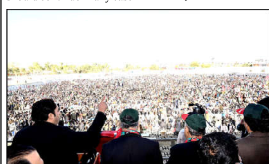
KHUZDAR: Chairman Pakistan Peoples Party Bilawal Bhutto Zardari addressing a public meeting in connection with election campaign.