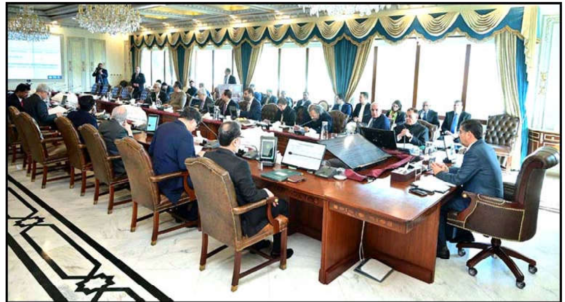
ISLAMABAD: Caretaker Prime Minister Anwaar-ul-Haq Kakar chairs a meeting of the Caretaker Federal Cabinet.

Pakhtunkhwa Province and Balochistan Province, representatives of other agencies, the Secretary Election Commission, and other senior officers participated in the meeting. Addressing the participants of the meeting, the CEC expressed his concern over the deteriorating law and order situation in Khyber Pakhtunkhwa and Balochistan, especially the incidents of attacks on Election Commission offices and political meetings.