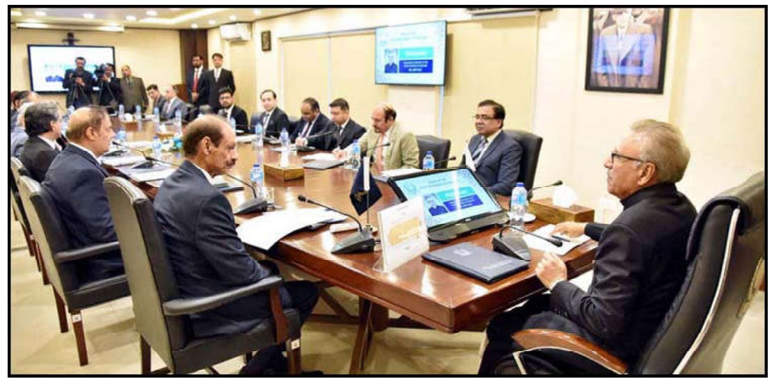
ISLAMABAD: President Dr Arif Alvi being briefed about the role and performance of the Auditor General of Pakistan (AGP), during his visit to AGP Office.

audit process more effective." It was informed that the Auditor General had completed 95% compliance audits in the fiscal year 2022-23. Improvements in audit and accounting processes would promote transparency, accountability and good governance, the meeting was told. Similarly it was informed that steps were underway to incorporate advanced technology platforms and artificial intelligence tools into the audit process.