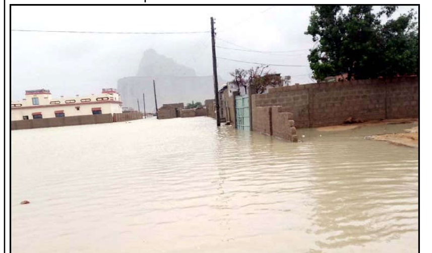
GWADAR: View of stagnant rain water after flash flood caused by heavy down-pour of winter season, in Gwadar.

He said that the required machinery has been provided to the rescue teams while people of affected areas are being shifted to the safer places,