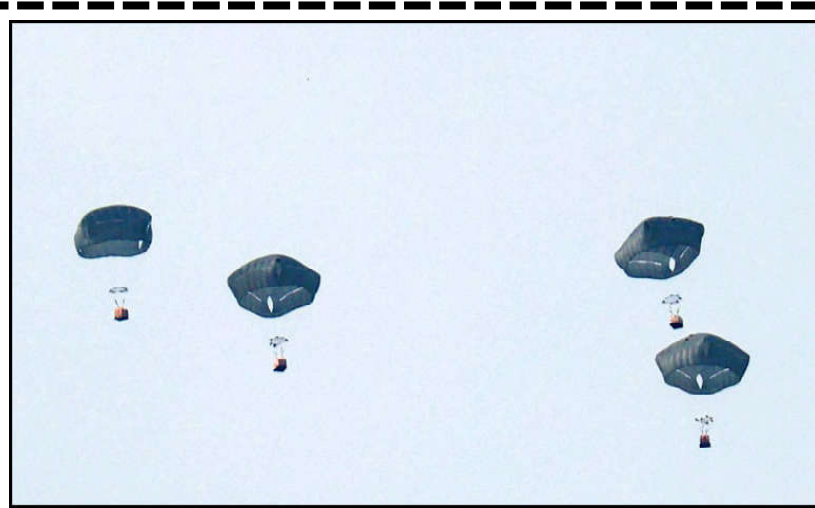
AID IS BEING DROPPED BY A JORDANIAN MILITARY AIRCRAFT OVER RAFAH, SOUTH-GAZA STRIP.