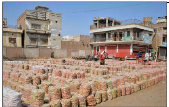
MULTAN: Vendor displaying tomato bags for bidding at Vegetable Market.

thanks to ingenious light reflection technology! But the excitement didn't stop there. Sunova Solar also introduced a game-changing bifacial 615 W module, engineered to perfection with its sleek rectangle cells, delivering unparalleled power generation performance. With Pakistan's burgeoning market for renewable energy solutions, Sunova Solar's offerings couldn't have come at a better time.