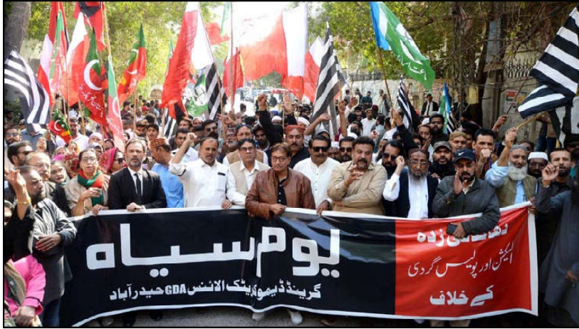
HYDERABAD: Workers of GDA, PTI, JUI(F), JI and Awami Tehreek hold a protest rally against alleged rigging in general election 2024 and observe Black Day against torture and arrest of the workers of Sindhyani Tehreek and JUI (F) during a rally in Karachi.

The Indian opposition, particularly the Congress, has raised doubts about the Balakot surgical strikes proclaimed by the BJP government. Rahul Gandhi and Navjot Singh Sidhu demanded validation and an accurate count of the casualties resulting from the strike.