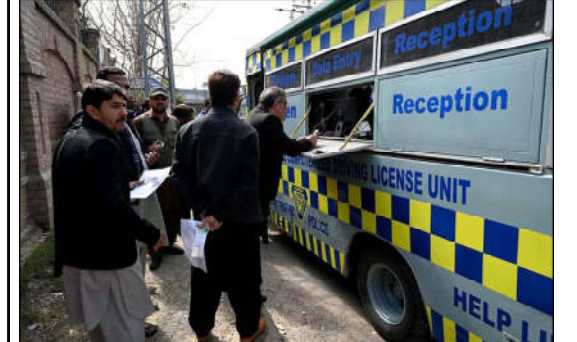
PESHAWAR: Traffic warden making driving licenses through DL-Van for journalists in front of Press Club.