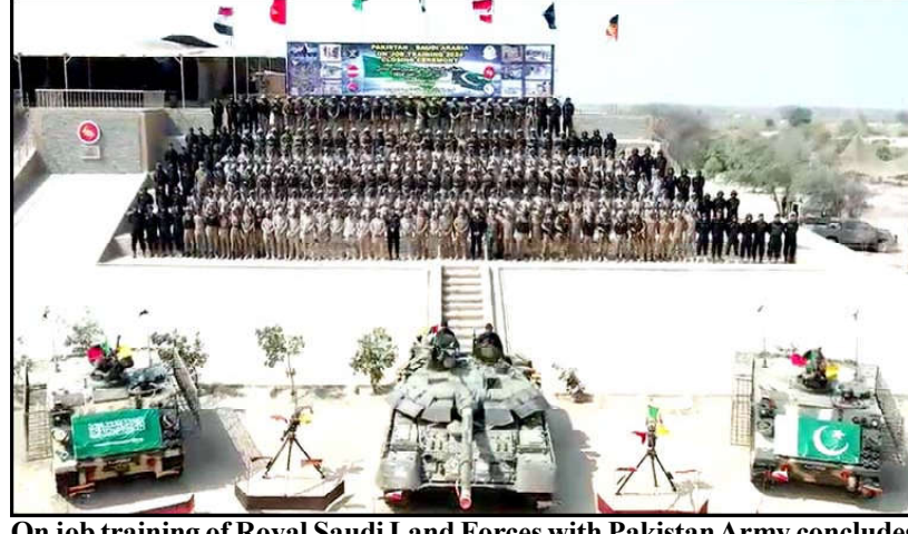
On job training of Royal Saudi Land Forces with Pakistan Army concludes in Multan.

Balochistan Provincial Assembly has witnessed Eleven (11) General Elections since then, growing in size to its present membership of 65 with the ratio of 51 General, 11 women and 3 minority seats.