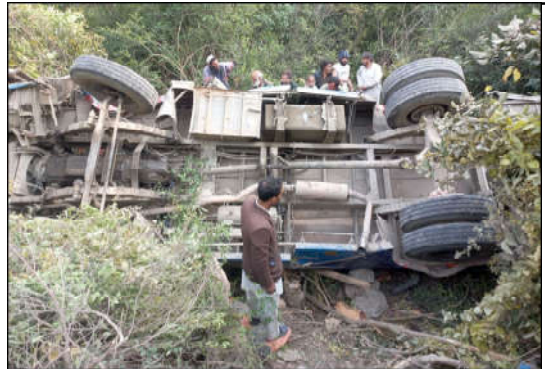
HARIPUR: People rescue victims of a passenger bus accident at a road, as a passenger bus fell into a ravine in Sarbrot area of Haripur, more than 12 people died and 15 people were injured.