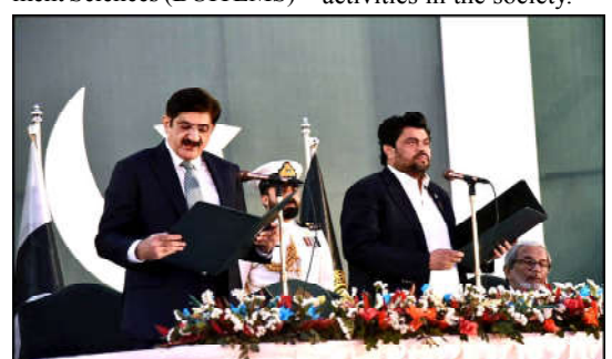
KARACHI: Governor Sindh, Kamran Khan Tessori administering the oath to the newly-elected Chief Minister Sindh, Syed Murad Ali Shah.

The Governor was addressing the Balochistan Public Sector Universities Debating Championship 2024 organized by the Higher Education Commission at the main auditorium of Balochistan University of Information Technology, Engineering and Management Sciences (BUTEMS)