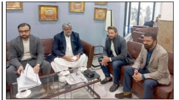
QUETTA: Renowned cricketer Shahid Afridi meeting with Caretaker Chief Minister Balochistan Mir Ali Mardan Khan Domki at Quetta Airport.

She added that according to Articles 91 and 130 of the Constitution, the first session of all assemblies was mandatory within 21 days of the general elections.