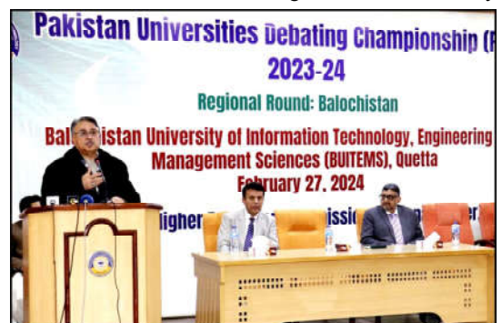
QUETTA: Governor Balochistan Malik Abdul Wali Khan Kakar addressing participants of a ceremony of Pakistan Universities Debating Championship 2023-24 organized by Higher Education Commission at BUTEMS