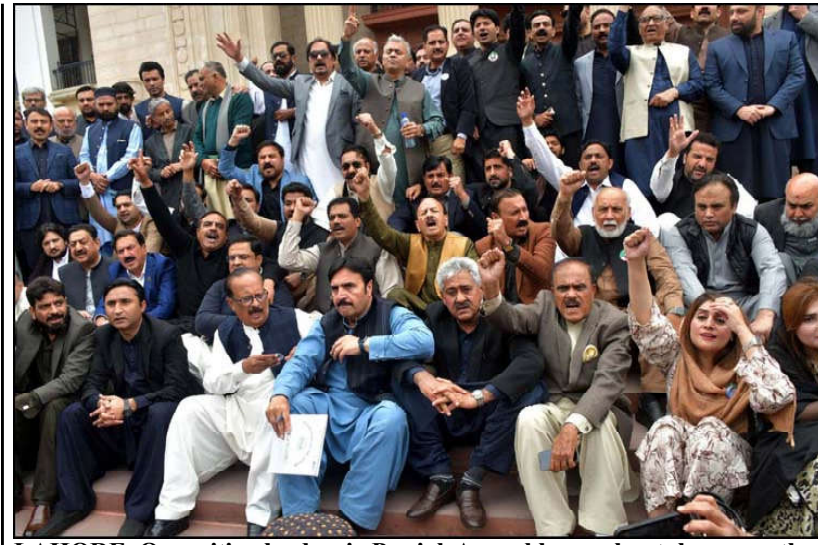
LAHORE: Opposition leaders in Punjab Assembly are holding protest demonstration against alleged rigging in General Election 2024, at Punjab Assembly in Lahore.