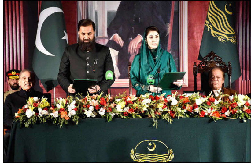
LAHORE: Governor Punjab Baligh Ur Rehman administering the oath to the Newly-elected Chief Minister Punjab Maryam Nawaz at Governor House.

"It is the prerogative of the SJC to proceed with the matter accordingly," read the order.