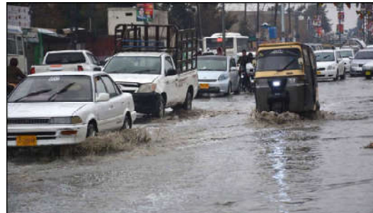
QUETTA: Vehicles passing through accumulated rain water after rain in Provincial capital.