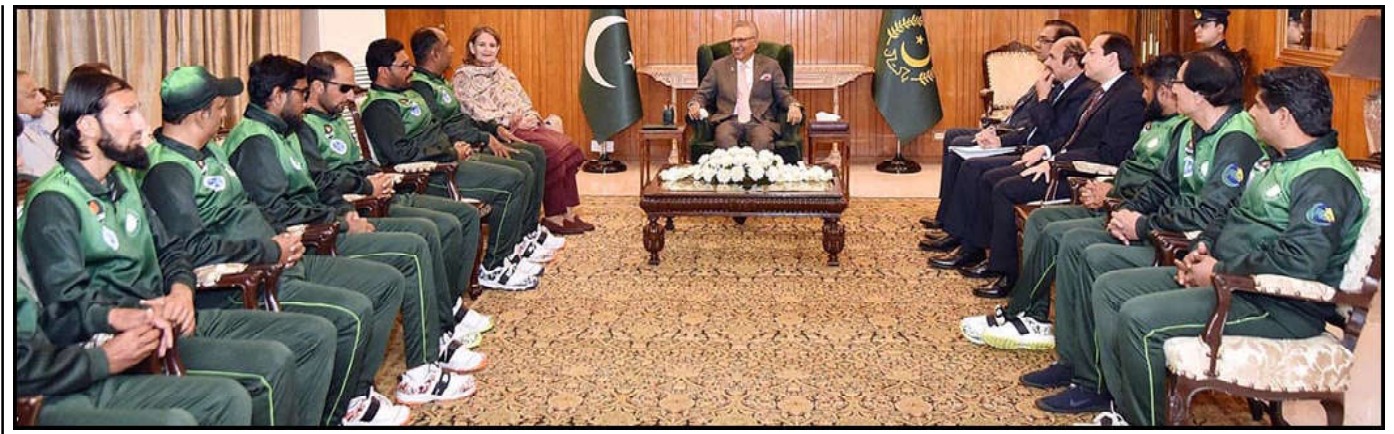
ISLAMABAD: Pakistan Blind Cricket team called on the President Dr. Arif Alvi at Aiwan-e-Sadr.

ISLAMABAD (APP): Caretaker Federal Minister for Information, Broadcasting, and Parliamentary Affairs Murtaza Solangi informed the Senate on Monday that Higher Education Commission (HEC) had neither decided nor given any suggestion to the universities to eliminate any particular course of study, including the Pakistan Studies from their degree programmes. Responding to a motion moved by Mushtaq Ahmed regarding the abolition of the subject of Pakistan Affairs by the Higher Education Commission (HEC) from the syllabus at the graduation level, he said, "As per the concerned ministry and HEC, no decision or proposal has been issued to abolish the subject of Pakistan Affairs or any other course from the syllabus at the graduation level." He further elaborated that all undergraduate policies recommended by the HEC encompassed the minimum standards required for such programmes, adding universities were operating autonomously within the framework of their respective laws. He said a course on Pakistan ideology and the constitution had been introduced for all undergraduate degree programmes. The minister said this