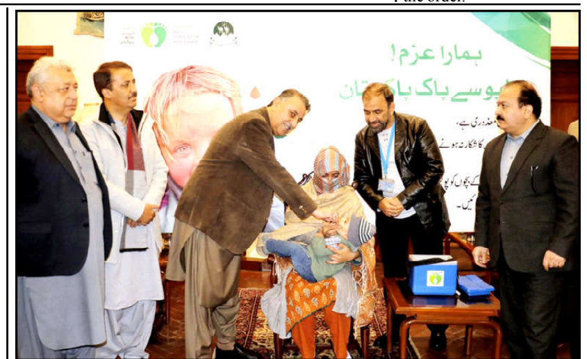
QUETTA: Governor Balochistan Malik Abdul Wali Khan Kakar inaugurating 7-days Anti-Polio campaign 2024 by administering drop to a child

Moreover, there would be no permission to the live vans of the electronic media in the premises of Provincial Assembly. However, the media representatives would be allowed to enter the assembly building for coverage on the accreditation cards issued by the Directorate General of Public Relations.