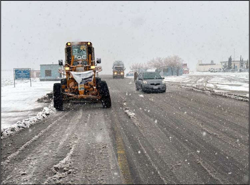
QUETTA: Heavy machinery busy in removing snow from road during the heavy snowfall of winter season, which more decreases the temperature below in minus degree Celsius, at Lakhpas area of Balochistan.

ISLAMABAD (APP): The members of the Pakistan Blind Cricket team on Monday called on President Dr. Arif Alvi where he lauded them for bringing laurels to Pakistan besides highlighting globally the capabilities of differently-abled persons. In the meeting held at the Aiwan-e-Sadr, the president said that through their participation in tournaments, the team also inspired other blind cricketers. He said that during the recent years, blind cricket got special attention and recognition in Pakistan. The active role of the Pakistan Blind Cricket Board in promoting and holding contests is welcoming, he added. Calling for the encouragement of the blind cricket team, the president also called for acknowledgement of the cricketers' impressive role to highlight the team's efforts and achievements. The team management briefed the president about the team's performance. The team members thanked President Alvi and First Lady Samina Alvi for their encouragement. First Lady Samina Alvi was also present in the meeting.