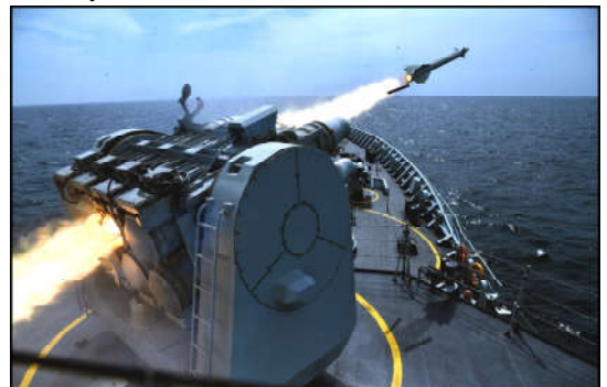
Pak Navy demonstrates successful shooting down of aerial target by Surface to Air Missile.

Similarly, the interim government also took measures for bringing good governance and preventing corruption.