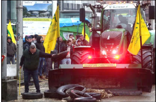
A man holds a fire during a protest of European farmers over price pressures, taxes and green regulation, on the day of an EU Agriculture Ministers meeting in Brussels, Belgium.

lice headquarters in Brasilia. "No one attempted a coup in Brazil. That is the great truth," Bolsonaro told radio station CBN Recife. A week after Lula took office on Jan 1, 2023, thousands of Bolsonaro supporters stormed the presidential palace, Congress and Supreme Court, urging the military to intervene to overturn what they called a stolen election. Bolsonaro, who was in the United States at the time, denies responsibility, and has even suggested the protesters were not really his supporters. However, investigators allege months of anti-democratic maneuvers by Bolsonaro, from a plan to discredit Brazil's electronic voting system with a "disinformation" campaign ahead of the elections to "legitimise a military intervention" if he lost.