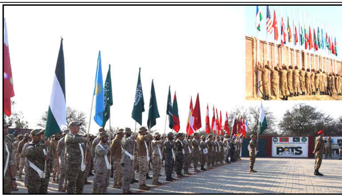
7th International Pakistan Army Team Spirit Exercise-2024 opened at the National Counter Terrorism Centre at Pabbi.