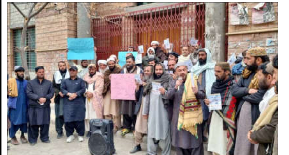
QUETTA: Residents of Pashtunabad are holding protest demonstration against prolong sui-gas load shedding in their area, held at Quetta press club.