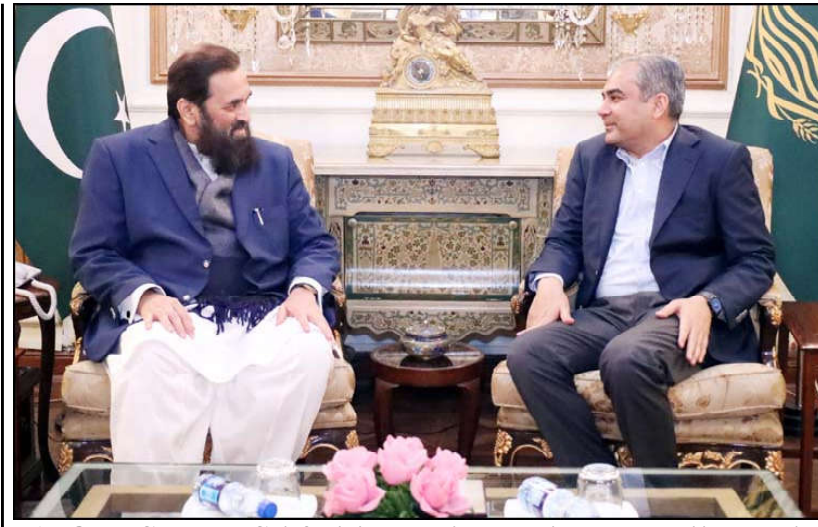
LAHORE: Caretaker Chief Minister Punjab Mohsin Raza Naqvi in a meeting with Punjab Governor Muhammad Balighur Rehman.