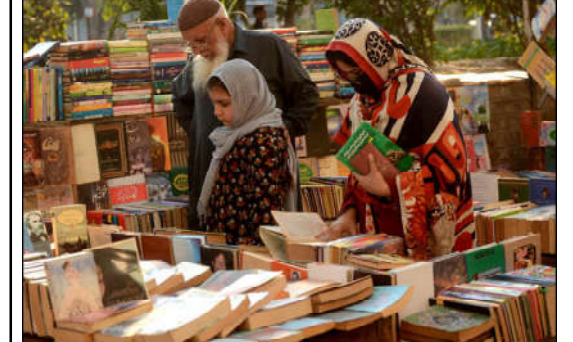
LAHORE: People selecting and purchasing old books from a roadside setup at Mall Road.

The PTI's candidate for KPC's slot said that 55 percent of the newly-elected members of his party were those who won for the first time. The recent elections have exposed the turncoats and separated them from those who were loyal to the party, he added.