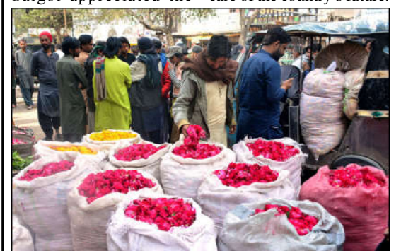
HYDERABAD: A vendor displaying the rose flowers to attract the customers in connection with shab-e-barat at flowers market.

work and passion of the organizers of Defense Welfare Society who are providing technical education to students in this era of inflation, which is valuable and praiseworthy.