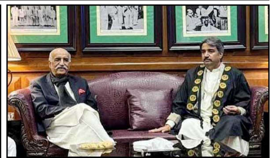
KARACHI: Senior leader of PPP Syed Khurshid Shah greets Syed Ovais Qadir Shah on assuming charge of Speaker Sindh Assembly