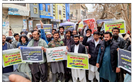
QUETTA: Activists of Markazi Muslim League holding protest demonstration for acceptance of their demands, at Quetta press club

Jan Achakzai stressed that the PTI should work with new government for development and prosperity of the country so that the country is economically stabilized. He said that development is not possible from the politics of disturbance and instability and the public rights are also violated. The caretaker Minister Information also asked the PTI not to prefer its personal interests in the larger interest of the country and may adopt the course of practical politics so as to steer the country out of current challenges. He said that there is a need to present positive image of Pakistan before the world. He believed that Pakistan has to move ahead for development and prosperity, and if anyone made any attempt to hinder its way, then one would be dealt with iron hands. He said that the new government would emphasize on taking the country along while following the constitution and law.