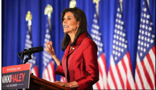
Republican presidential candidate and former US Ambassador to the United Nations Nikki Haley speaks on stage at her watch party during the South Carolina Republican presidential primary election in Charleston, South Carolina.

More than 15 bushfires were burning in Victoria on Sunday, with the most serious blaze, ranked at the second highest danger rating, near several remote towns, according to the state's emergency authority. State authorities have said there are concerns about the weather this week particularly Wednesday into Thursday when extreme heat is forecast that could further fan the fires.