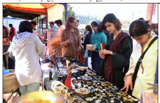
LAHORE: Women purchasing artificial jewelry from the stall during the Lahore Literary Festival at AlHamra.

The PIAF Chairman said that the young generation should pay full attention to their studies because they have to take care of the country's future.