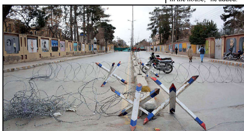
QUETTA: Security Personnel blocked the road going towards the RO office during the 4-Party Ittehad sit-in protest against the alleged vote-rigging in the general election.

ISLAMABAD (INP): With aim to facilitate and acquaint the newly elected members of the 16th National Assembly of Pakistan, a dedicated facility center has been established within the hallowed halls of the Parliament House in Islamabad. The arrival of these elected officials has commenced, marking the beginning of their journey in the legislative arena. Under the guidance of Speaker National Assembly Raja Pervez Sharaf, welcoming banners adorn the precincts of Parliament, extending warm greetings to the incoming legislators. To streamline the induction process, a comprehensive one-window facility center has been instituted in Committee Room Number Two of the Parliament House. Here, members are undergoing essential formalities, including obtaining their assembly cards and familiarizing themselves with the protocols of the National Assembly through provided booklets. Among the privileges extended to the newly inducted members is the issuance of blue passports for themselves, their spouses, parents, and unmarried children under 28 years of age. This passport grants visa-free travel to 46 countries worldwide, albeit necessitating a sworn oath.