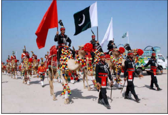
BAHAWALPUR: Rangers Cholistan Camel band presenting their skills at a ceremony held in connection with 19th TDCP Cholistan Desert Rally 2024 at Cholistan desert Jeep Rally.

cabinet has set a good example of public service, transparency and governance. He said that continuity of policies is very important for the development of the country. Governor Punjab expressed the hope that the newly elected government will take forward the policies and projects of public welfare and bring development and stability in the country.