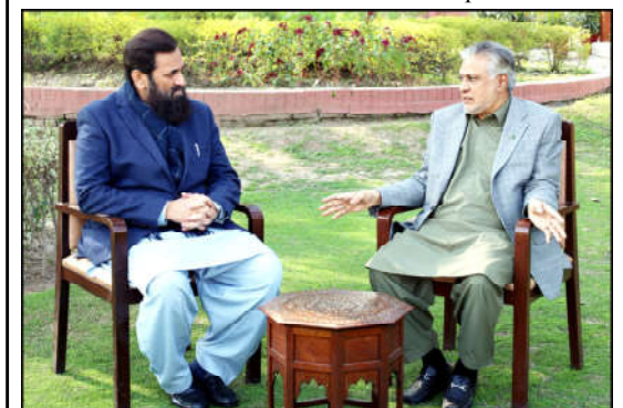
LAHORE: Governor Punjab Muhammad Balighur Rehman meeting with leader of the house in Senate Ishaq Dar.