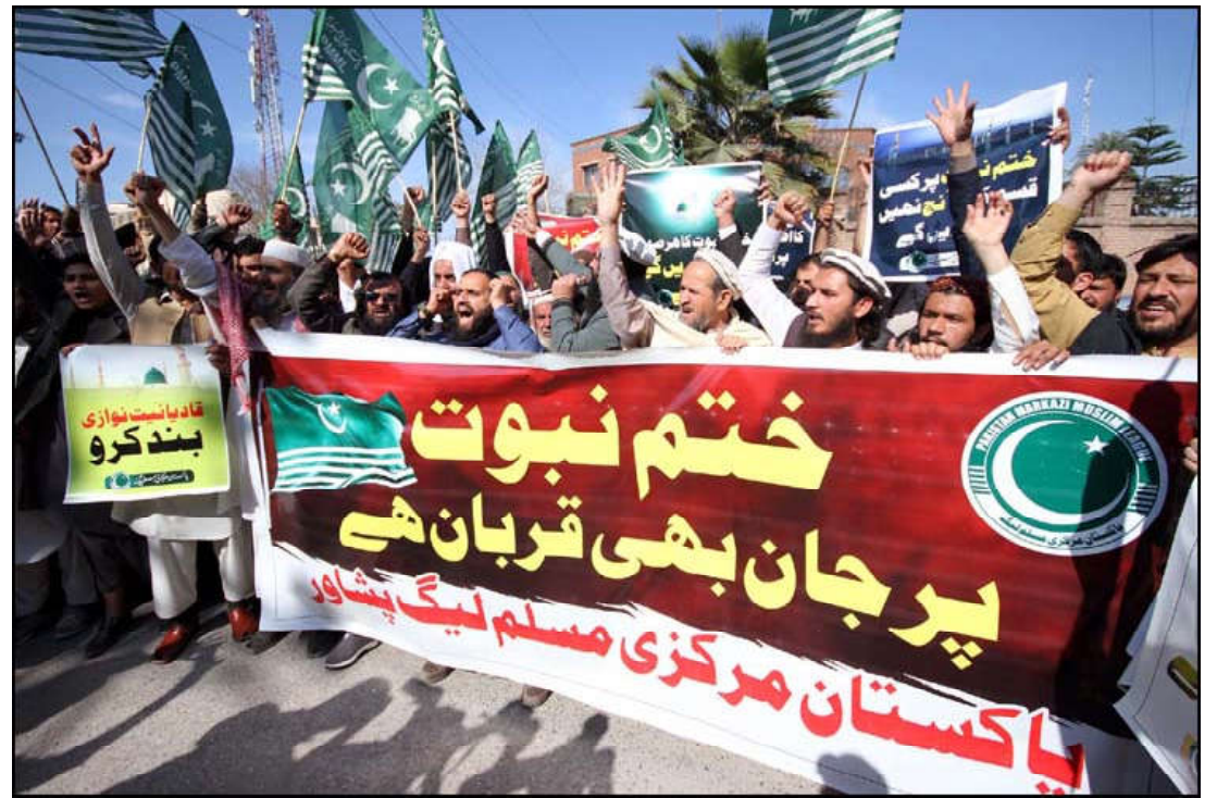
PESHAWAR: Activists of Markazi Muslim League (PMML) are holding protest demonstration against supreme court ruling, at Peshawar press club.

Nuclear Power Plant, the K2 and K3 units that both use Hualong One, China's third-generation nuclear power reactor with full intellectual property rights, are churning out a combined 20 billion kilowatt hours each year, satisfying the production and residential electricity use of two million people while saving energy equivalent to 6.24 million tons of standard coal," the Global Times learned from China National Nuclear Corporation. In July last year, Unit 5 (C-5) of the Chashma Nuclear Power Plant broke ground, marking the 7th nuclear reactor exported from China to Pakistan. "Pakistan is on the right side of history by