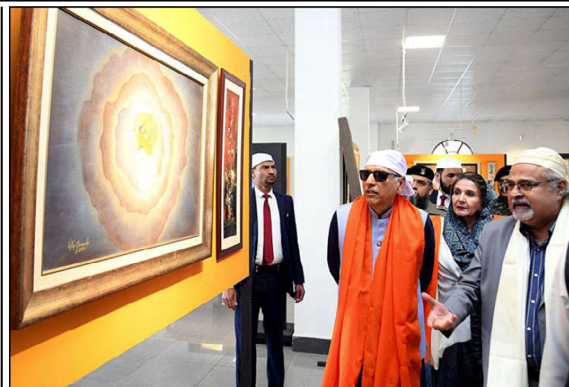
NAROWAL: President Dr Arif Alvi visiting different sections of the Kartarpur Corridor.