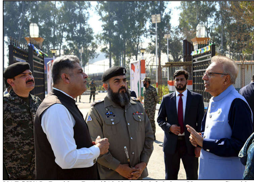
NAROWAL: President Dr Arif Alvi being briefed about Kartarpur Corridor at Zero Line/International Border.