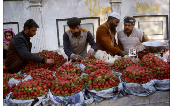
LAHORE: Vendors arranging and displaying strawberry to attract the customers.