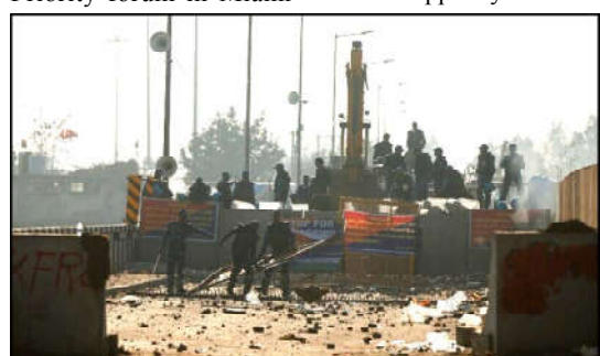
Police move a makeshift barricade at the site of a protest as farmers march towards New Delhi to push for better crop prices promised to them in 2021, at Shambhu Barrier, the border between Punjab and Haryana states, India.

the occupied territories, Lebanon, Jordan and Syria. Several countries including the United States, Britain, Germany and Japan have suspended funding to UNRWA in response to Israeli allegations that some of its staff participated in the October 7 attack on Israel. In an interview published over the weekend, Lazzarini said $438 million has been frozen the equivalent of more than half of expected funding for 2024. He said Israel was waging a concerted effort to destroy UNRWA. The UN fired the employees accused by Israel and has begun an internal probe of UNRWA. UN Secretary-General Antonio Guterres has also tasked an independent panel with assessing whether UNRWA acts neutrally in the Israeli-Palestinian conflict.