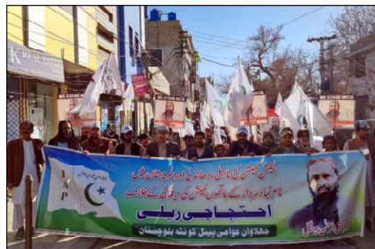
QUETTA: Members of Jhalawan Awami Penal (JAP) are holding protest demonstration against alleged rigging in General Election 2024, at Quetta press club.