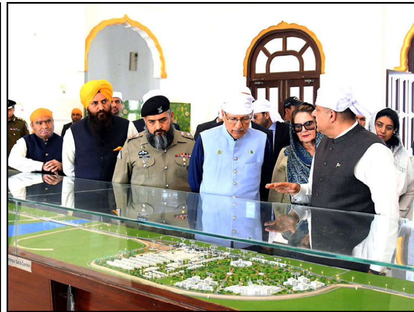
NAROWAL: President Dr. Arif Alvi being briefed about the Kartarpur Corridor.