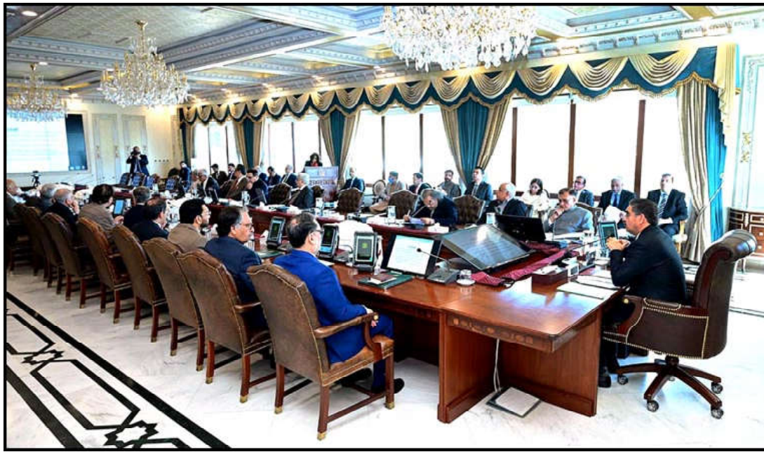
ISLAMABAD: Caretaker Prime Minister Anwaar-ul-Haq Kakar chairs a meeting of the Caretaker Federal Cabinet.

It further stated that if anyone felt there was a mistake by the court then avenues of legal recourse were always present, which the apex court or the chief justice would never stop anyone from approaching. The verdicts can be criticized within reason but an arranged campaign in the name of criticism without adopting the constitutional path of a review is unfortunate," the press release added.