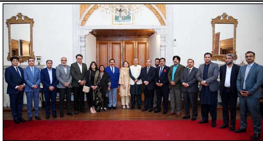
LAHORE: President Dr. Arif Alvi in a group photo with a delegation of the Lahore Chamber of Commerce and Industry, who called on him, at Governor House.