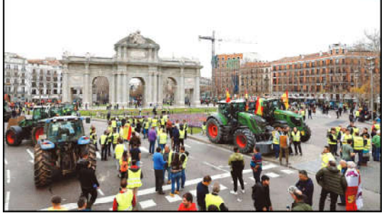
Farmers riding tractors arrive in front of Madrid's Puerta de Alcalá square during a protest against the European Union's agricultural policy.