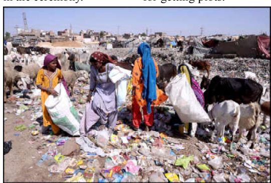
HYDERABAD: Gypsy women searching for the valuable items from heap of garbage at Latifabad area.