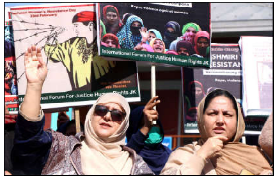
MUZAFFRABAD: Women activists of International forum for justice shouting slogans during protest ahead of Kashmiri Women's Resistance Day 23rd February, in the city.

Unfortunately, the recent election was marred by allegations of manipulation, the PTI senator stated, adding, "The entire world saw how the public mandate was stolen."