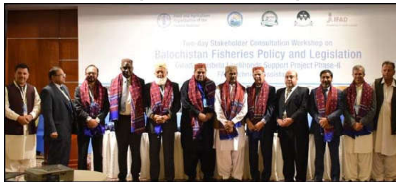
QUETTA: A group photo of participants of two-day Stakeholder Consultation Workshop on Balochistan Fisheries Policy and Legislation organized by FAO.

LAHORE (INP): Ameer Jamaat-e-Islami (JI), Sirajul Haq terming the recent general elections as mockery of nation has said that Rs50 billion of national exchequer were wasted over a fraudulent exercise. Addressing a press conference following his participation in a JI Youth meeting at Mansoorah on Thursday, he criticized the re-emergence of two dynasties against the people's February 8 vote. Sirajul Haq asserted that a government formed on a fraudulent mandate would not sustain itself, emphasizing the need for a fair investigation into electoral rigging through a judicial commission. He called for the resignation of the Election Commissioner to ensure an impartial investigation. He highlighted the disillusionment of the youth, stating that their confidence has wavered due to the alleged election rigging, which he claimed turned the country's democracy into a laughingstock.