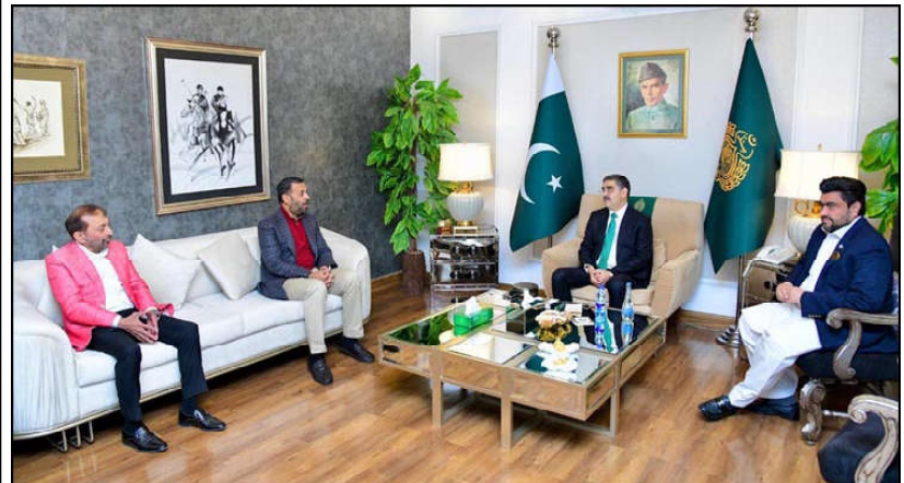
ISLAMABAD: Governor Sindh Kamran Khan Tessori meeting with Caretaker Prime Minister Anwaar-ul-Haq Kakar, MQM leaders Dr. Farooq Sattar and Mustafa Kamal were also present in the meeting.