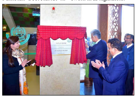
ISLAMABAD: Mr. Murtaza Solangi, Caretaker Federal Minister for Information and Broadcasting inaugurated a 'Display Centre' at Directorate of Electronic media and Publications (DEMP).

ISLAMABAD (APP): The Election Commission of Pakistan (ECP) Thursday urged winning candidates who secured more than one seat in the February 8 polls to vacate one seat before taking the oath. The commission urged the candidates to submit applications for relinquishing seats to either the office of the Chief Election Commissioner at the Election Commission of Pakistan Secretariat in Islamabad or the Provincial Election Commissioner in Punjab, Sindh, Khyber Pakhtunkhwa, and Balochistan. Alternatively, in accordance with Article 223(2), if no action is taken within 30 days, all seats, except the one for which the candidate is ultimately declared successful, will be deemed vacant. The candidates will have to retain only one seat they want before they are sworn in as legislators.