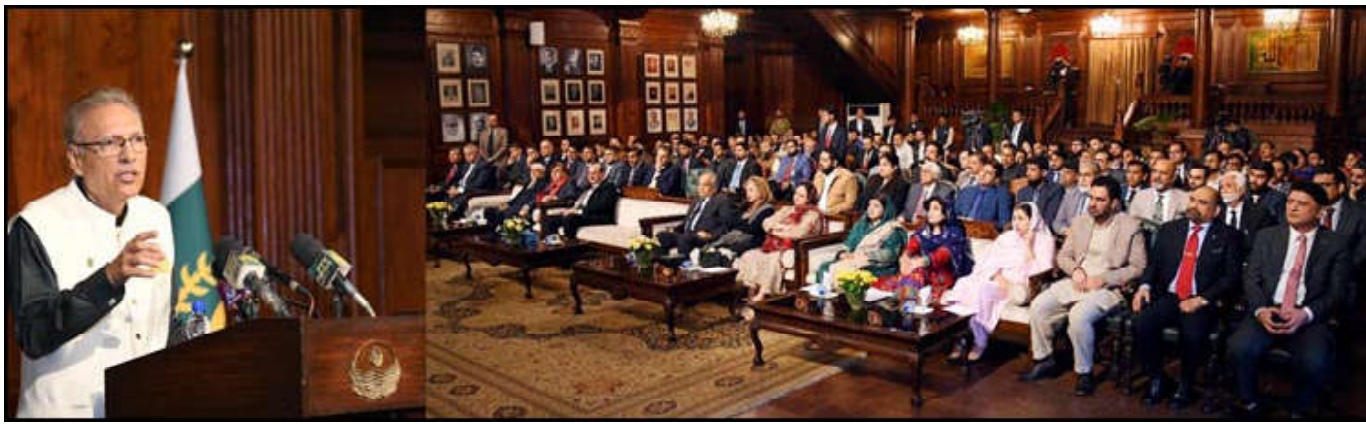
LAHORE: President Dr. Arif Alvi addressing the recognition ceremony of officers of the Federal Insurance Ombudsman and representatives of insurance companies, at Governor House.