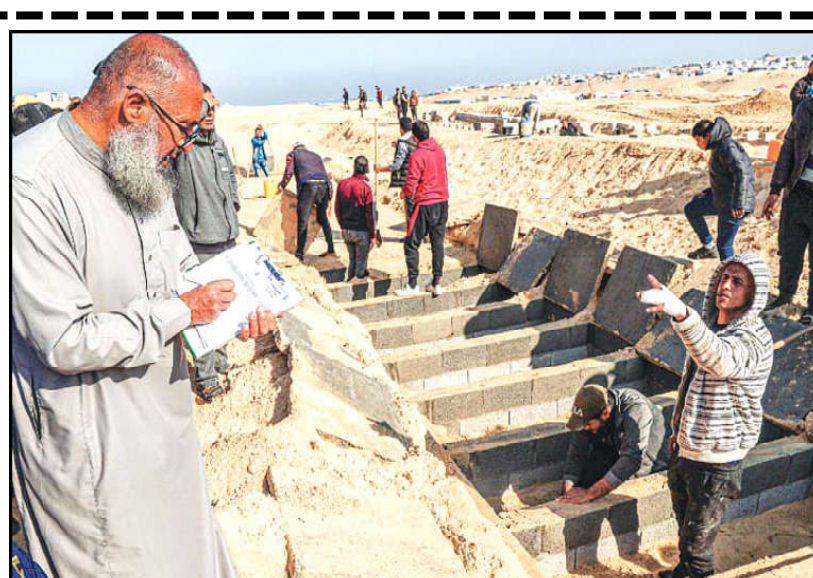
GAZASTRIP: A man records the names of the deceased during the funeral of Palestinians killed in overnight Israeli strikes at a cemetery in Rafah.

in Ukraine, the death of Russian opposition leader Alexei Navalny and U.S. assertions that Russia plans to put a nuclear weapon in space have led to the biggest crisis in relations between Russia and the West since the Cold War. Some Russian and U.S. diplomats say they do not remember a time when relations between the world's two biggest nuclear powers were worse, including during the 1962 Cuban Missile Crisis. Biden said last week after prison officers announced Navalny's death in a Russian penal colony that it was "a consequence of something that Putin and his thugs did." Navalny had previously accused Putin of trying to kill him, an allegation the Kremlin denied.