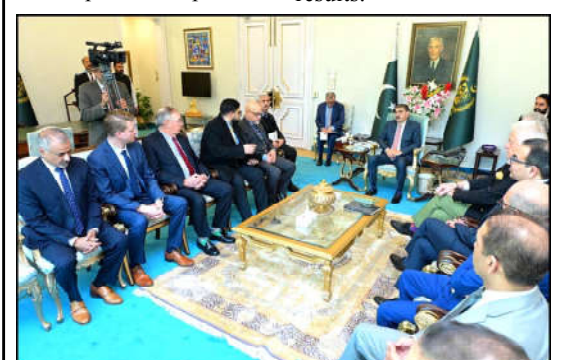
ISLAMABAD: A delegation of Miracle Salt Collective Inc called on Caretaker Prime Minister Anwaar-ul-Haq Kakar.

ISLAMABAD (APP): Caretaker Prime Minister Anwaar-ul-Haq Kakar on Wednesday said Pakistan's mineral sector, valued in billions of dollars, was achieving new heights of development under Special Investment Facilitation Council (SIFC). He was talking to a delegation of Miracle Salt Collective Inc which called on Caretaker Prime Minister Anwaar-ul-Haq Kakar here. He said during its short tenure, the caretaker government took several steps to promote foreign direct investment and to facilitate the businesses in the country which yielded positive results. He said it would also further strengthen the trade ties with the U.S. "This joint venture is a manifestation of the fact that Pakistan has the most suitable destination for foreign investment," he added. He said Himalayan pink salt was the identity of Pakistan in all over the world and its export in international markets would be a welcome sign. He said during its short tenure, the caretaker government took several steps to promote foreign direct investment and to facilitate the businesses in the country which yielded positive results.