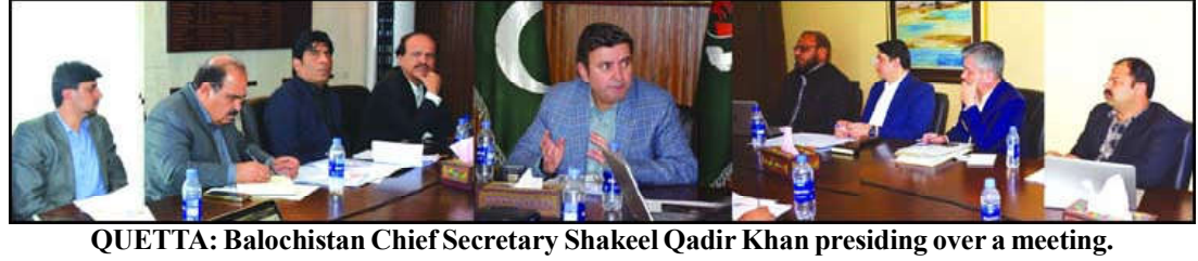
QUETTA: Balochistan Chief Secretary Shakeel Qadir Khan presiding over a meeting.

It was further said in the petition government is removing the section of fixing prices of medicines from drug act. Care taker government does not have these powers. Democratic government is coming and this step can be taken only by it. The petitioner requested the present notification runs contrary to law and constitution. The court should order to suspend the notification till the final decision of this petition.