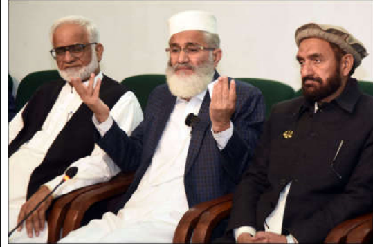
ISLAMABAD: Feb21- Leader of Jamaat-e-Islami Siraj-ul-Haq addressing press conference at Al-Falah Hall sector F-8, in the Federal Capital.

TARBELA (APP): A delegation from the World Bank (WB) conducted a thorough inspection of the ongoing work at the Tarbela Dam T-5 extension project aimed at enhancing the dam's capacity. During the visit they received a detailed briefing regarding the project's progress, highlighting its significance in generating 1530 megawatts of electricity upon completion. The World Bank delegation inspected the site of the fifth extension project of Tarbela Dam, GM Tarbela Anwar Shah and Chief Engineer T-5 Wasim Raza gave a detailed briefing to the delegation about the project's progress and achievements thus far. The project's completion is advancing at a rapid pace, promising to deliver 1530 megawatts of electricity, upon its culmination. It is anticipated that electricity production from the project will commence by August 2025, substantially increasing the total electricity output from the Tarbela Dam from 4888 megawatts to 6418 megawatts. General Manager Tarbela Dam Anwar Shah, Chief Engineers T-5 Wasim Raza and T-4 Taurish Kumar, Consultant Chief T-5 Mark Gill, Director T-5 Electrical Azir Sumro, Director T-5 Faisal Hayat, and AD Public Relations Tarbela Dam Javid Iqbal were present.