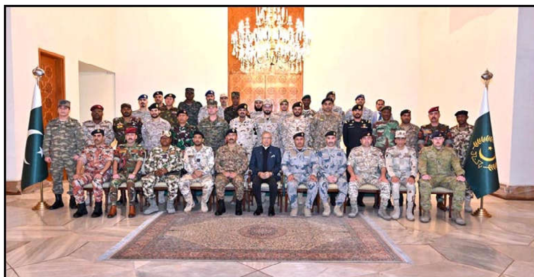
ISLAMABAD: President Dr Arif Alvi in a group photo with a delegation of military officers from friendly countries undergoing training at Command and Staff College Quetta, at Aiwan-e-Sadr.