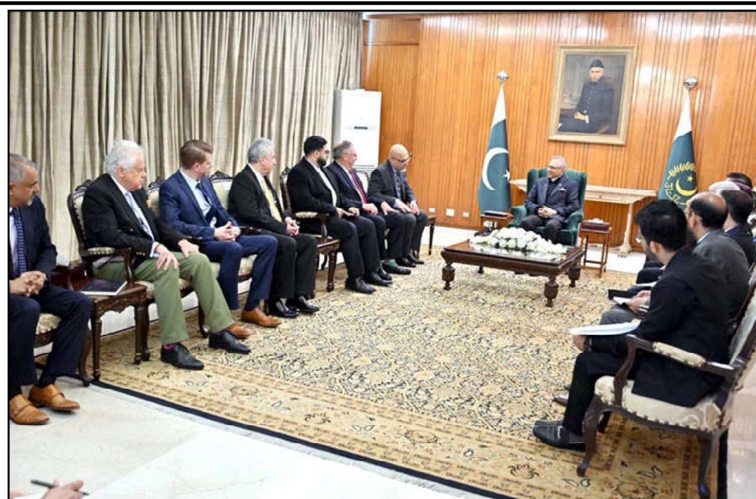
ISLAMABAD: A delegation of Miracle Saltworks Collective Inc, a USA-based salt mining and processing company, called on President Dr Arif Alvi, at Aiwan-e-Sadr.

informed the President that Miracle Salt Works Collective will invest in Pakistan's salt sector. The company will mine and process Pakistani salt using high-quality technology. APP add: President Dr Arif Alvi on Wednesday said that Pakistan desired to build mutually beneficial partnerships with foreign firms by building joint ventures and attracting foreign investment in multiple sectors. He in a meeting with a delegation of Miracle Saltworks Collective Inc, a USA-based salt mining and processing company here, said Pakistan was fully focused on boosting its exports to improve its economic condition. In the meeting, the