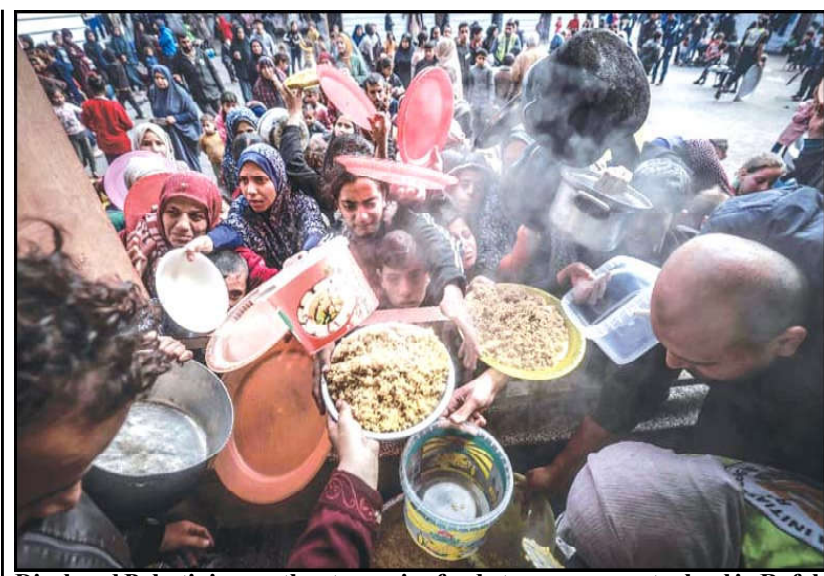
Displaced Palestinians gather to receive food at a government school in Rafah in the southern Gaza Strip, amid ongoing strikes by Israeli forces.

"It's very difficult to see these scenes of people just being cut off," he said, saying food supplies were limited. "It's heartbreaking to see that there are people in health facilities who are not able to be treated correctly," he said.