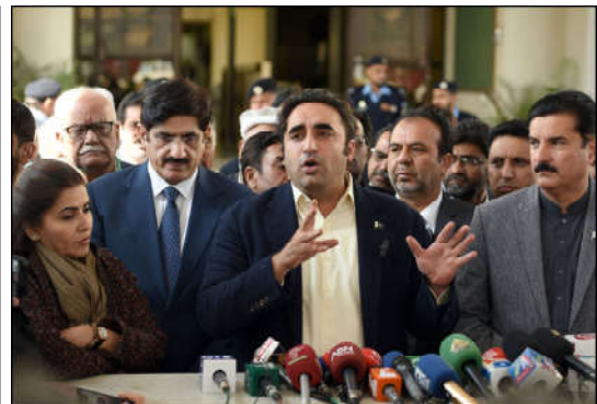
ISLAMABAD: Chairman Pakistan People Party Bilawal Bhutto Zardari talking with media persons after the attending hearing of former Prime Minister Zulfikar Ali Bhutto case at Supreme Court in the Federal Capital.