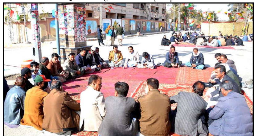
QUETTA: Activates of four Political Party Ittihad hold sit-in in front of RO office for recent General Election.

media men outside SC here Tuesday. He went on to say today once again the hearing of Zulfiqar Ali Bhutto has been held. I think it is an historical case. Dictatorship ruled during the 50 percent of history of the country. Powers of parliament and power are linked to it. This judiciary will administer justice to founder of constitution. Judicial murder of Bhutto took place in dictatorship regime. We hope judiciary will give us justice and wash the taint. We hope this presidential reference will help set right history so that we could draw a line that wrong was done in the past.