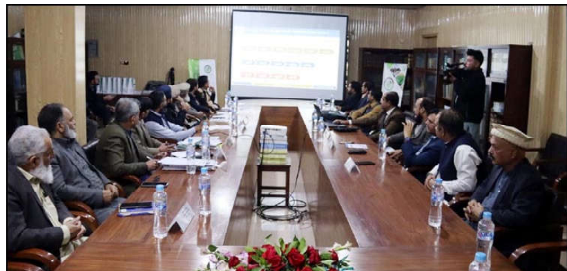
Engagement with Provincial Government Khyber Pakhtunkhwa on February 20, 2024 for the conduct of 7th integrated digital agricultural census.