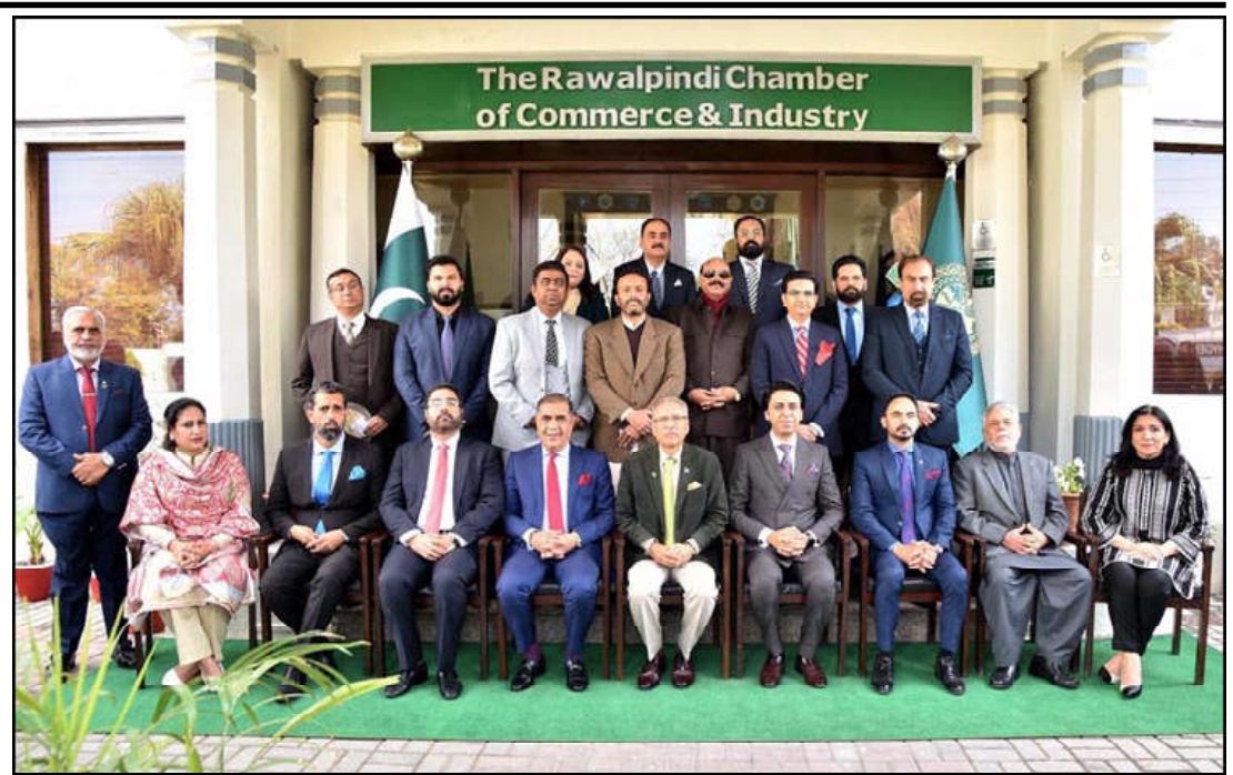
RAWALPINDI: President Dr. Arif Alvi in a group photo with the members of the Rawalpindi Chamber of Commerce & Industry, at National Health Summit on Dental Hygiene.

He advocated for the establishment of preferential and transit trade agreements between the two countries and identified tourism as a promising area for collaboration, citing Azerbaijan's reception of tens of thousands Pakistani tourists every year. The Ambassador highly appreciated ten times increase in direct and indirect, with contribution of SOCAR Trading, trade turnover in last two years.