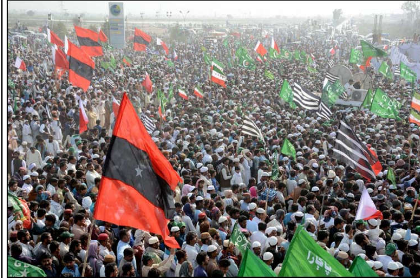
SUKKUR: Leaders and supporters of Grand Democratic Alliance (GDA) are holding protest demonstration against alleged rigging in General Election 2024, at Moro National Highway road in Sukkur.

KARACHI (INP): Muttahida Qaumi Movement-Pakistan (MQM-P) has clarified that Governorship in Sindh was right of the party and it will not give up. According to details, MQM-P assuring Pakistan Muslim League-Nawaz (PML-N) of its support in formation of government has sought support on three-point constitutional amendment.