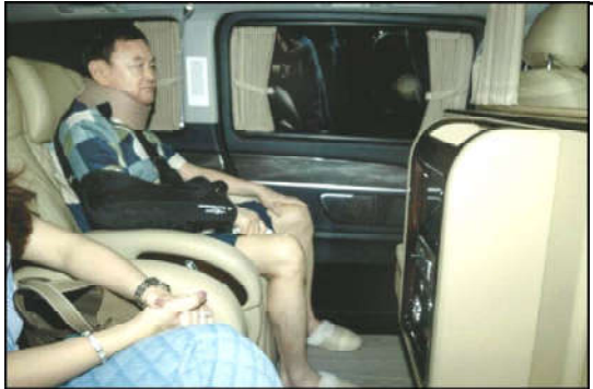
Former Thai Prime Minister Thaksin Shinawatra arrives at his family compound following his release.

The Health Ministry is part of the Hamas-run government in Gaza but maintains detailed records of casualties. Its figures from previous wars in Gaza have largely matched those of U.N. agencies, independent experts and even Israel's own tallies.