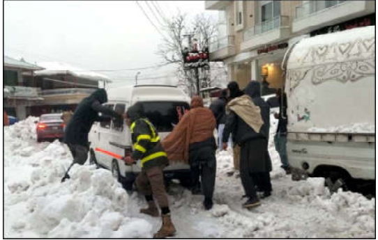
ABBOTTABAD: Rescue officials trying to remove a vehicle stuck in snow covered area after the heavy snowfall of winter season, which more decreases the temperature below in minus degree Celsius, at Nathiagali area in Abbottabad.

Vice Chancellors (VCs) of public and private universities besides parents and graduating students were in attendance.