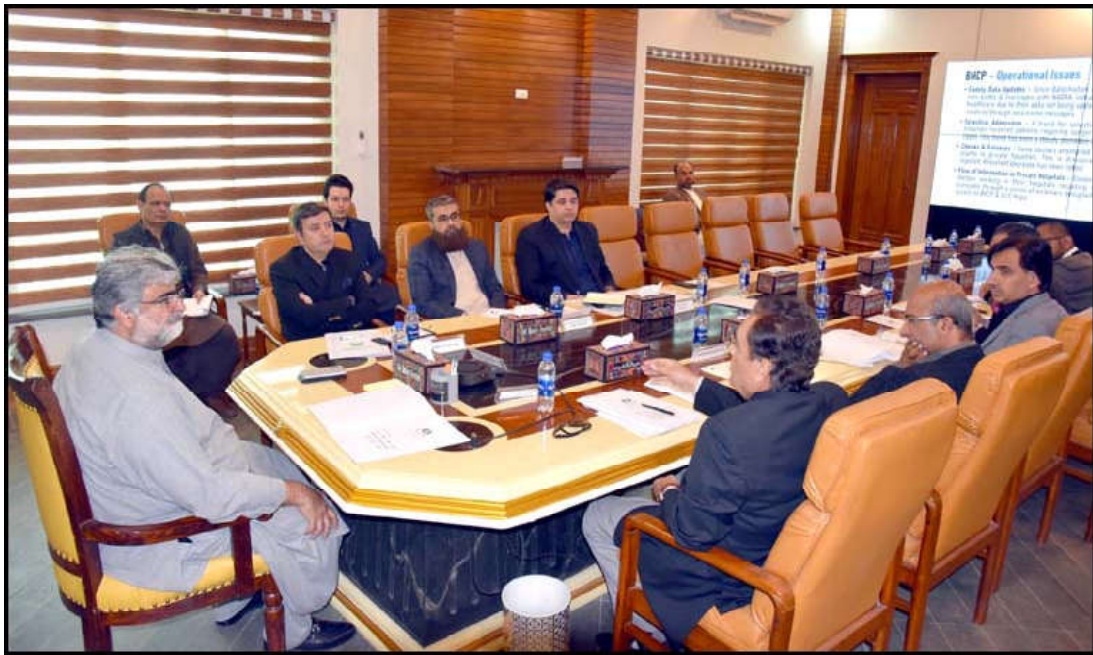
QUETTA: Caretaker Chief Minister Balochistan Mir Ali Mardan Khan Domki presiding over a meeting to review performance and activation of Balochistan Health Card Program.

Ph: 2841470/2841473 Vol: XIX No. 250, Shaban 09, 1445 AH Tuesday February 20, 2024, Pages 04, Price Rs.15