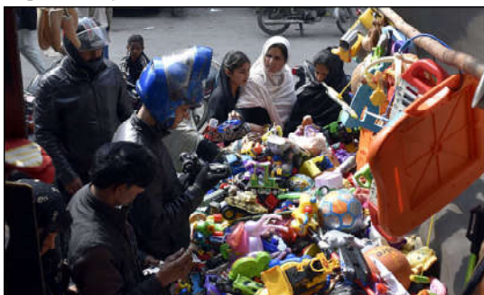
LAHORE: People are busy buying secondhand toys at a Landa bazaar in Provincial Capital.

He said, "We must focus on exporting highly skilled manpower to overcome this trade gap. The economy is facing multiple challenges and fundamental administrative changes are needed to resolve the issues. We are exporting unskilled and semiskilled workers which are sending $30bn remittances. The proposed ministry may be tasked with identifying the specific needs of each potential country and produce human resources in that particular area."