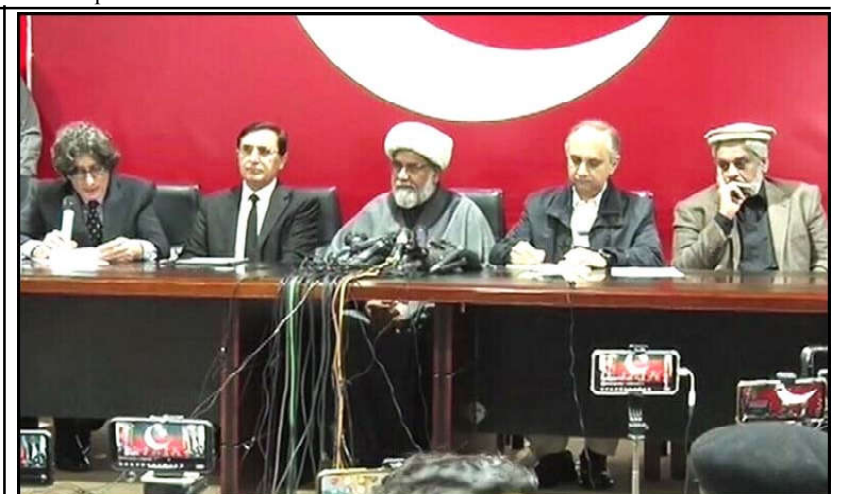
ISLAMABAD: Leaders of Pakistan Tehreek-e-Insaf (PTI) and Sunni Ittehad Council (SIC) addressing a Press conference