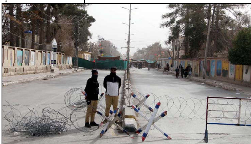
QUETTA: Security officials are standing high alert to avoid untoward incident as security has been high alert due to protest of four-party alliance against alleged rigging in General Election 2024, outside DC Office in Quetta.