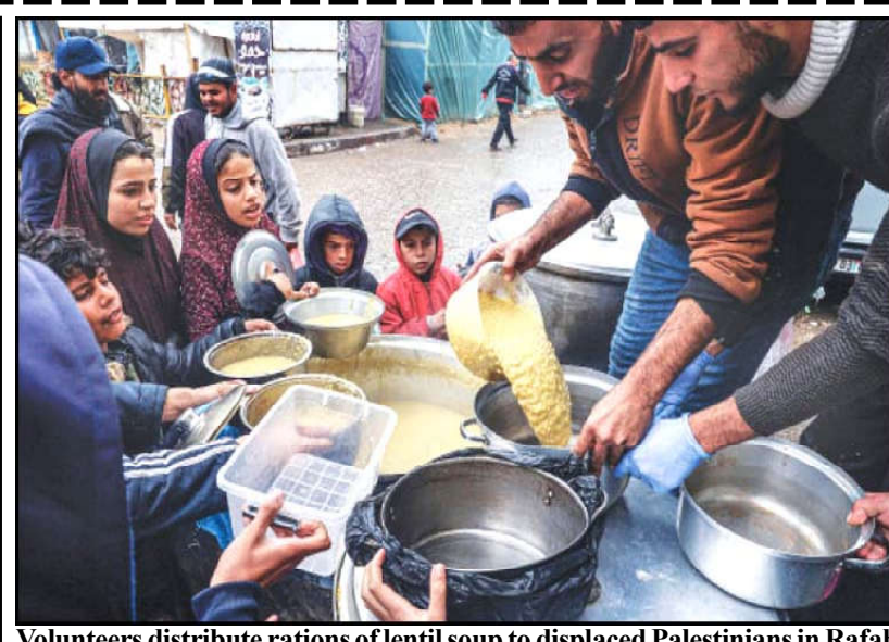
Volunteers distribute rations of lentil soup to displaced Palestinians in Rafah in the southern Gaza Strip.

But now, after more than four months of war that has flattened huge swathes of the Strip, Gazans are inching closer towards famine, according to the UN's World Food Programme.