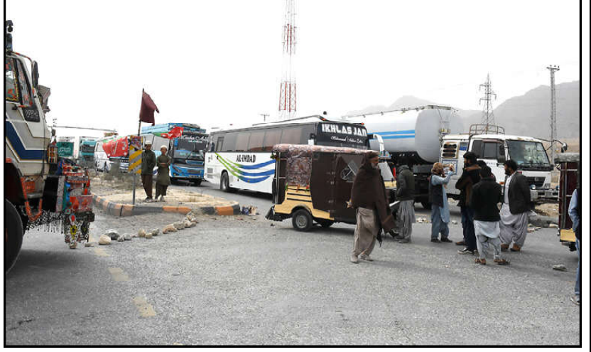
QUETTA: A view of traffic jam on the national highways due to Char Jamaati Ittihad protest against the alleged interference in the elections.

"Security forces of Pa-kistan are determined to wipe out the menace of terrorism from the country and such sacrifices of our brave soldiers further strengthen our resolve," the ISPR said.