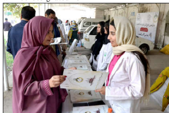
LAHORE: The pilgrims of Hajj are being guided with all possible efforts by the Ministry of Religious Affairs on the styles of medical camp and training camp in Haji Camp.

The launch of electric bikes can overcome the problems of exertion and would not take much time to reach their destinations,