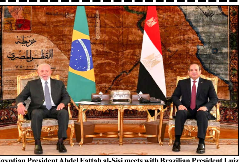
Egyptian President Abdel Fattah al-Sisi meets with Brazilian President Luiz Inacio Lula da Silva to discuss the latest developments in the Gaza Strip amid the ongoing conflict between Israel and the Palestinian Islamist group Hamas, at the Ittihadiya presidential palace in Cairo, Egypt.

Air pollution is caused by a combination of crop-related burning, industrial pollution and heavy traffic, and a smoky haze covered the Bangkok's skyline. Prime Minister Srettha Thavisin told reporters that crop burning was the main culprit behind the spike, but added that around quarter of the pollution was from vehicles, a factor "we can control". Swiss air quality tracking website IQAir said the level of fine inhalable particles in the city was 15 times higher than the recommended level by the World Health Organization, making it the world's 8th most polluted city on Thursday.