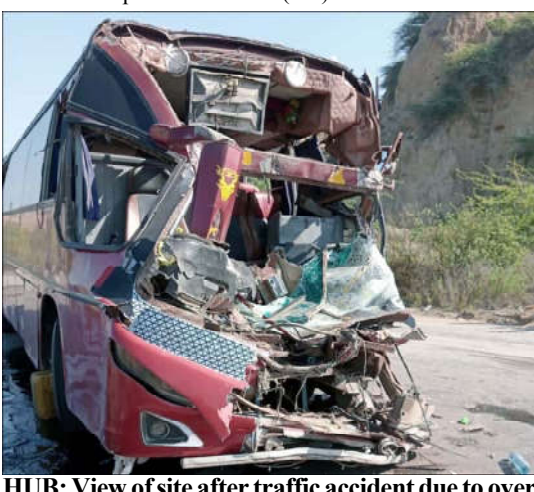
HUB: View of site after traffic accident due to over speeding and break failed, at Quetta-Karachi Highway road near Winder in Hub.

Pakistan Tehreek-e-Insaf (PTI) has nominated Ali Amin Gandapur as the Chief Minister candidate of the Khyber Pakhtunkhwa