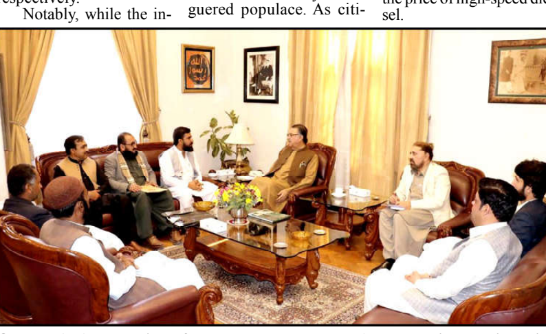
QUETTA: A delegation of teachers led by Master Abdul Karim meeting with Governor Balochistan Malik Abdul Wali Khan Kakar

Following a hike of Rs13.55 per liter in petrol prices from February 1, authorities are now contemplating an increase in the price of high-speed die-