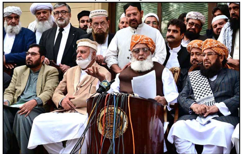
ISLAMABAD: President of Jamiat Ulema-e-Islam (F), Maulana Fazlur Rehman addresses a media talk at G-6/4.

“Defeating the JUI-F through poll rigging was a conspiracy of anti-Islamic elements. Our fault is that we played our role in mending the relationship between Pakistan and Afghanistan, which is not acceptable to the US.”