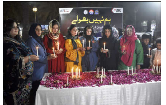
LAHORE: Women police and members of civil society lit candles during candle light vigil to pay tribute to the martyrs of police officers at Faisal Chowk, in the Provincial Capital.

appear in the court. One day exemption plea from attendance was filed on his behalf. The court accepted the plea. The court while summoning the arguments on the petition of permanent exemption of Hamza Shehbaz from attendance adjourned the hearing till March 12. Shehbaz Sharif and Hamza Shehbaz are charged with constructing nullah from national kitty. NAB Lahore has filed reference in AC Lahore.