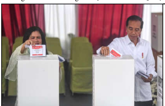
President Joko Widodo and First Lady Iriana cast their ballots at a polling station during the general election in Jakarta, Indonesia.

military. Ukraine has moved onto the defensive in the war, hindered by low ammunition supplies and a shortage of personnel, but has kept up its strikes behind the largely static 1,500-kilometer (930-mile) front line. It is the second time in two weeks that Ukrainian forces have said they sank a Russian vessel in the Black Sea. Last week, they published a video that they said showed naval drones assaulting the Russian missile-armed corvette Ivanovets. Ukraine's Military Intelligence, known by its Ukrainian acronym GUR, said its special operations unit "Group 13" sank the Caesar Kunikov using Magura V5 sea drones on Wednesday. Explosions damaged the vessel on its left side, it said, though a heavily edited video it released was unclear.