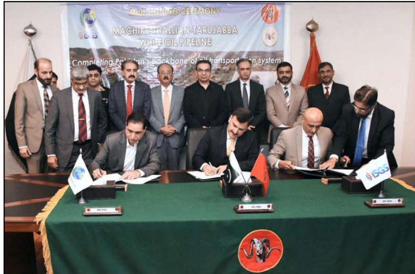
ISLAMABAD: The signing ceremony of MoU between the Stakeholders on Consortium Formation for Machike-Thallian-Tarujabba White Oil Pipeline Project at SIFC Secretariat, PM Office.