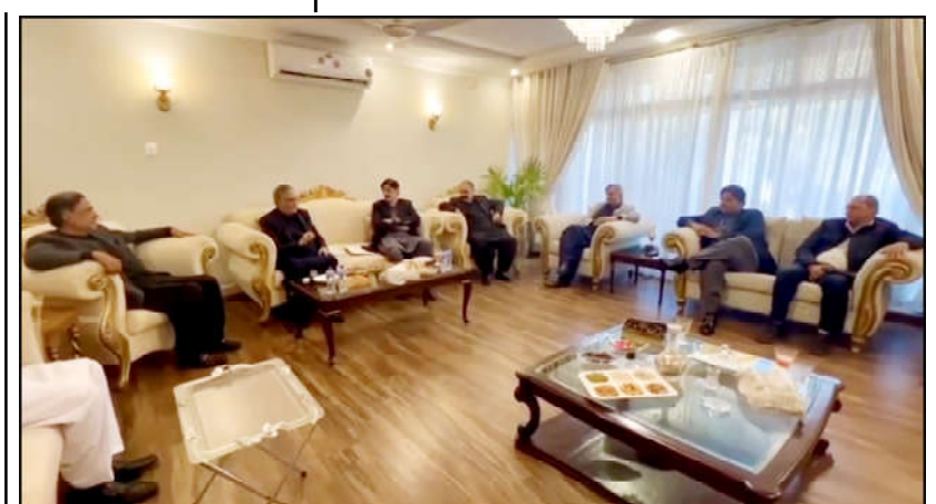
A view of consultative meeting of the nominated representatives of Pakistan Muslim League (N) and Pakistan People’s Party held in Islamabad

According to party sources, the junior Sharif briefed his elder brother on the meetings with various allies.