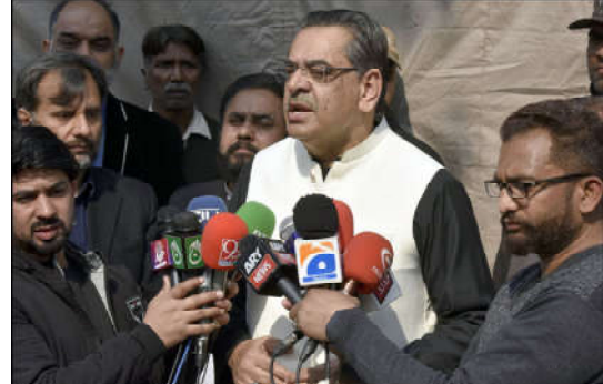
LAHORE: Caretaker Minister for Religious Affairs and Interfaith Harmony Aneeq Ahmed talking with persons after visiting Haji Camp, in the Provincial Capital.

LAHORE (APP): Caretaker Federal Minister for Religious Affairs and Interfaith Harmony Aneeq Ahmed has announced that this year's Hajj is set to be optimal for Pakistani pilgrims, offering unprecedented facilities. He introduced a short-term Hajj facility for the first time, marking a notable milestone in the nation's history. Addressing the start of the training session for pilgrims at Darul Hajj Camp on Wednesday, he announced that during Hajj, all women would receive Abayas, adorned with the Pakistani flag. Selected through a transparent system, the minister said fortunate pilgrims were chosen via a draw, and their training began on February 12. He said that Hajj pilgrims were the guests of Allah and a true ambassador of Pakistan, which would be facilitated with advance facilities. He said that when he took charge of the ministry, it was made clear that in 2024, Pakistani pilgrims would be provided with the best facilities. This year's Hajj would be exemplary for Pakistani pilgrims, offering facilities that were not available in the past. The minister highlighted the comprehensive efforts made by the ministry regarding Hajj arrangements, collaborating with Saudi Arabia during a visit to assess the facilities, provided to pilgrims. He mentioned that accommodations, meals, and transportation, along with all basic necessities, had been standardised.