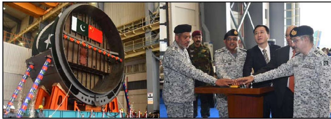
Chief of the Naval Staff Admiral Naveed Ashraf laying the Keel of 6th HANGOR Class Submarine at Karachi Shipyard.