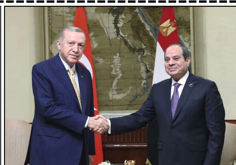
President Tayyip Erdogan meets with Egypt's President Abdel Fattah al-Sisi in Cairo, Egypt.

initiative that achieves an end to aggression and war," a Hamas official told AFP on condition of anonymity. The quest for a ceasefire comes after the United States and the United Nations warned Israel against carrying out a ground offensive into Rafah, the southernmost Gaza city where more than a million Palestinians are trapped. The official said Hamas had told the participants it does not trust Israel not to renew the war if the Israeli prisoners being held by Palestinians are released. The prisoners have been detained by Hamas since Oct 7 to pressurise Israeli forces to stop unending assaults on the people of Palestine.