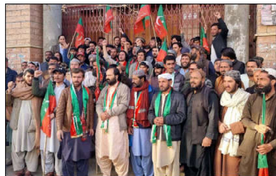
QUETTA: Activists of Tehreek-e-Insaf (PTI) are holding protest demonstration against alleged rigging in Election 2024, at Quetta press club.

ISLAMABAD (INP): Expressing surprise that the people of Gilgit-Baltistan (GB) still had no idea about their constitutional status, Chief Justice of Pakistan (CJP) Justice Qazi Faez Isa on Wednesday suggested holding a referendum or a plebiscite in GB and Pakistan-administered Kashmir. A three-member bench of the Supreme Court (SC), headed by the CJP, heard the petition filed against the appointment of judges to the top court of GB. The additional attorney general (AAG) said that it was the job of the United Nations to hold a plebiscite in these territories. The CJP replied that he had no information about that. "All I am asking you whether this is possible." The AAG told the apex court that the government wanted to make GB part of the federation, but some international conventions were stumbling blocks in its way. The chief justice said that India had devalued the state of Jammu and Kashmir by abolishing its special status. He then asked whether the federal government had been formed after the elections. "Who has been elected as the prime minister?" Saad Hashmi, counsel for the GB government, told the CJP that the government was yet to be formed.