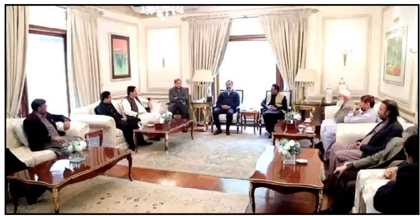
LAHORE: Newly elected independent candidates meeting with President PML (N) Shabbaz Sharif on eve of their joining the party.

Both parties affirmed their dedication to steering Pakistan away from political instability and towards a path of prosperity and resilience.