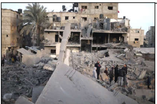
Palestinians gather at the site of an Israeli strike on a house, amid the ongoing conflict between Israel and the Palestinian Islamist group Hamas, in Rafah in the southern Gaza Strip.