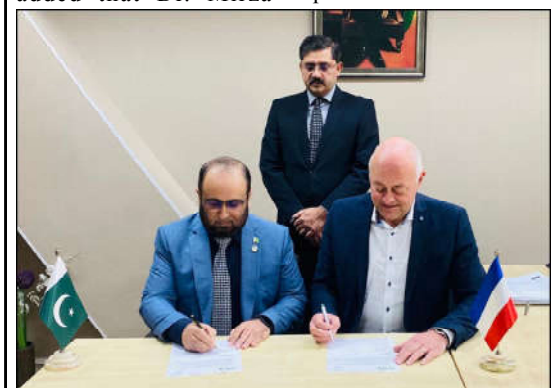
LAHORE: FPCCI and Lahore Chamber's Standing Committee for Machinery Manufacturers and Importers signed an important memorandum of understanding with the world-renowned company MEF Machine to ensure the exchange of modern technology, cooperation on mutual and commercial issues.