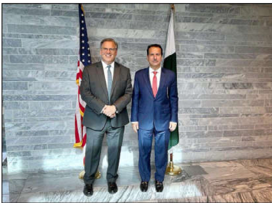
ISLAMABAD: Federal Health Minister Dr Nadeem Jan meets with US Ambassador in Pakistan.

LAHORE (INP): Some people are planning to repeat the May 9 events, warned Punjab Caretaker Chief Minister Mohsin Naqvi on Monday, as he said that the intelligence agencies had the evidence of the attempts. Talking to reporters in Lahore, Naqvi said the intelligence agencies had recorded the discussions held among such elements on the subject and made it clear that there would be a strong reaction if anyone tried to replicate the May 9 violence. He said anyone having objections over the Feb 8 polls results should approach the Election Commission of Pakistan (ECP) and added that the government would not allow repeating the May 9. No one would be stopped from staging peaceful political protest which was a democratic right, Naqvi said, but stated that the violent actions were unacceptable and the government could not allow creating further divisions among the nation. It was the PTI which had carried out attacks on the military and other government installations after the arrest of their party chief and the party is now busy in levelling rigging allegations despite having a massive win in Khyber Pakhtunkhwa and sizeable seats in Punjab.