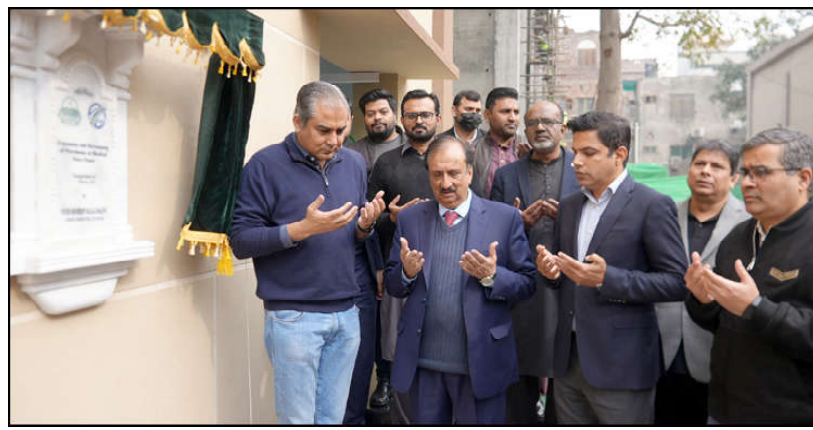
LAHORE: Caretaker Chief Minister Punjab Mohsin Raza Naqvi offering Dua after inaugurating Extension & upgradation Project of State of the Art Medicine Ware House at Gulberg.