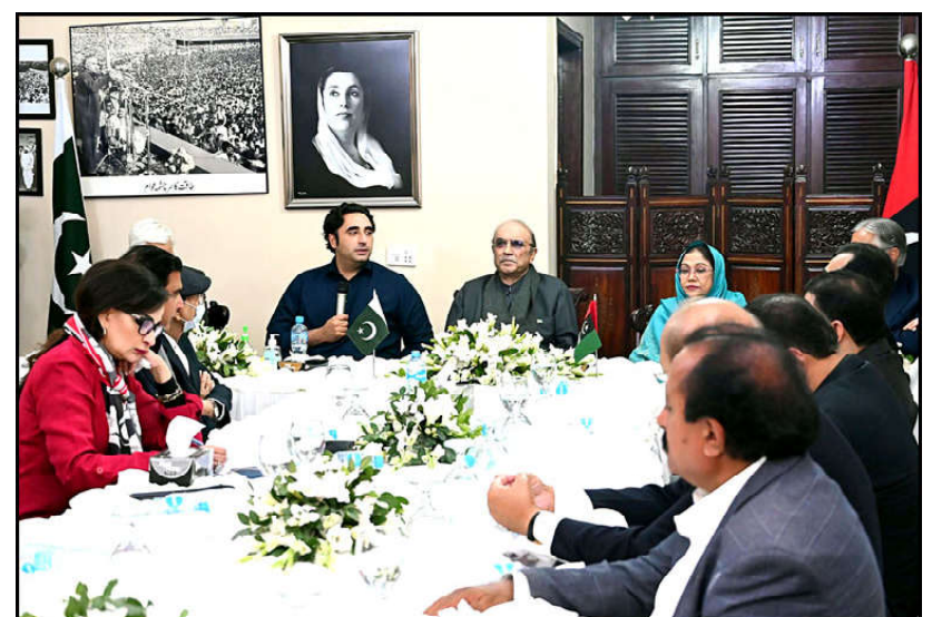
ISLAMABAD: President Pakistan People's Party Parliamentarians Asif Ali Zardari, Chairman Pakistan People's Party Bilawal Bhutto Zardari chairing PPP Central Executive Committee (CEC) at Zardari House in the Federal Capital.

QUETTA (Online): 6 bodies have been recovered from hilly area in Qilla Saifullah Balochistan. According to Levies sources 6 bodies have been recovered from hilly area near the city in Qilla Saifullah. The bodies have been sent to hospital through ambulance.