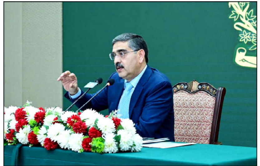
ISLAMABAD: Caretaker Prime Minister Anwaar-ul-Haq Kakar talks to National and foreign media in a press conference.

grievances. In Sweden, the similar exercise almost took 10 to 11 days while in Indonesia, almost a month was consumed to furnish results, he added. To another question, the prime minister said that mobile phone services were suspended on the polling day due to security threats as the government could not compromise on the security of people. On the other hand, the broadband internet services were available on that day, enabling the people to get connected, he said and rebutted the allegations that the move was aimed at managing the social media. He said there were other occasions throughout the year, when the mobile services had been suspended to avert security threats.