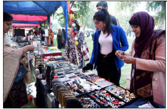
LAHORE: Women visiting stall during Faiz Mela at Al-Hamra.