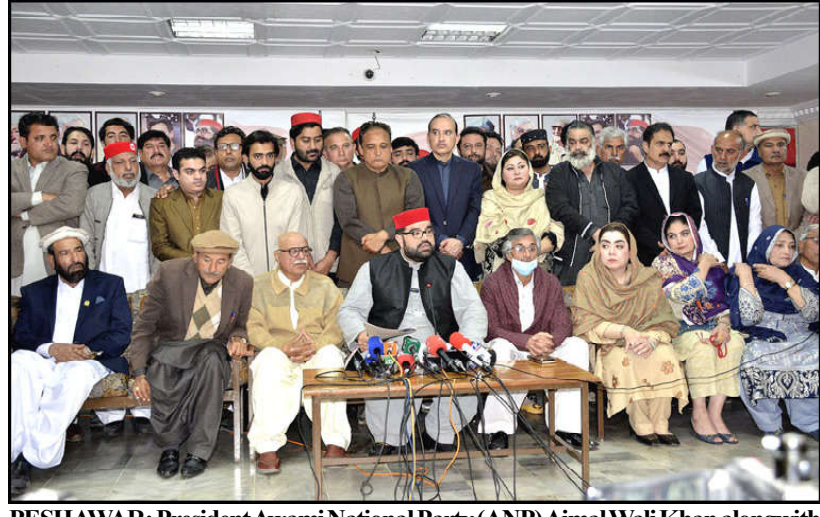
PESHAWAR: President Awami National Party (ANP) Aimal Wali Khan alongwith other party leaders addressing a Press conference at Bacha Khan Markaz.

Wahdat-e-Muslimeen Paki- with 28, independent can- and JI-P one each. Indepenstan, Pakhtunkhwa Na- didates 13, and the Grand dent candidates also Democratic Alliance and grabbed six seats.