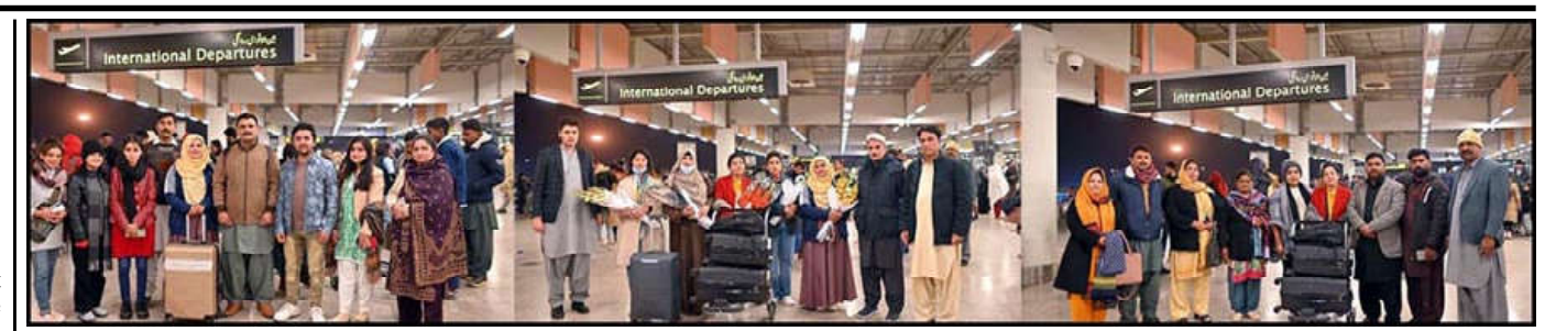
First set of Pakistanis among batch of 600 start Overseas Careers post landmark agreements by Ministry of Overseas Pakistanis and Human Resource Development.

effective prevention of MULTAN Under the Punjab Tanzeem-e-Tajraan Pakistan government's Agricultural expressed concerns over rising incidents of dacoities Emergency Program, a in city's busiest markets national program to increase and demanded of Punjab sugarcane production per government to take immediate notice of the poor law and order situation