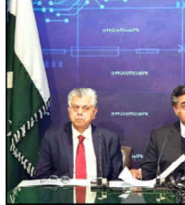
ISLAMABAD: Federal Minister for Interior, Dr. Gohar Ejaz and Murtaza Solangi, Federal Minister for Information and Broadcasting addressing a press conference, in Islamabad.

Dispelling rumors surrounding the elections on February 8, Dr. Ejaz clarified that, as of now, no decision had been made to shut down mobile or internet services.