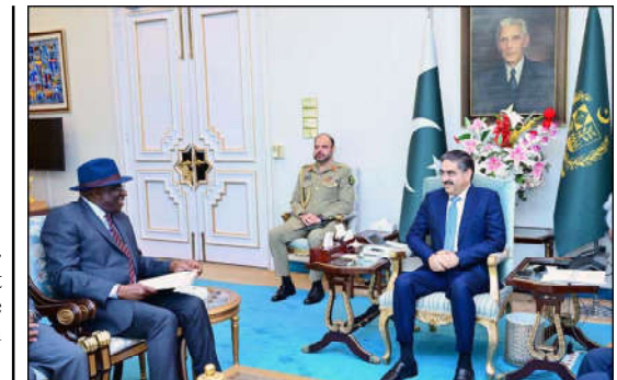
ISLAMABAD: Chairperson of the Common Wealth Observer Group for General Election H.E Dr Goodluck Ebele Jonathan along with the delegation called on Caretaker Prime Minister, Anwaar-ul-Haq Kakar.