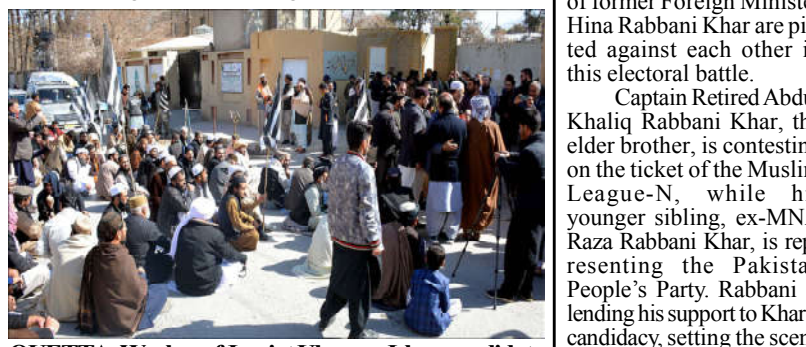
QUETTA: Worker of Jamiat Ulema-e-Islam candidate PB-39 hold protest in front of the DC office.