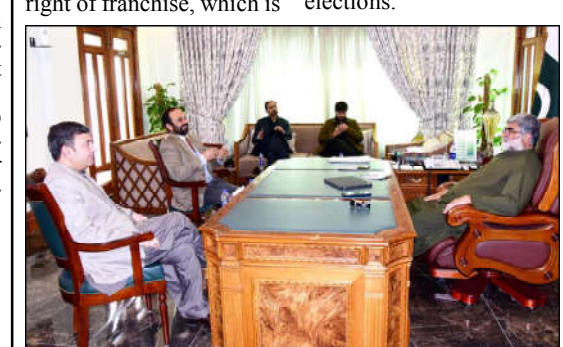
QUETTA: Caretaker Home Minister Mir Muhammad Zubair Jamali and Chief Secretary Balochistan Shakeel Qadir Khan meeting with Caretaker Chief Minister Balochistan Mir Ali Mardan Khan Domki

an undemocratic process, he added. It had been further stated that it is also duty of all political parties, claimants of the democracy, to provide opportunities to women to cast votes in large number so that they may play their effective role in the country's democratic system and decision and policy making. The women were also urged to play their positive role for supremacy of democracy by using their right of franchise in the elections.