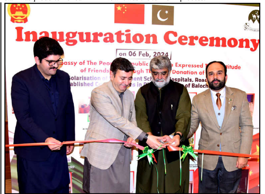
QUETTA: Caretaker Chief Minister Balochistan, Mir Ali Mardan Khan Domki formally inaugurating different projects of solarization and computer labs completed with assistance of China.