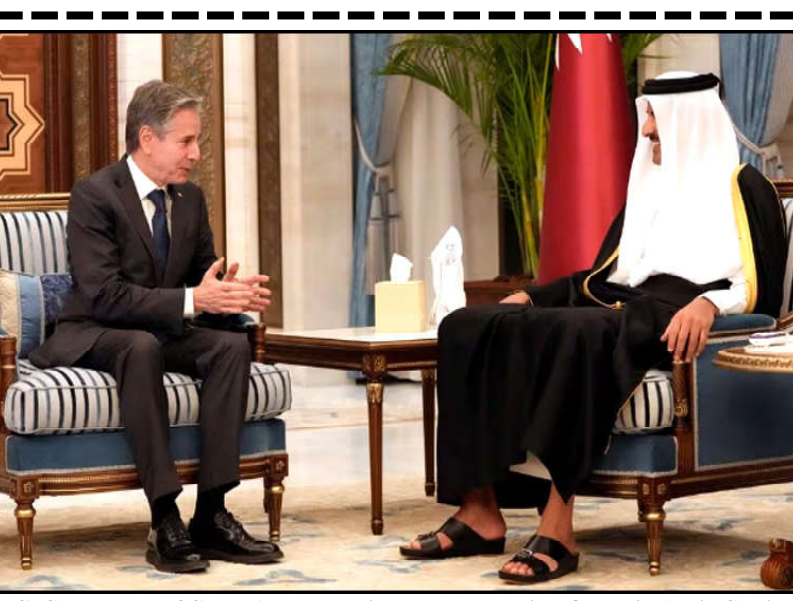
U.S. Secretary of State Antony Blinken meets with Qatar's Amir Sheikh Tamim bin Hamad Al Thani at Lusail Palace, in Doha, Qatar.

meeting Tuesday with Egyptian President Abdel-Fattah el-Sissi, has said repeatedly that Palestinians must not be forced out of Gaza. During his latest trip, Blinken is seeking progress on a cease-fire deal, on potential normalization of relations between Israel and Saudi Arabia, and on preventing an escalation of regional fighting. On all three fronts, Blinken faces major challenges. Hamas and Israel are publicly at odds over key elements of a potential truce. Israel has dismissed the United States' calls for a path to a Palestinian state, and Iran's militant allies in the region have shown little sign of being deterred by U.S. strikes.