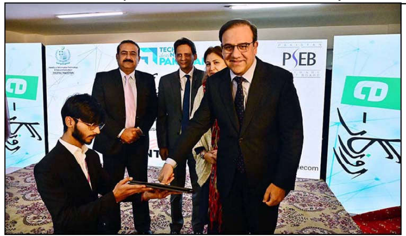
ISLAMABAD: Caretaker Federal Minister for IT & Telecom Dr. Umar Saif inaugurates Pakistan's First Private Sector E-Rozgaar Center managed by EC Services in association with NTS.