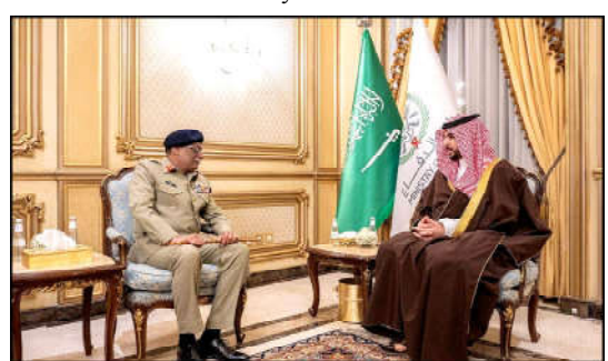
RAWALPINDI: Chairman Joint Chiefs of Staff Committee (Chairman CJCS) General Sahir Shamshad Mirza, called on Prince Khalid Bin Salman Bin Abdulaziz Al-Saud during his official visit to KSA.

RAWALPINDI (INP): Chairman Joint Chiefs of Staff Committee (CJCS) General Sahir Shamshad Mirza called on Saudi Defence Minister Prince Khalid Bin Salman Bin Abdulaziz Al-Saud, Inter Service Public Relations (ISPR) said on Tuesday. According to the military's media wing, strategic, security issues and opportunities to enhance defence cooperation between the two brotherly countries came under the discussion during the meeting. The meeting of Gen Sahir Shamshad Mirza with the Saudi Defence Minister was held during his official visit to the Kingdom of Saudi Arabia in connection with the Second World Defence Show. The CJCS also visited stalls of different organisations from Pakistan and inaugurated Al-Fatah-II Missile stall at the event.