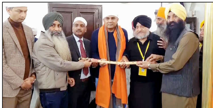
LAHORE: Caretaker Chief Minister Punjab Mohsin Raza Naqvi being presented "Karpan" by representative of Sikh Community during his visit to Kartarpur.

of control rooms and the establishment of an efficient complaint redressal mechanism. He stressed that ensuring peaceful and fair elections is a national responsibility, urging everyone to work together as a team. The meeting was attended by Chief Secretary Punjab, Inspector General Police, Provincial Election Commissioner, Additional Chief Secretary, Interior Secretary, Secretaries from Local Government, Transport, Finance, CCPO, MD Punjab Safe Cities Authority, Commissioner Lahore, Deputy Commissioner, and other officials.