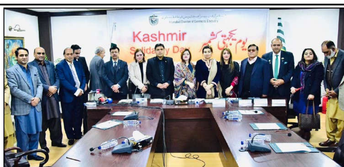
Special Assistant to Prime Minister for Human Rights and Women Empowerment Mushaal Hussein Mullick in a group photo with the organizers and participants of the event organized by Islamabad Chamber of Commerce and Industry in connection with Kashmir Solidarity Day in Islamabad.

He said, the best facilities including high-speed internet, UPS, training centers, individual cabins, meeting rooms and separate office rooms for start-ups had been provided to freelancers. The minister said that with the completion of the