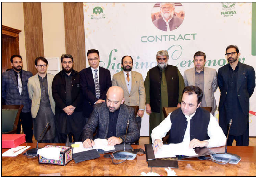
QUETTA: Caretaker Chief Minister Balochistan Mir Ali Mardan Khan Domki attending a MoU signing ceremony between Provincial Government and NADRA to start Computerized Weapon License