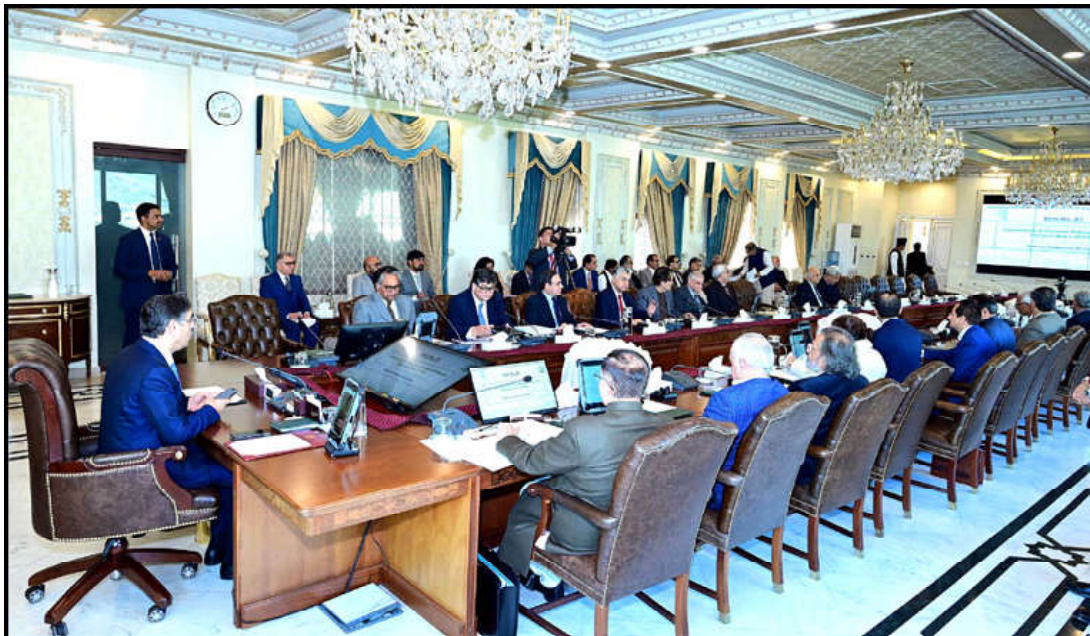
ISLAMABAD: Caretaker Prime Minister Anwaar-ul-Haq Kakar chairs a meeting of the Caretaker Federal Cabinet, in the Federal Capital.

Ph: 2841470/2841473 Vol: XIX No. 23, Rajab 26, 1445 AH Wednesday February 07, 2024, Pages 04, Price Rs.15