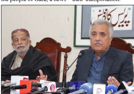
QUETTA: Central leader of National Party Senator Mir Kabeer Muhammad Shahi addressing a Press

The humanitarian assistance flight destined for Gaza will land in Al-Arish, Egypt, where the Pakistan's Ambassador will take charge of the supplies and oversee their transportation.