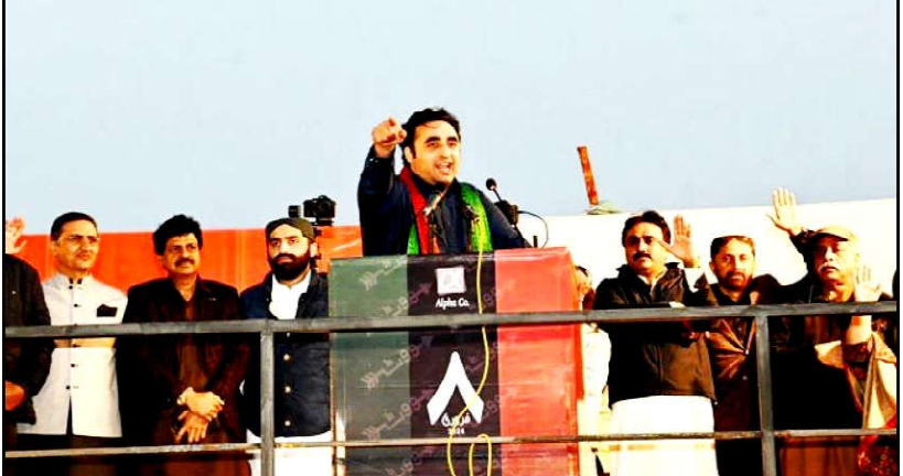
HYDERABAD: Chairman PPP Bilawal Bhutto Zardari addressing a elec-

"Pakistan will continue to extend its unstinted moral, diplomatic and political support for this just cause," Prime Minister Office Media Wing, in a press lasting solution of the release, quoted the prime minister as saving.