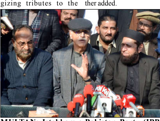
MULTAN: Istehkam-e-Pakistan Party (IPP) Chairman Jahangir Tareen addressing a press

The Indian forces have used all means of oppression and suppression to subdue innocent Kashmiri people, but they stood firmly to their ground with the utmost courage and resilience," they fur-