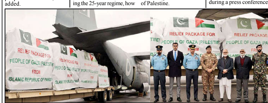
ISLAMABAD: NDMA coordinated and dispatched the fifth tranche of humanitarian assistance to Gaza through C-130 aircraft from NurKhan Base.

Final products or packaged foods, such as food allergens like gluten in wheat, products made from eggs, fish products, peanuts, milk, and milk-based products including lactose, must also be clearly men-