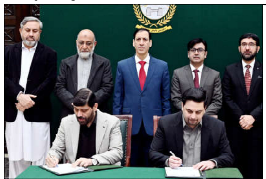
PESHAWAR: Caretaker Chief Minister Khyber Pakhtunkhwa Justice (R) Syed Arshad Hussain Shah witnessing signing of MoU between KP IT Board and Alkhidmat Foundation.