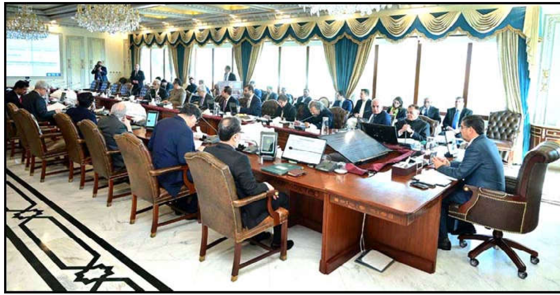
ISLAMABAD: Caretaker Prime Minister Anwaar-ul-Haq Kakar chairs a meeting of the Caretaker Federal Cabinet.

The minister said that speakers in the seminar had highlighted the historical background of elections in Pakistan thoroughly.