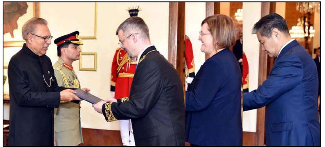
ISLAMABAD: The Ambassadors-Designates of Russia, Italy and Mongolia presenting their diplomatic credentials to President Dr. Arif Alvi, at Aiwan-e-Sadr.

against the Palestinian people. "These ongoing atrocities go against the spirit of the provisional measures decided by the International Court of Justice to protect the people of Gaza," she remarked. Besides, she said the suspension of funding for the United Nations Relief and Works Agency for Palestine Refugees in the Near East (UNRWA) also went