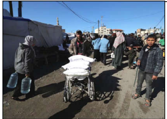
A Palestinian man carries bags of flour distributed by the United Nations Relief and Works Agency (UNRWA), amid the ongoing conflict between Israel and Hamas, in Rafah in the southern Gaza Strip.

strengthen Beijing's military. A spokesperson for the Chinese embassy in Washington said China opposed the move and called it an abuse of state power, adding that it ran counter to the US's "alleged commitment to market competition and international fair trade." Hesai Group said it does not sell products to any military in any country and it does not have ties with any military. The company said it was disappointed to be added to the list. YMTC, and Megvii did not immediately respond to requests for comment. While being placed on the list doesn't involve immediate bans, it can be a blow to designated companies' reputations and represents a stark warning to US entities and companies about the risks of conducting business with them.