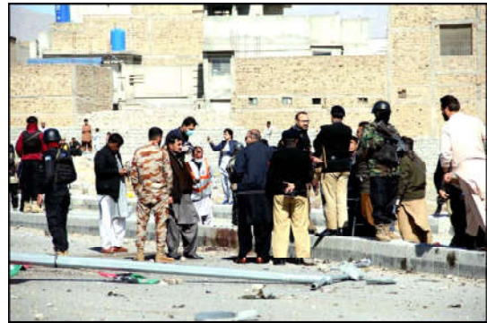
QUETTA: Police officials cordoned off the area and are ascertaining the nature of the blast after the explosion, at Spinnay road in Quetta.