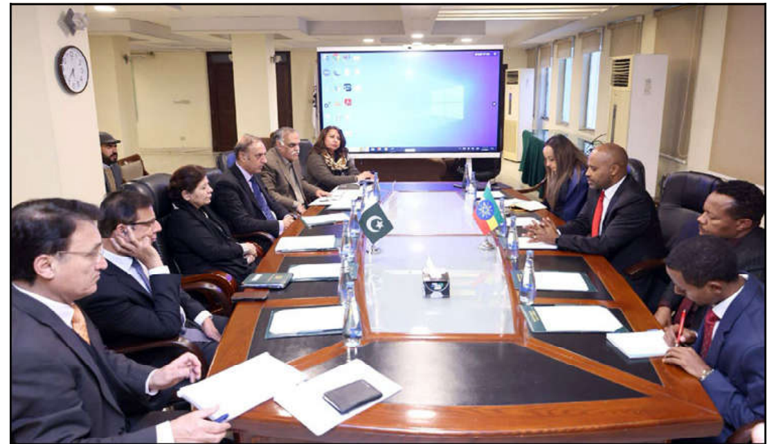
ETHIOPIA: Finance Minister Dr. Shamsad Akhtar, exchanging views with Ethiopian State Minister of Finance Eyob Tekalign Tolina during the meeting. The Federal Democratic Republic of Ethiopia and the Islamic Republic of Pakistan on Thursday explored different avenues for economic cooperation during a bilateral meeting took place here in Islamabad at the Ministry of Finance.

We will continue to implement policies that support our exporters, diversify our export base, and enhance trade facilitation. I am confident that Pakistan is on the right track to achieving its trade goals and becoming a leading player in the global economy."