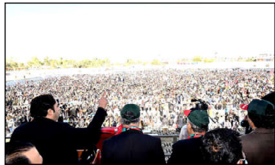
only party that does not bow before anyone... we are ready to fight all forces but we cannot compromise on people's rights," he declared.

During the public meeting, Bilawal emphasised the PPP's commitment to fighting for the rights of the people of Balochistan, stressing that the party does not bow down to external pressures. "Yes, people know that PPP is the