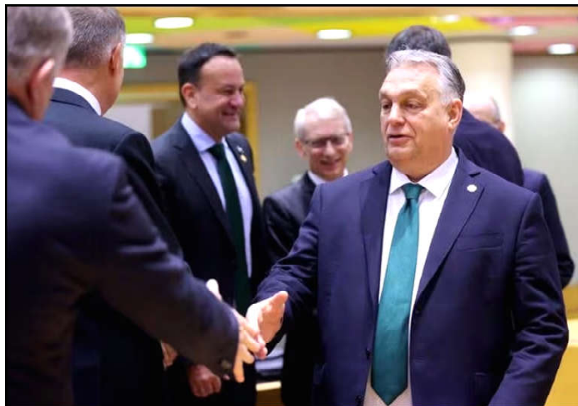
Hungary's Prime Minister Viktor Orban attends a European Union summit in Brussels, Belgium.

plied Patriot air defense systems to shoot down a Russian military transport plane in the Belgorod region on Jan. 24. Russian authorities said the crash killed all 74 people onboard, including 65 Ukrainian POWs heading for a swap. Ukrainian officials didn't deny the plane's downing but didn't take responsibility and called for an international investigation. Putin said Russia wouldn't just welcome but would "insist" on an international inquiry on what he described as a "crime" by Ukraine.