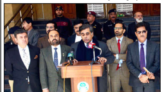
QUETTA: Caretaker Interior Minister Dr. Gohar Ejaz addressing a Press conference regarding holding of peaceful elections

Iranian envoy to Pakistan in his statement condemned the killings of Pakistani labourers in Iran and said Tehran and Islamabad will not tolerate a violation of damage to the countries' relations.