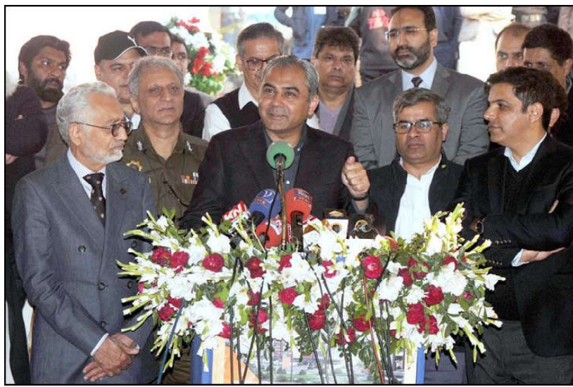
MULTAN: Caretaker CM Punjab Mohsin Naqvi talking to media persons during his visit to Nishtar Hospital 02.

because many health problems are caused by consuming contaminated water. He said that public private partnership is a successful model. Governor Punjab further said that youth are the most valuable asset of the country. He said that along with formal education, the aspect of moral education is also important. Governor Punjab said that as Chancellor, he has given instructions to the Vice Chancellors to give special attention to the character building of the youth.