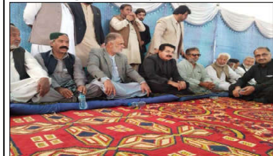
CHAGAI: Chairman Senate Muhammad Sadiq Sanjrani meeting with tribal elites in connection with election campaign at Sanjrani House

ISLAMABAD (APP): Pakistan and Maldives on Thursday agreed to strengthen bilateral relations and explore avenues for enhanced cooperation, particularly focusing on trade and environmental initiatives. The bilateral relations were discussed during a telephone conversation between Prime Minister Anwaar-ul-Haq Kakar and President of Maldives Dr Mohamed Muizzu. "The purpose of the telephone call was to follow up on the discussions during their meeting held on December 02, 2023, on the sidelines of the 28th Session of the Conference of the Parties to the United Nations Framework Convention on Climate Change (COP28) in Abu Dhabi," a Prime Minister Office news release said.