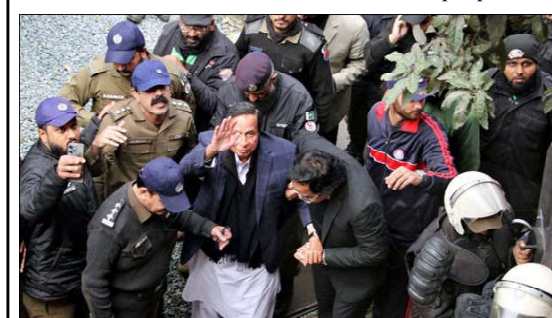
LAHORE: Former Chief Minister Punjab and Tehreek-e-Insaf (PTI) President, Chaudhry Parvez Elahi arriving for case hearing, at District Court.