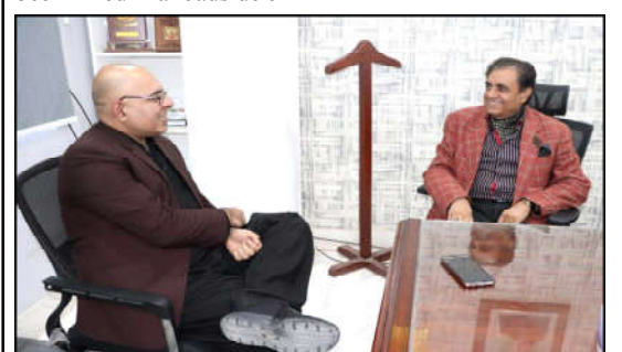
QUETTA: Caretaker Information Minister Jan Achakzai meeting with Caretaker Health Minister Dr. Amir Muhammad Khan Jogezeai

In Hub, the deputy commissioner ordered political parties to restrict their political activities, rallies, and corner meetings amid the deteriorating security situation in the district.