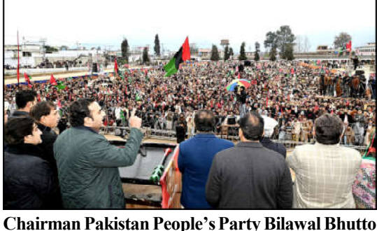
Zardari is addressing the election rally of Pakistan People's Party in Malakand district.

for election could have been given had the appeal been filed in time. We donot want to give such decision which ballot papers has been recauses delay in the election. duced to meet the need of Justice Jamal quespaper