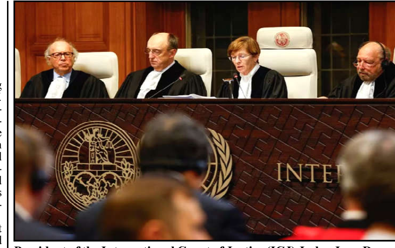
President of the International Court of Justice (ICJ) Judge Joan Donoghue speaks during a hearing in a case whereby Ukraine accused Russia of violating an anti-terrorism treaty by funding pro-Russian forces, including militias who shot down the Malaysia Airlines flight MH17, and discrimination, in The Hague, Netherlands US says fentanyl

Today, "the pur-chase is stuck in the US Congress because of anger over the brazen attempt to assassinate Pannun. US representatives have frozen the legmovement Indian acquisitions, in-cluding a proposal to with the sale," the Wire quoted a highly-placed source in Washington as