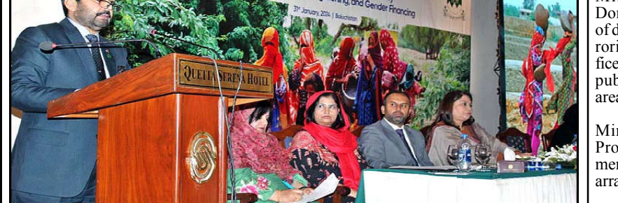
QUETTA: Balochistan Caretaker Minister for Home and Tribal Affairs Mir Muhammad Zubair Jamali addressing a consultation on gender issue organized by National Commission on the Status of Women.

try can progress until nection with indictment of provision of justice is encases on February 6.