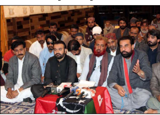
QUETTA: Peoples Party (PPP) Leader, Ali Madad Jattak addresses to media persons during press conference, in Quetta.