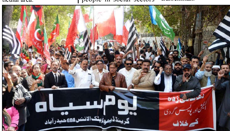
HYDERABAD: Workers of GDA, PTL, JUI(F), JI and Awami Tehreek hold a protest rally against alleged rigging in general election 2024 and observe Black Day against torture and arrest of the workers of Sindhyani Tehreek and JUI (F) during a rally in Karachi.

The Indian opposition, particularly the Congress, has raised doubts about the Balakot surgical strikes proclaimed by the BJP government. Rahul Gandhi and Navjot Singh Sidhu demanded validation and an accurate count of the casualties resulting from the strike.