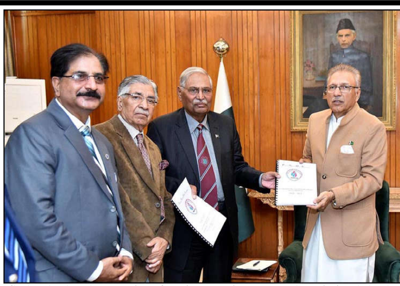
ISLAMABAD: A delegation of Pakistan National Heart Association (PANAH) presenting a report on the activities and accomplishments of PANAH to President Dr. Arif Alvi, at Aiwan-e-Sadr.

He added that lasting peace could only be established by promoting tolerance and harmony among each others.