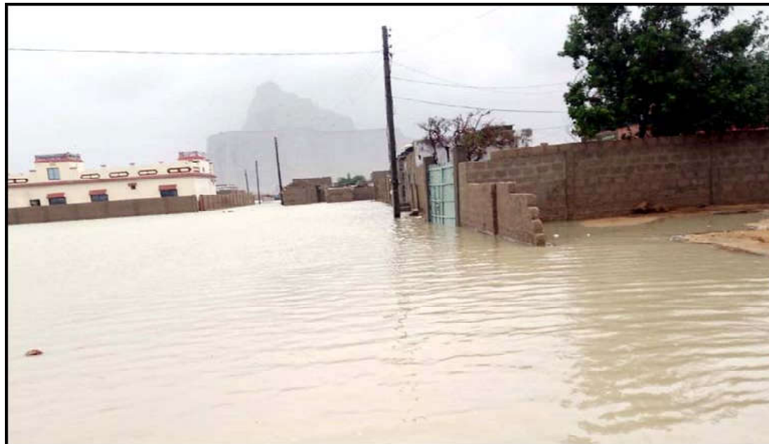
GWADAR: View of stagnant rain water after flash flood caused by heavy downpour of winter season, in Gwadar.

The training which encompassed conventional as well as sub-conventional operations, culminated with field manoeuvre & battle inoculation exercise, employing air and ground forces.