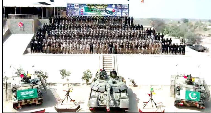
On job training of Royal Saudi Land Forces with Pakistan Army concludes in Multan.

He urged everyone to exercise their power in their respective constitutional domain and underlined the need for respecting each other despite political differences, as this is the only way forward to steer the country out of crises.