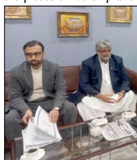
QUETTA: Renowned cricketer Shahid Afridi meeting with Caretaker Chief Minister Balochistan Mir Ali Mardan Khan Domki at Quetta airport.

not arenas for political expression or displays of nationalism.