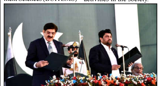
KARACHI: Governor Sindh, Kamran Khan Tessori administering the oath to the Newly-elected Chief Minister Sindh, Syed Murad Ali Shah.

He also said that it is very necessary to promote sports and other healthy activities in the society.