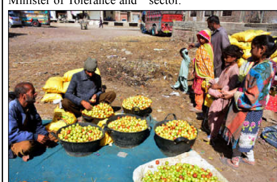
HYDERABAD: Children purchasing jujube from vendor at fruits market.

Being one of the pioneers, the UAE will provide technological support to Pakistan to increase date palm cultivation as Pakistan's rich topography presents immense potential in this sector.