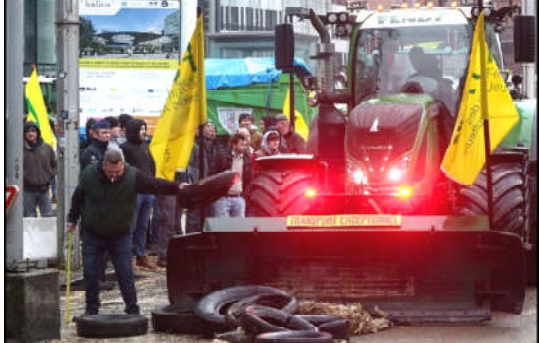
A man holds a fire during a protest of European farmers over price pressures, taxes and green regulation, on the day of an EU Agriculture Ministers meeting in Brussels, Belgium.

lice headquarters in Brasilia. "No one attempted a coup in Brazil. That is the great truth," Bolsonaro told radio station CBN Recife. A week after Lula took office on Jan 1, 2023, thousands of Bolsonaro supporters stormed the presidential palace, Congress and Supreme Court, urging the military to intervene to overturn what they called a stolen election. Bolsonaro, who was in the United States at the time, denies responsibility, and has even suggested the protesters were not really his supporters. However, investigators allege months of anti-democratic maneuvers by Bolsonaro, from a plan to discredit Brazil's electronic voting system with a "disinformation" campaign ahead of the elections to "legitimise a military intervention" if he lost.