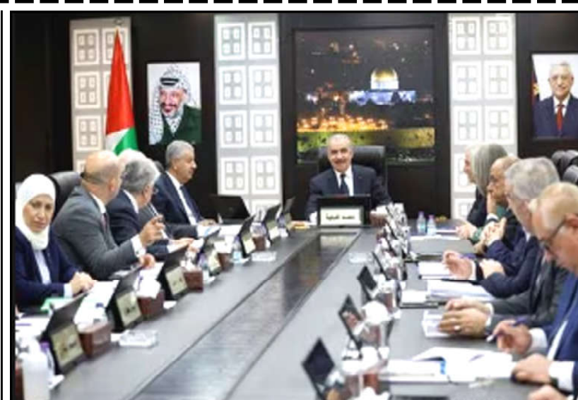
Palestinian Prime Minister Mohammad Shtayyeh convenes a cabinet meeting in Ramallah, West Bank

Mr Sullivan said "there will have to be indirect discussions by Qatar and Egypt with Hamas because ultimately they will have to agree to release the hostages". His comments follow an Israeli official's statement to CNN that Tel Aviv will send a delegation to Qatar to continue talks on the release of prisoners and a pause in military operations in Gaza. Axios, a US media outlet, mentioned that the delegation would have a "limited mandate" and that the talks would be "technical". Responding to a question about Israeli premier's post-war Gaza plan, Mr Sullivan expressed concerns, saying, "From what I've seen in the reporting, I have some concerns." On Thursday, Mr Netanyahu presented a document to his cabinet, seeking open-ended control over security and civilian affairs in the Gaza Strip.