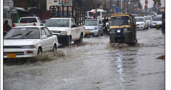
QUETTA: Vehicles passing through accumulated rain water after rain in Provincial capital.