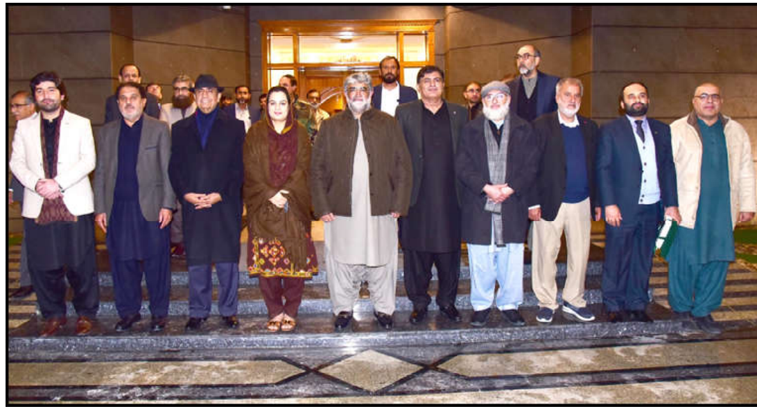
QUETTA: Caretaker Chief Minister Balochistan Mir Ali Mardan Khan Domki in a group photo with Caretaker Provincial Cabinet