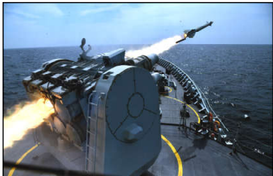
Pak Navy demonstrates successful shooting down of aerial target by Surface to Air Missile.