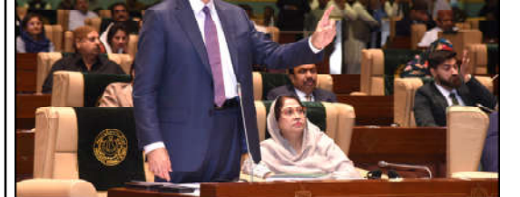
KARACHI: Syed Murad Ali Shah Speaker on the Assembly floor after being elected as Chief Minister of Sindh.

The Coordinator EOC informed that more than 11,000 teams have been taking part in the immunization campaign, which would remain continued till March 2, 2024. This time, the children are also being administered the Vitamin "A" drops in order to increase their immunity against the crippling disease, it was further informed while briefing the Governor.