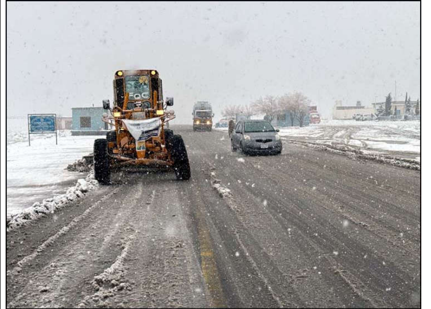
QUETTA: Heavy machinery busy in removing snow from road during the heavy snowfall of winter season, which more decreases the temperature below in minus degree Celsius, at Lakhpass area of Balochistan.

ation Agency (FIA) in Gujranwala taking action against human traffickers, had arrested 814 people, including 93 of those who were suspects in the tragedy. The human traffickers first used the border routes of Afghanistan, Iran and Turkey for their illicit trade. From those countries, they made their victims to get to Turkey and onwards to Greece. Youths aspiring to migrate to Europe were enticed by traffickers who collected between Rs 2.5 to Rs 3 million per person. The traffickers told the youths that they would take them first to Libya by air from where they would travel to Italy by boat.