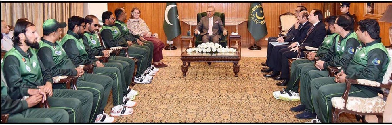
ISLAMABAD: Pakistan Blind Cricket team called on the President Dr. Arif Alvi at Aiwan-e-Sadr.