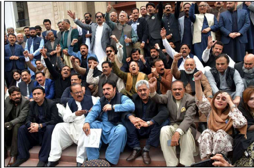
LAHORE: Opposition leaders in Punjab Assembly are chanting slogans as they are holding protest demonstration against alleged rigging in General Election 2024, at Punjab Assembly in Lahore.

gas under Article 158 of the Constitution. Similarly, industrial zones were established in various districts for industrial development in the province, he said and claimed that an investment of RS 50 billion was expected from these industrial zones besides generating employment opportunities for 70,000 people in the province. The CM said that the establishment of two medical colleges in the province was approved while an agreement was signed with Google to train 20,000 KP youth at its own expense. Similarly, an agreement with the British Council was in the final stages to provide scholarships to 10,000 students.