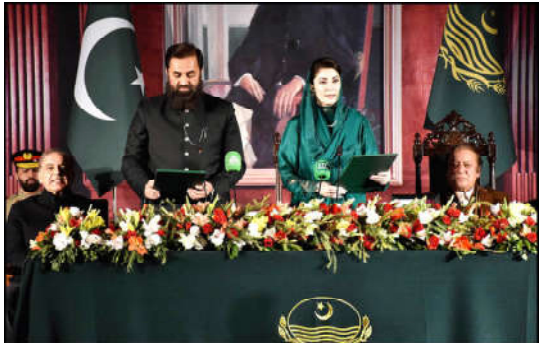
LAHORE: Governor Punjab Baligh Ur Rehman administering the oath to the Newly-elected Chief Minister Punjab Maryam Nawaz at Governor House.

The caretaker Minister for Information was addressing press conference at the Civil Secretariat on Monday.