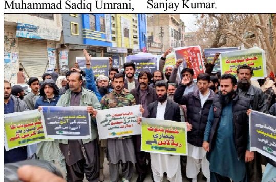
QUETTA: Activists of Markazi Muslim League holding protest demonstration for acceptance of their demands, at Quetta press club