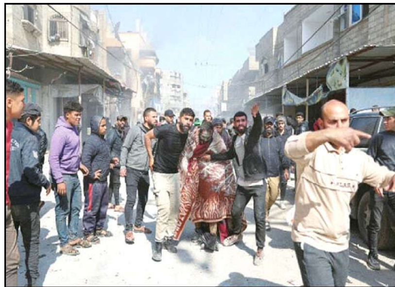
Palestinians help an injured man at the site of a strike on a house in Rafah.

camp, tempers are rising and on Friday dozens of people held an impromptu protest. "We didn't die from air strikes but we are dying from hunger," said a sign held by one child. In the camp, bedraggled children waited expectantly, holding plastic containers and battered cooking pots for what little food is available. Residents have taken to eating scavenged scraps of rotten corn, animal fodder unfit for human consumption and even leaves. Gaza's health ministry said a two-month-old baby identified as Mahmud Fathu had died of "malnutrition". "The risk of famine is projected to increase as long as the government of Israel continues to impede the entry of aid into Gaza," as well as access to water.