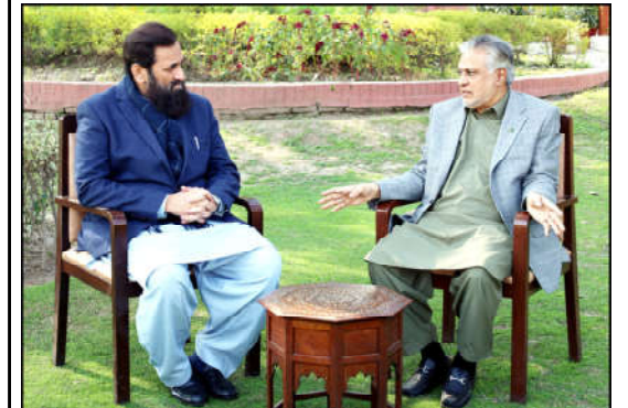
LAHORE: Governor Punjab Muhammad Balighur Rehman meeting with leader of the house in Senate Ishaq Dar.

He announced to hold protest demonstrations and take out rallies all over the province as a mark of protest against alleged rigging in the elections.