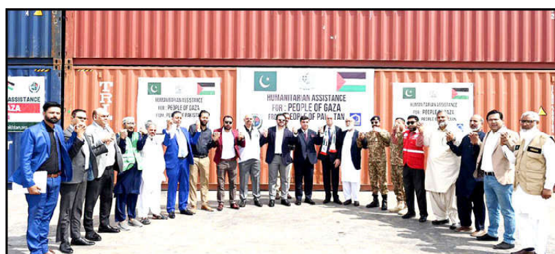
ISLAMABAD: 7th consignment of relief goods being dispatched for the people of Gaza from Government of Pakistan.

He urged the nation to work together and forge unity to address the numerous challenges including poverty, malnutrition, stunting and maternal and neonatal deaths.