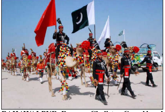
BAHAWALPUR: Rangers Cholistan Camel band presenting their skills at a ceremony held in connection with 19th TDCP Cholistan Desert Rally 2024 at Cholistan desert Jeep Rally.