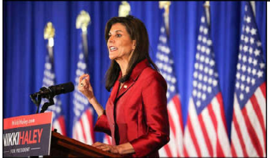
Republican presidential candidate and former US Ambassador to the United Nations Nikki Haley speaks on stage at her watch party during the South Carolina Republican presidential primary election in Charleston, South Carolina.

head to the city of Ballarat, 95 km (60 miles) west of the state capital, Melbourne. Australia is in the grips of an El Nino weather pattern, which is typically associated with extreme phenomena such as wildfires, cyclones and droughts. More than 15 bushfires were burning in Victoria on Sunday, with the most serious blaze, ranked at the second highest danger rating, near several remote towns, according to the state's emergency authority. State authorities have said there are concerns about the weather this week particularly Wednesday into Thursday when extreme heat is forecast that could further fan the fires.