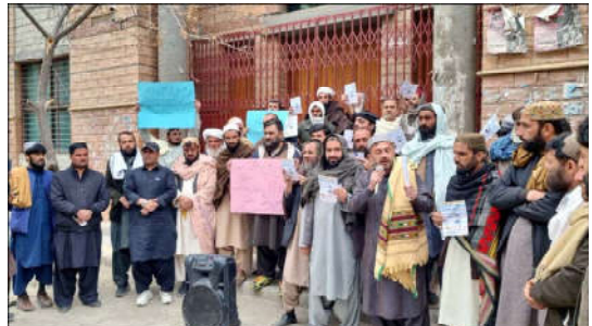
QUETTA: Residents of Pashtunabad are holding protest demonstration against prolong sui-gas load shedding in their area, held at Quetta press club.

mercialization. He proposed that the government should either provide subsidies or support cinema houses to make movie tickets more affordable for the general public. Dr. Shah underscored the untapped potential within the film industry, emphasizing that with government attention and patronage, the industry could flourish. Aysha Umar, the producer and leading actress of the film, expressed optimism about the success of 'Texali Gate,' describing it as a portrayal of the harsh realities.