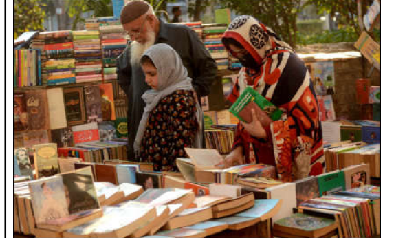
LAHORE: People selecting and purchasing old books from a roadside setup at Mall Road.

the people of province, ensuring law and order, restoration of health cards and to improve the education system of KP. He said the PTI founder picked a team that won the world cup [in 1992] and he would adopt same passion to elect the provincial cabinet. The PTI's candidate for KPC's slot said that 55 percent of the newly-elected members of his party were those who won for the first time. The recent elections have exposed the turncoats and separated them from those who were loyal to the party, he added.