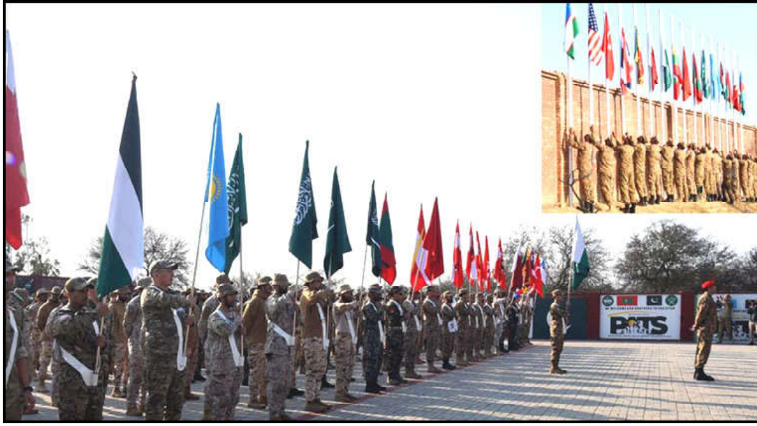
7th International Pakistan Army Team Spirit Exercise-2024 opened at the National Counter Terrorism Centre at Pabbi.

Ph: 2841470/2841473 Vol: XIX No. 255, Shaban 15, 1445 AH Monday February 26, 2024, Pages 04, Price Rs.15