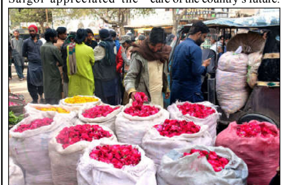
HYDERABAD: A vendor displaying the rose flowers to attract the customers in connection with shab-e-barat at flowers market.

work and passion of the organizers of Defense Welfare Society who are providing technical education to students in this era of inflation, which is valuable and praiseworthy.