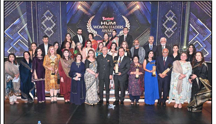
ISLAMABAD: President Arif Alvi, in a group photograph, with the organizers & recipients of the awards at the 5th edition of HUM Women Leaders Awards-2024 ceremony held at the Jinnah Convention Center.

We will move forward together and solve the problems faced by the country."