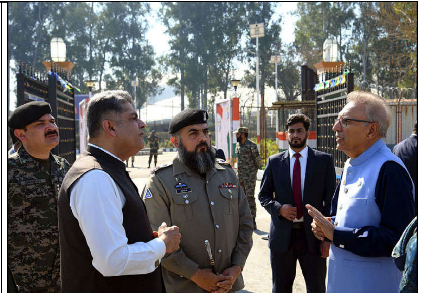
NAROWAL: President Dr. Arif Alvi being briefed about Kartarpur Corridor at Zero Line/International Border.

Independent Report QUETTA: The Quetta Majlis Fikr-o-Danish (think tank) has outlined the need to form an empowered and trustworthy Provincial Higher Education Commission (HEC) for complete overhauling and cleansing of the public sector universities in the province. In a statement issued here on Friday, it was regretfully pointed out that the deteriorated situation of the public sector universities and higher institutions of the research has turned more serious due to the negligence and carelessness of the previous governments. As a result of which, the materialization of dream of creation of useful and constructive environment is seen nearly impossible. Due to the situation, the mother educational institution of the province i.e., University of Balochistan is heading towards closure while the overall situation of higher technical educational institution i.e., Balochistan University of Information Technology, Engineering and Management Sciences (BUTEMS) has also become worst. While on the other hand, the only women university (SBKWU) has also become hub of male interference and political and wisdom weakness. It was also stated that there's a question of survival of the institutions in case of the non-payment of salaries of the employees. It was stressed that there is also dire need to stop wastage and plundering of the resources for building scientific narrative besides promoting research and creativity.