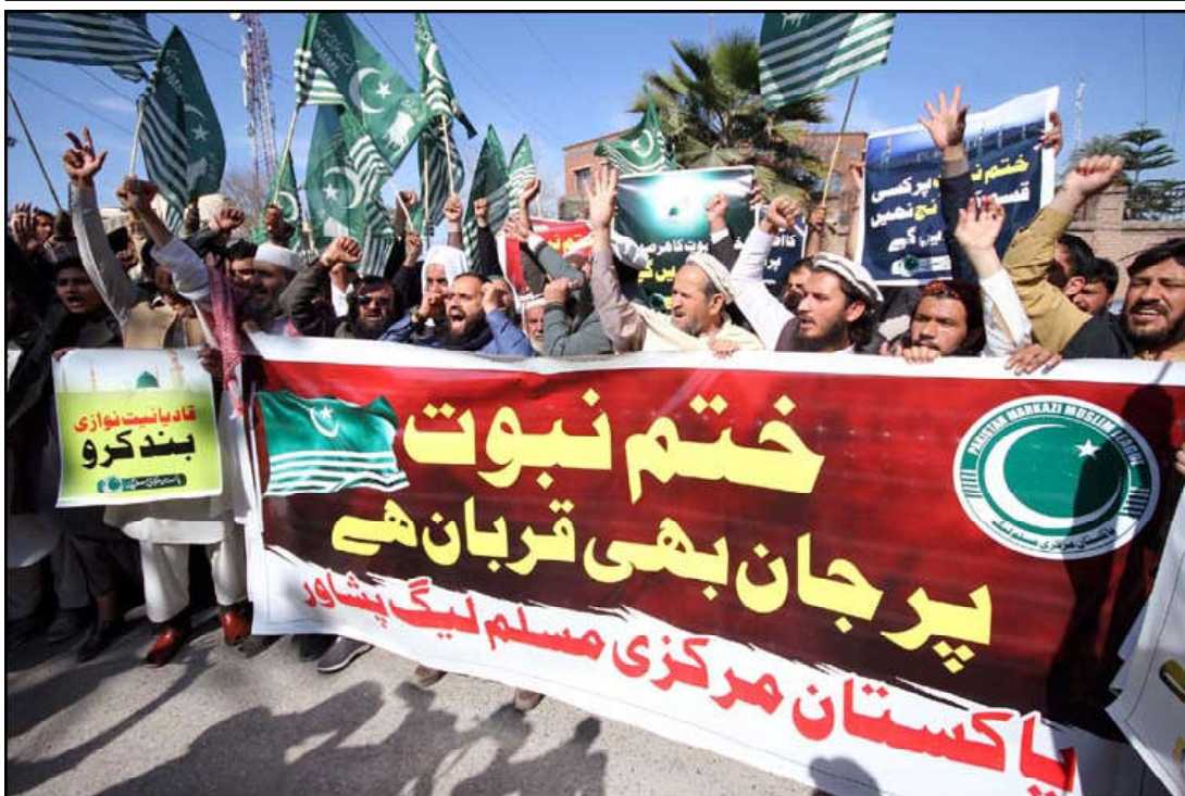
PESHAWAR: Activists of Markazi Muslim League (PMML) are holding protest demonstration against supreme court ruling, at Peshawar press club.