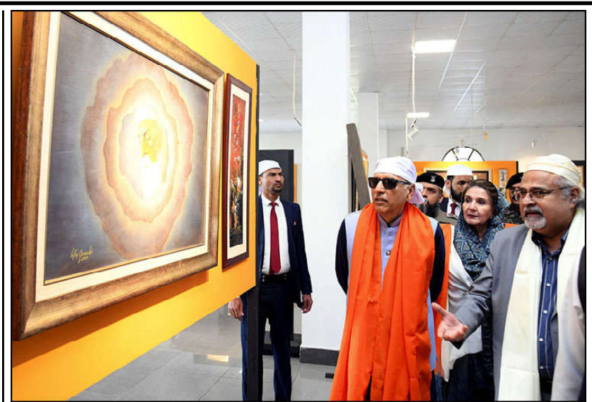
NAROWAL: President Dr Arif Alvi visiting different sections of the Kartarpur Corridor.