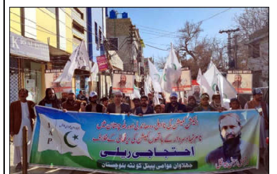
QUETTA: Members of Jhalawan Awami Penal (JAP) are holding protest demonstration against alleged rigging in General Election 2024, at Quetta press club.