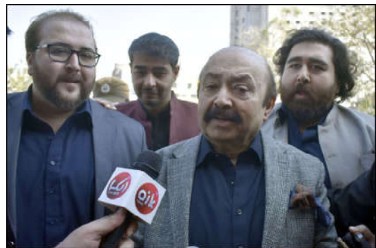
LAHORE: Speaker Punjab Assembly Sardar Muhammad Sibtain Khan talking with media persons during first session of Punjab Assembly in the Provincial Capital.