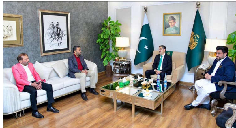
ISLAMABAD: Governor Sindh Kamran Khan Tessori meeting with Caretaker Prime Minister Anwaar-ul-Haq Kakar, MQM leaders Dr. Farooq Sattar and Mustafa Kamal were also present in the meeting.

The religious freedom of every Pakistani, including non-Muslims, is enshrined in the Constitution of the Islamic Republic of Pakistan. Similarly, the rights of non-Muslim Pakistanis are safeguarded in the constitution. It is essential to ensure the protection of their rights as well. Praising the efforts of law enforcement agencies for ensuring peaceful elections nationwide, he called upon YouTubers and social media activists to refrain from causing disturbances, emphasizing that Pakistani Muslims unanimously uphold the sanctity of the finality of the Holy Prophet. In every city, hundreds of Huffaz are present, demonstrating their love for their country.