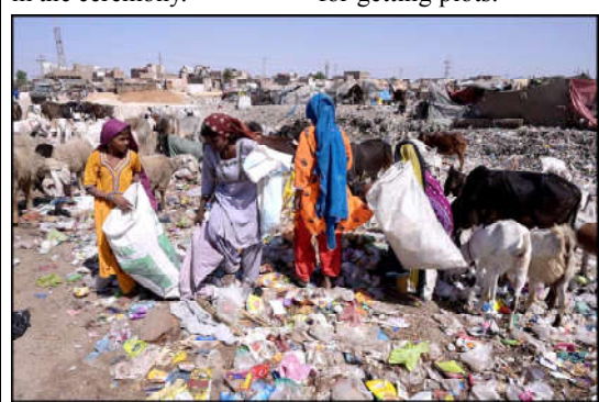
HYDERABAD: Gypsy women searching for the valuable items from heap of garbage at Latifabad area.