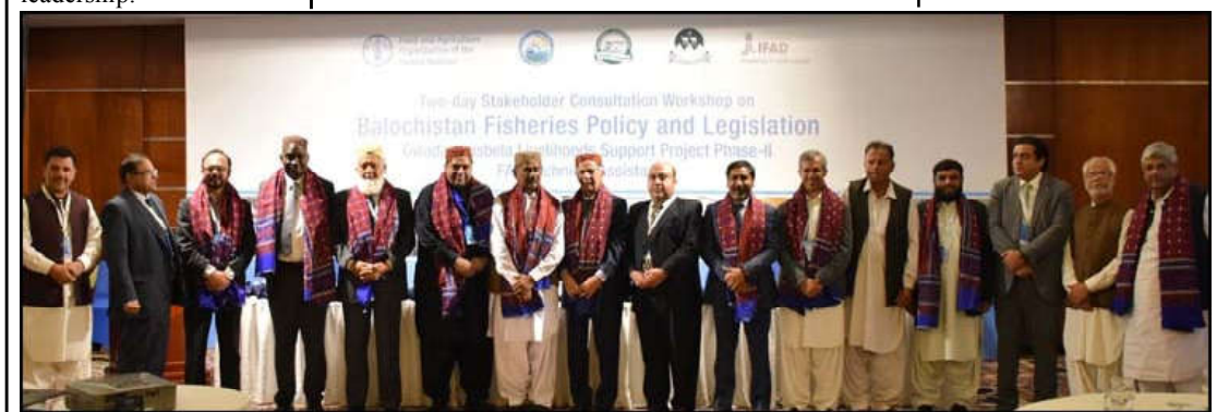
QUETTA: A group photo of participants of two-day Stakeholder Consultation Workshop on Balochistan Fisheries Policy and Legislation organized by FAO.

reportedly linked to their intentions to contest for Chairman and General Secretary positions in the upcoming PTI intra-party elections. PTI has officially announced its intra-party election schedule, with polling set for March 3rd. The nomination process will commence on February 23rd and 24th, with submissions accepted both physically and digitally through email. Scrutiny of nominations will occur on February 25th, followed by decisions on the same by February 27th.