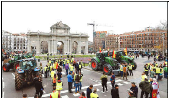
Farmers riding tractors arrive in front of Madrid's Puerta de Alcalá square during a protest against the European Union's agricultural policy.