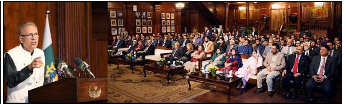
LAHORE: President Dr. Arif Alvi addressing the recognition ceremony of officers of the Federal Insurance Ombudsman and representatives of insurance companies, at Governor House.