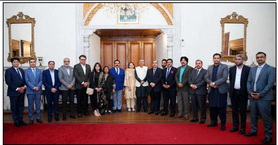
LAHORE: President Dr. Arif Alvi in a group photo with a delegation of the Lahore Chamber of Commerce and Industry, who called on him, at Governor House.