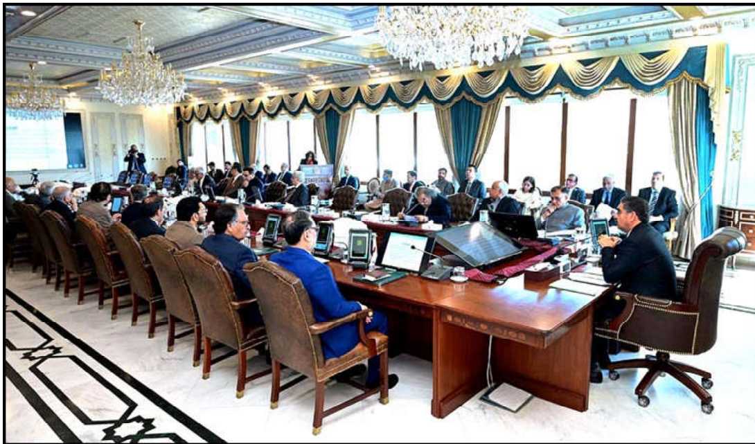
ISLAMABAD: Caretaker Prime Minister Anwaar-ul-Haq Kakar chairs a meeting of the Caretaker Federal Cabinet.

Ph: 2841470/2841473 Vol: XIX No. 253, Shaban 12, 1445 AH Friday February 23, 2024, Pages 04, Price Rs.15