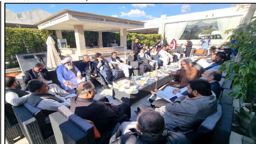
QUETTA: Nawab Sanaullah Zehri, Jaffar Khan Mandokhail, Jam Kamal Khan and others are participating in the important meeting of Pakistan Peoples Party and Pakistan Muslim League (PML-N) regarding government formation in Balochistan, in Quetta.

tions, their assistance or loans to a nation were contingent upon the presence of "good governance". According to Barrister Zafar, a fundamental tenet of these charters was the requirement for democratic governance. "These institutions are not meant to operate within nations without a democratic system in place. And the basic pillar of democracy is free and fair elections." Unfortunately, the recent election was marred by allegations of manipulation, the PTI senator stated, adding, "The entire world saw how the public mandate was stolen."