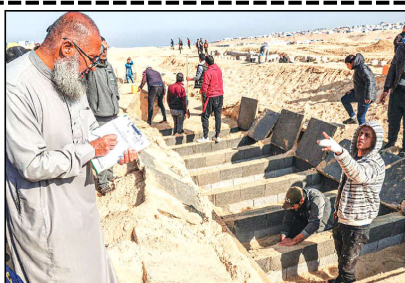
GAZASTRIP: A man records the names of the deceased during the funeral of Palestinians killed in overnight Israeli strikes at a cemetery in Rafah.

in Ukraine, the death of Russian opposition leader Alexei Navalny and U.S. assertions that Russia plans to put a nuclear weapon in space have led to the biggest crisis in relations between Russia and the West since the Cold War. Some Russian and U.S. diplomats say they do not remember a time when relations between the world's two biggest nuclear powers were worse, including during the 1962 Cuban Missile Crisis. Biden said last week after prison officers announced Navalny's death in a Russian penal colony that it was "a consequence of something that Putin and his thugs did." Navalny had previously accused Putin of trying to kill him, an allegation the Kremlin denied.