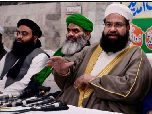
ISLAMABAD: Chairman Pakistan Ulama Council & Special Assistant for interfaith Harmony, Hafiz Tahir Mahmood Ashrafi addressing a Press conference during the Misaq-e-Pakistan Convention.