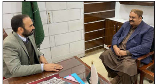
QUETTA: Syed Asif Ali Shah meeting with caretaker Home Minister Mir Muhammad Zubair Jamali.

It may be mentioned here that the theme for International Mother Language Day 2024 is "Multilingual education is a pillar of intergenerational learning."