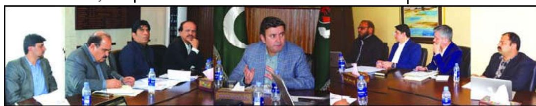
QUETTA: Balochistan Chief Secretary Shakeel Qadir Khan presiding over a meeting.

It was further said in the petition government is removing the section of fixing prices of medicines from drug act. Care taker government does not have these powers. Democratic government is coming and this step can be taken only by it. The petitioner requested the present notification runs contrary to law and constitution.