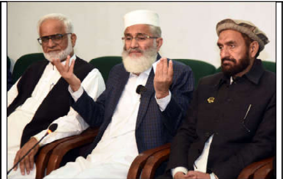
ISLAMABAD: Feb 21- Leader of Jamaat-e-Islami Siraj-ul-Haq addressing press conference at Al-Falah Hall sector F-8, in the Federal Capital.