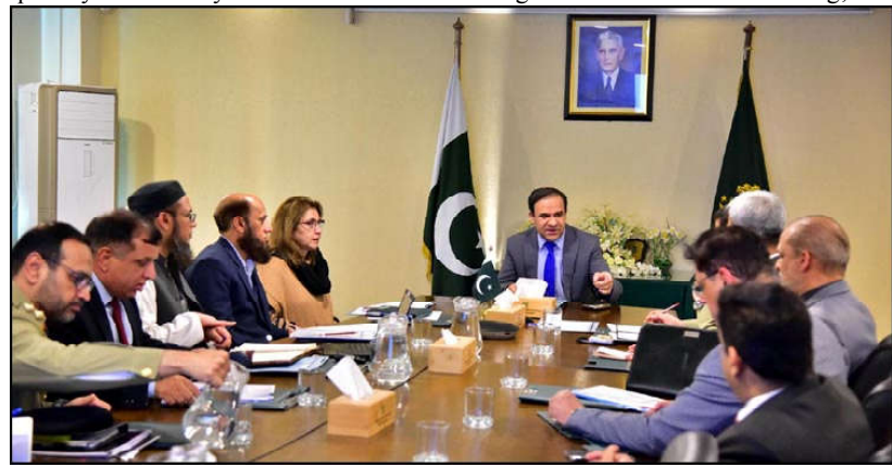
Caretaker Federal Minister for IT and Telecommunication, Dr. Umar Saif chairing meeting regarding Spectrum Availability in Islamabad.