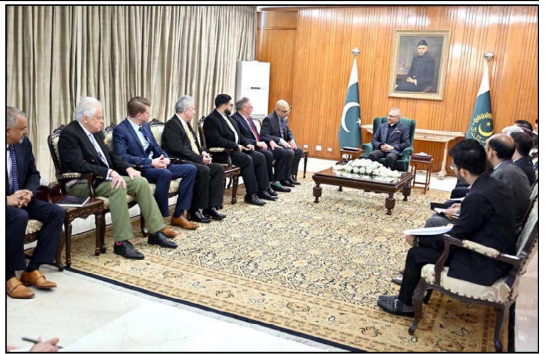
ISLAMABAD: A delegation of Miracle Saltworks Collective Inc, a USA-based salt mining and processing company, called on President Dr Arif Alvi, at Aiwan-e-Sadr.

president was briefed about the company's performance in salt mining, processing and marketing. President Alvi said that Pakistan could make value addition to its salt products through better processing, packaging and marketing. Reaffirming the government's commitment to facilitate the investors, he appreciated Miracle Saltworks Collective Inc for its investment in Pakistan as well as its joint venture agreement with Pakistan Mineral Development Corporation. The delegation members apprised the president of the potential of Pakistan's salt mines to earn foreign exchange, adding that Pakistan.