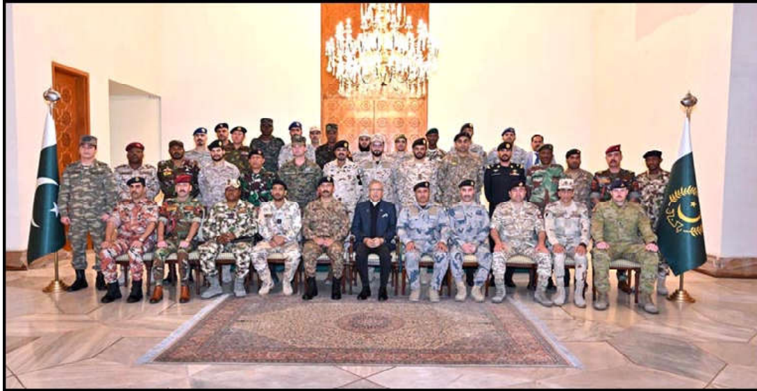
ISLAMABAD: President Dr Arif Alvi in a group photo with a delegation of military officers from friendly countries undergoing training at Command and Staff College Quetta, at Aiwan-e-Sadr.

Ph: 2841470/2841473 Vol: XIX No. 252, Shaban 11, 1445 AH Thursday February 22, 2024, Pages 04, Price Rs.15