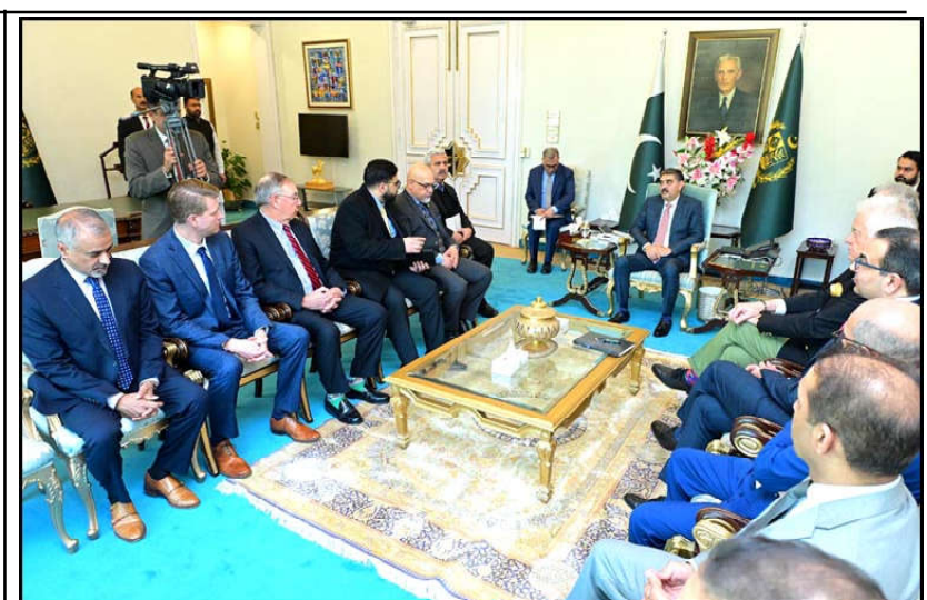
ISLAMABAD: A delegation of Miracle Salt Collective Inc called on Caretaker Prime Minister Anwaar-ul-Haq Kakar.

It was stated that the future course of action would be decided after conducting the Lawyers and All Parties conferences.