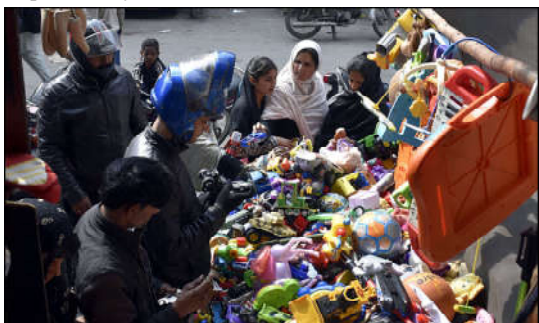
LAHORE: People are busy buying secondhand toys at a Landa bazaar in Provincial Capital.

He said, "We must focus on exporting highly skilled manpower to overcome this trade gap. The economy is facing multiple challenges and fundamental administrative changes are needed to resolve the issues. We are exporting unskilled and semiskilled workers which are sending $30bn remittances. The proposed ministry may be tasked with identifying the specific needs of each potential country and produce human resources in that particular area."