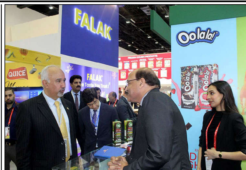
DUBAI: Ambassador, Faisal Niaz Tirmizi, Pakistan's Envoy to the UAE while talking to a Pakistani exhibitor during the Gulf Food Exhibition at Pakistan Pavilion, World Trade Centre.

A total of 261,799,826 shares valuing Rs 9,907 billion were traded during the day as compared to 314,247,768 shares valuing Rs12.243 billion the last day. Some 330 companies transacted their shares in the stock market; 170 of them recorded gains and 139 sustained losses, whereas the share prices of 21 remained unchanged. The three top trading companies were PIAC(A) with 21,406,500 shares at Rs 11.06 per share, WorldCall Telecom with 20,034,698 shares at Rs 1.23 per share, and Pak Refinery with 15,164,705 shares at Rs 25.33 per share. Rafhan Maize Products Company Limited witnessed a maximum increase of Rs 373.35 per share price.