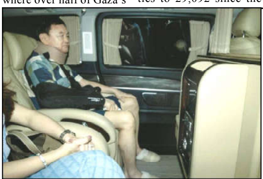
Former Thai Prime Minister Thaksin Shinawatra arrives at his family compound following his release.

Monitoring Desk 2.3 million people have sought refuge from fighting elsewhere. The United States, Israel's top ally, says it is still working with mediators Egypt and Qatar to try to broker another cease-fire and hostage release agreement. But those efforts appear to have stalled in recent days, and Netanyahu angered Qatar, which has hosted Hamas leaders, by calling on it to pressure the militant group. The Health Ministry said 107 bodies were brought to hospitals in the last 24 hours. That brings the total number of fatalities to 29,092 since the start of the war. The ministry does not distinguish between civilians and combatants in its records, but says around two-thirds of those killed were women and children. More than 69,000 Palestinians have been wounded, overwhelming the territory's hospitals, less than half of which are even partially functioning. The Health Ministry is part of the Hamas-run government in Gaza but maintains detailed records of casualties. Its figures from previous wars in Gaza have largely matched those of U.N. agencies, independent experts and even Israel's own tallies.