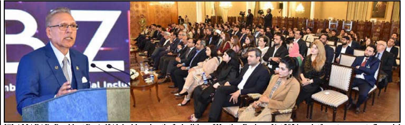
ISLAMABAD: President Dr. Arif Alvi addressing the 3rd edition of Hosting Business Net 2024, a platform to promote financial inclusion and digital transformation, at Aiwan-e-Sadr.