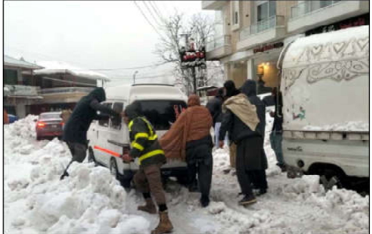
ABBOTTABAD: Rescue officials trying to remove a vehicle stuck in snow covered area after the heavy snowfall of winter season, which more decreases the temperature below in minus degree Celsius, at Nathiagali area in Abbottabad.

Vice Chancellors (VCs) of public and private universities besides parents and graduating students were in attendance.