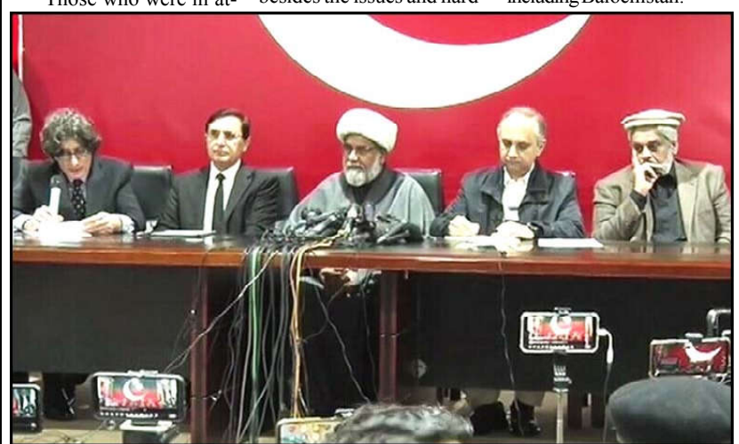
ISLAMABAD: Leaders of Pakistan Tehreek-e-Insaf (PTI) and Sunni Ittehad Council (SIC) addressing a Press conference

ships being faced by it. The CEO of Health Card Programme briefed in detail the meeting about the three months performance after its launch besides the challenges being faced in smooth implementation of the programme. Expressing his views on the occasion, the caretaker Chief Minister said that Health Card Programme is such a historic programme of the province's history under which every poor and rich person has the quality healthcare and treatment facilities at some 1200 hospitals located in all over the country including Balochistan.