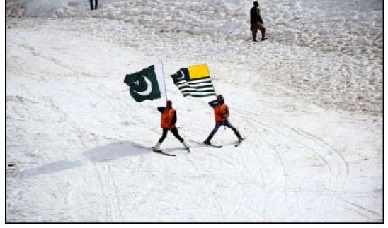
BAGH: Skiers take part in the Ganga Choti Winter Sports Festival near Bagh, Azad Jammu and Kashmir (AJK).