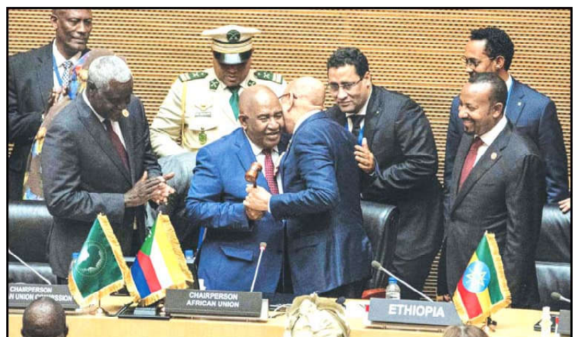
ADDIS ABABA: Outgoing chairperson of the African Union (AU) and President of Comoros, Azali Assoumani, congratulates the newly elected AU chairperson, President of Mauritania Mohamed Ould Ghazouani. Also seen are Ethiopian Prime Minister Abiy Ahmed and Moussa Faki, Chairperson of the African Union Commission.

with a gun stood in front of us and denied us access to this facility," he said after later attending the summit. Ethiopia insisted Mohamud was warmly welcomed and that the Somali delegation was blocked when its security detail tried to enter a venue with weapons. Mogadishu has accused Addis Ababa of violating its sovereignty over a January maritime deal with Somaliland, which declared independence in 1991 in a move not recognised by the international community. Under the memorandum of understanding, Somaliland agreed to lease 20 kilometres (12 miles) of its coast for 50 years to landlocked Ethiopia, which wants to set up a naval base and a commercial port on the coast.