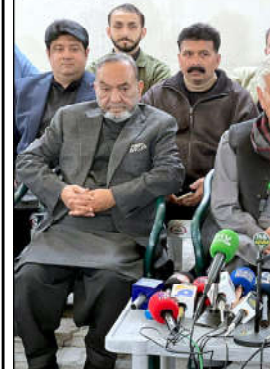
SIALKOT: Former Minister Defence Khawaja Asif, addressing media persons at his residence at cantt.

He advised that the political community should go beyond their personal interests and sacrifice for the country and the nation. He said that for political stability in the country, they should shun party politics and play a constructive role even if they sit in the opposition. In response to a question, he said that there was no estrangement from Maulana Fazlur Rehman.