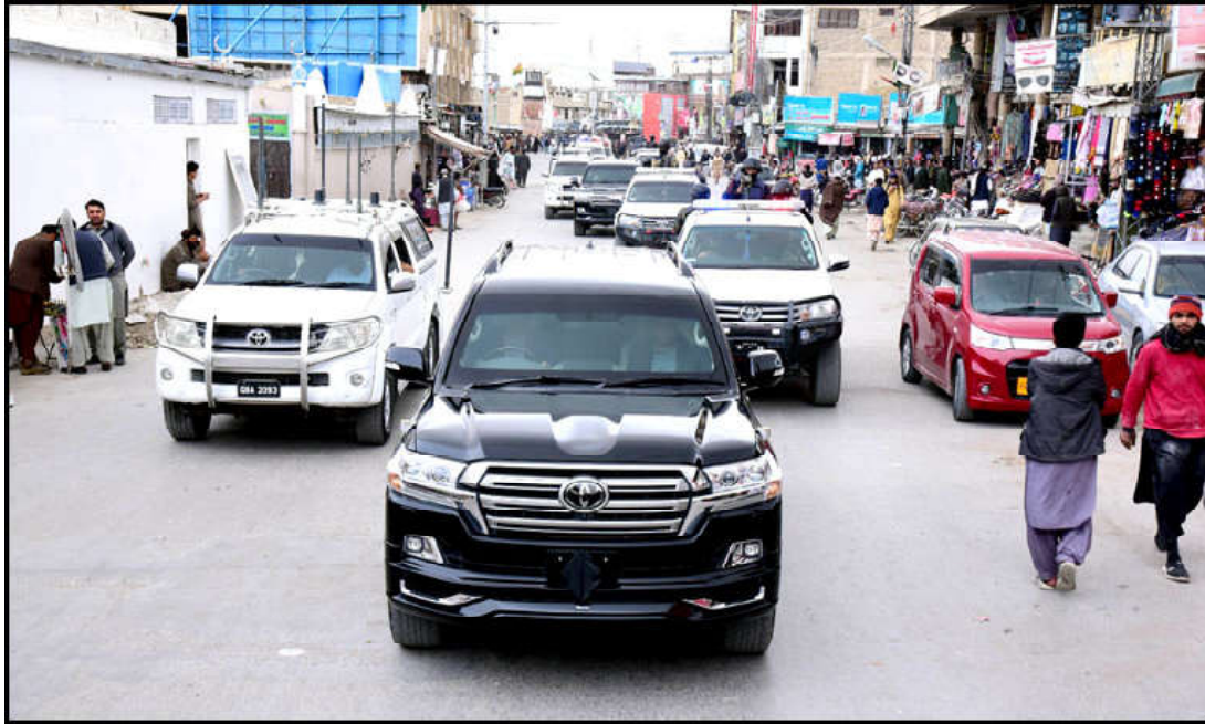
QUETTA: Caretaker Chief Minister Balochistan Mir Ali Mardan Khan Domki visiting different roads and shopping centers of Quetta city

Ph: 2841470/2841473 Vol: XIX No. 249, Shaban 08, 1445 AH Monday February 19, 2024, Pages 04, Price Rs.15