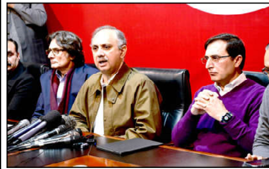
ISLAMABAD: PTI leader Umar Ayub addresses press conference.

The bodies were extracted from the well and shifted to the nearby Bolan Medical Complex Hospital.