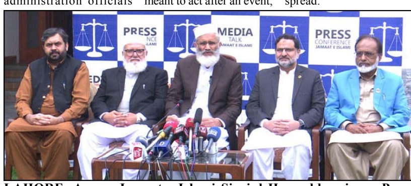
LAHORE: Ameer Jamaat-e-Islami Sirajul Haq addressing a Press conference.

tor Mushahid Hussain also delivered a lecture at the Russian Diplomatic Academy, the first prominent Pakistani to be invited to address the Diplomatic Academy in 50 years. The topic of the talk was 'Pakistan and the changing regional scenario'. Senator Hussain during his talk also highlighted the fact that there's 'no fundamental conflict of interest' between Pakistan and Russia', therefore, 'Pakistan has remained neutral on Ukraine, abstaining on voting in the United Nations on this issue'. He welcomed growing relations between Pakistan and Russia especially in the field of energy, connectivity, education, regional security including Afghanistan and cooperation at multilateral fora including SCO and UN.