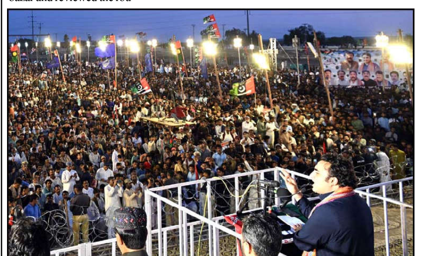
THATTA: Peoples Party (PPP) Chairman, Bilawal Bhutto Zardari addresses to his supporters during the public gathering meeting held in Thatta.