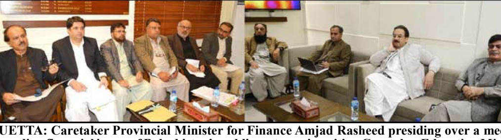
QUETTA: Caretaker Provincial Minister for Finance Amjad Rasheed presiding over a meeting regarding financial issues of Balochistan's public sector universities. Caretaker Education Minister Dr. Qadir Bakhsh and other officials are also present.