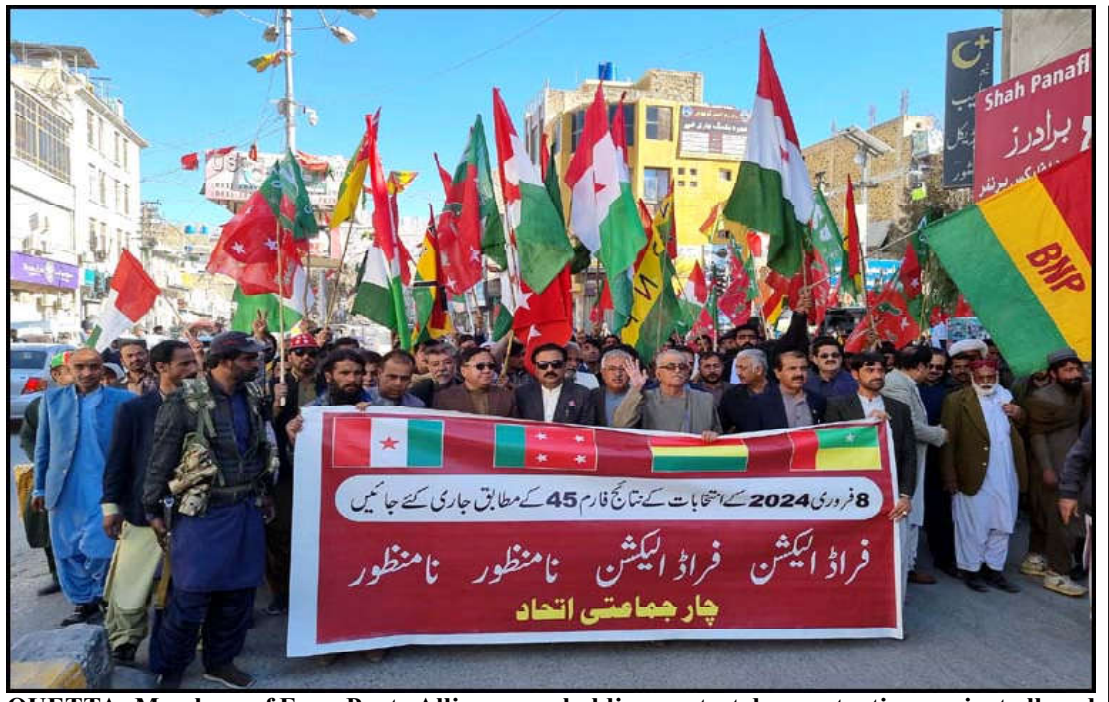
QUETTA: Members of Four-Party Alliance are holding protest demonstration against alleged rigging in General Election 2024, outside DC Office in Quetta.

Ph: 2841470/2841473 Vol: XIX No. 247, Shaban 05, 1445 AH Friday February 16, 2024, Pages 04, Price Rs. 15