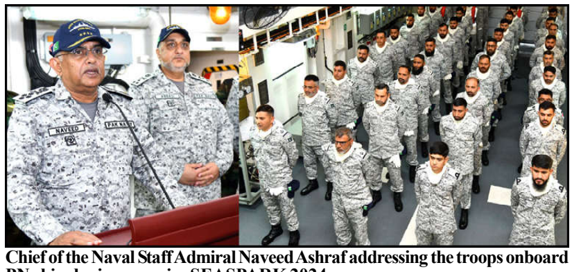
PN ship during exercise SEASPARK 2024

coordination committees of the PML-N and PPP, said, "There has been progress in matters regarding government formation, while the third meeting of the coordination committees will be held on Fri-