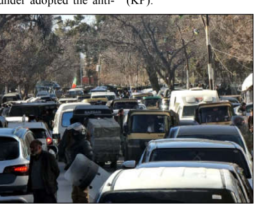
traffic jam due to negligence of traffic police staffs and illegal parking, in Quetta.