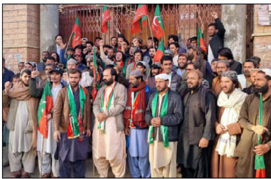
QUETTA: Activists of Tehreek-e-Insaf (PTI) are holding protest demonstration against alleged rigging in Election 2024, at Quetta press club.

ISLAMABAD (APP): The quality of service delivery across the health system. He said that the government also promoted a culture of research in the healthcare sector, adding that Pakistan needs more efforts towards providing high-quality, cost-effective healthcare. The government is committed to transforming the country's entire healthcare landscape, he said, adding that ultimate goal of the government was to use digital technology for harmonization and integration of health-related to improve the health status and well-being of our people. Replied to a question, he said that the public was the asset of a country and considering that the caretaker government was investing in human capital. Talking to a Private news channel, the minister said that the government was introducing health reforms to cover essential primary healthcare services and secondary-level hospital care. He said all possible resources were being utilized for lessening the economic burden and raising the living standard of deprived segments of society. He underlined that the remarkable initiative of the government will tangibly reduce the burden on hospitals and thus will improve