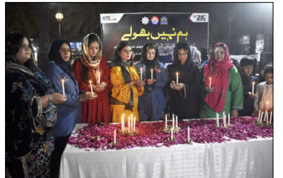
LAHORE: Women police and members of civil society lit candles during candle light vigil to pay tribute to the martyrs of police officers at Faisal Chowk, in the Provincial Capital.

appear in the court. One day exemption plea from attendance was filed on his behalf. The court accepted the plea. The court while summoning the arguments on the petition of permanent exemption of Hamza Shehbaz from attendance adjourned the hearing till March 12. Shehbaz Sharif and Hamza Shehbaz are charged with constructing nullah from national kitty. NAB Lahore has filed reference in AC Lahore.