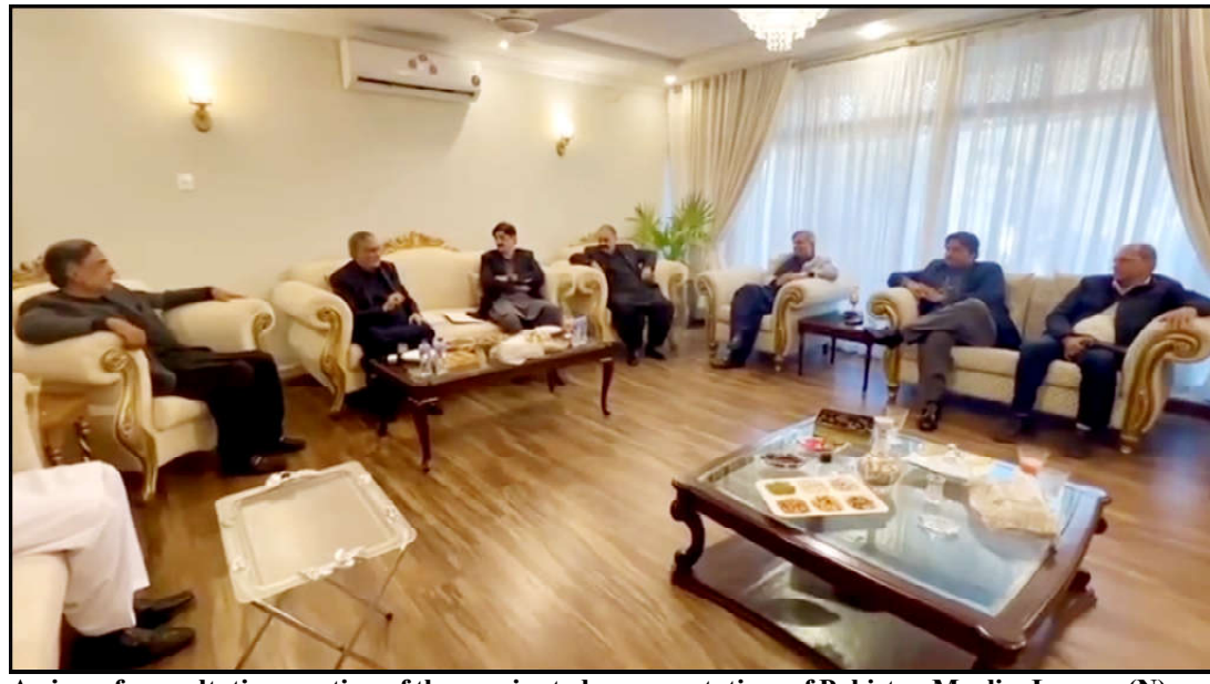
A view of consultative meeting of the nominated representatives of Pakistan Muslim League (N) and Pakistan People's Party held in Islamabad

demonstrated outside the district returning officer's office, while roads across the provincial capital, Chaman, Killa Saifullah, Loralai and Pishin were blocked due to the ongoing protests. As a result, land communication of Balochistan with Punjab and Khyber Pakhtunkhwa was cut off. Meanwhile, PPP continued its sit-in in Naserabad against the alleged polls rigging for the sixth day.