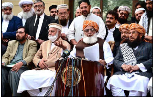
ISLAMABAD: President of Jamiat Ulema-e-Islam (F), Maulana Fazlur Rehman addresses a media talk at G-6/4.

The decision came in response to the joint request for a recount by the Pakistan Peoples' Party (PPP) and the National Party, highlighting the intensity and importance of the electoral contest in the region.