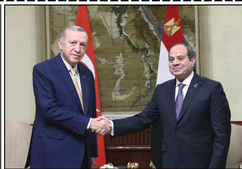
President Tayyip Erdogan meets with Egypt's President Abdel Fattah al-Sisi in Cairo, Egypt.

initiative that achieves an end to aggression and war," a Hamas official told AFP on condition of anonymity. The quest for a ceasefire comes after the United States and the United Nations warned Israel against carrying out a ground offensive into Rafah, the southernmost Gaza city where more than a million Palestinians are trapped. The official said Hamas had told the participants it does not trust Israel not to renew the war if the Israeli prisoners being held by Palestinians are released. The prisoners have been detained by Hamas since Oct 7 to pressurise Israeli forces to stop unending assaults on the people of Palestine.