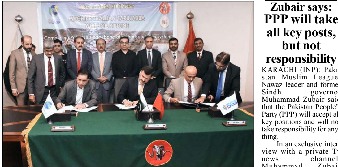
ISLAMABAD: The signing ceremony of MoU between the Stakeholders on Consortium Formation for Machike-Thallian-Tarujabba White Oil Pipeline Project at SIFC Secretariat, PM Office.