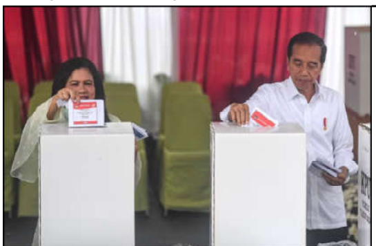
President Joko Widodo and First Lady Iriana cast their ballots at a polling station during the general election in Jakarta, Indonesia.

military. Ukraine has moved onto the defensive in the war, hindered by low ammunition supplies and a shortage of personnel, but has kept up its strikes behind the largely static 1,500-kilometer (930-mile) front line. It is the second time in two weeks that Ukrainian forces have said they sank a Russian vessel in the Black Sea. Last week, they published a video that they said showed naval drones assaulting the Russian missile-armed corvette Ivanovets. Ukraine's Military Intelligence, known by its Ukrainian acronym GUR, said its special operations unit "Group 13" sank the Caesar Kunikov using Magura V5 sea drones on Wednesday. Explosions damaged the vessel on its left side, it said, though a heavily edited video it released was unclear.