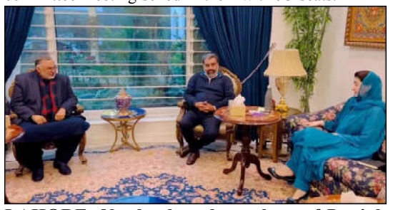
LAHORE: Newly elected members of Punjab Assembly met with Senior Vice President and Chief Organizer of Pakistan Muslim League (N) Maryam Nawaz Sharif.