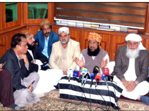
QUETTA: Jamiat Ulema-e-Islam (JUI-F) Secretary General, Maulana Abdul Ghaffoor Hyderi addresses to media persons during press conference

Jamat-e-Islami Ameer Siraj-ul-Haq also also tendered his resignations as chief of the Jamat-e-Islami. However, Perviz Khattak denied news that he is set to step down from