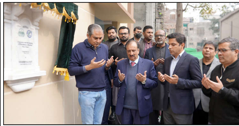
LAHORE: Caretaker Chief Minister Punjab Mohsin Raza Naqvi offering Dua after inaugurating Extension & upgradation Project of State of the Art Medicine Warehouse at Gulberg.