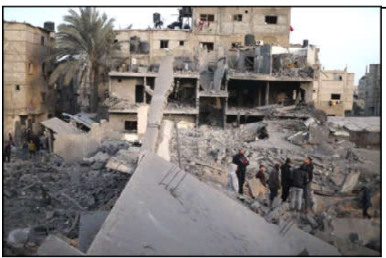
Palestinians gather at the site of an Israeli strike on a house, amid the ongoing conflict between Israel and the Palestinian Islamist group Hamas, in Rafah in the southern Gaza Strip.