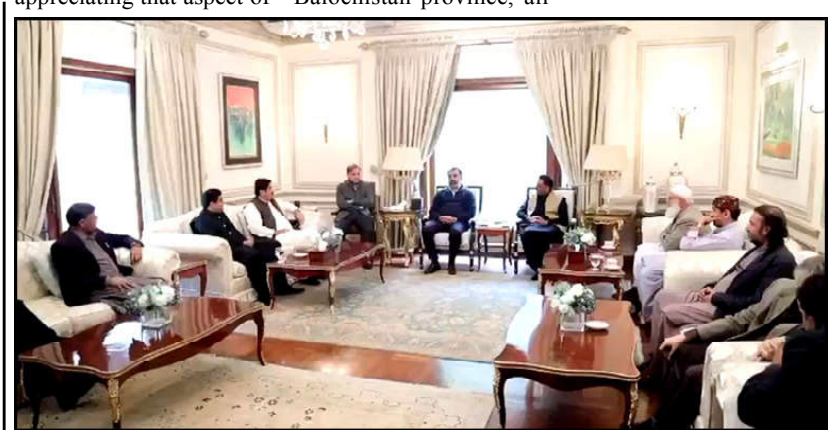
LAHORE: Newly elected independent candidates meeting with President PML (N) Shehbaz Sharif on eve of their joining the party.

cessfully, the ECP said. The commission mentioned its success of receiving first result at 2pm earlier than 4am in the next day in 2018. The ECP accepted disruption in operation due to internet service disconnection. The commission said the election results were completed in one and a half day except for some constituencies while it took three days in took three days in 2018.