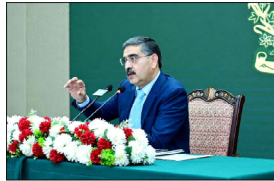
and they have results never dreamt of during 2018," he said, adding that the loyalists of jailed PTI leaders were emerged as returned candidates in the general elections but no one was appreciating that aspect of

and said that throughout the country's democratic history, people had always questioned the electoral process. Such results indicated the transparency and non-interference by any quarters, he emphasised. Addressing a presser at the PM House, the prime minister said that there might be shortcomings or other minor issues, but by and large, the elections were held in a manner in which the entire nation and the law enforcement agencies deserved kudos despite various security challenges. "Where the PTI has public support, it got that