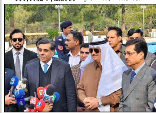
ISLAMABAD: Federal Minister for Interior and Commerce, Dr. Gohar Ejaz addressing the media along with Saudi Ambassador to H.E. Nawaf bin Saeed Al Malkiy at the Faisal Mosque.

For the role of chief minister in Balochistan, few notable figures from the respective parties have emerged as strong contenders.