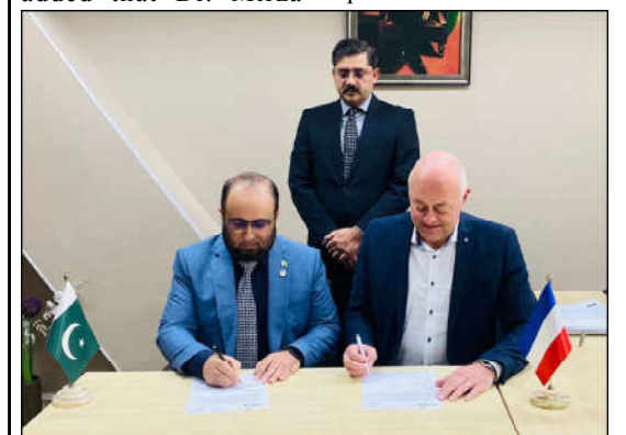
LAHORE: FPCI and Lahore Chamber's Standing Committee for Machinery Manufacturers and importers signed an important memorandum of understanding with the world-renowned company MEF Machine to ensure the exchange of modern technology, cooperation on mutual and commercial issues.