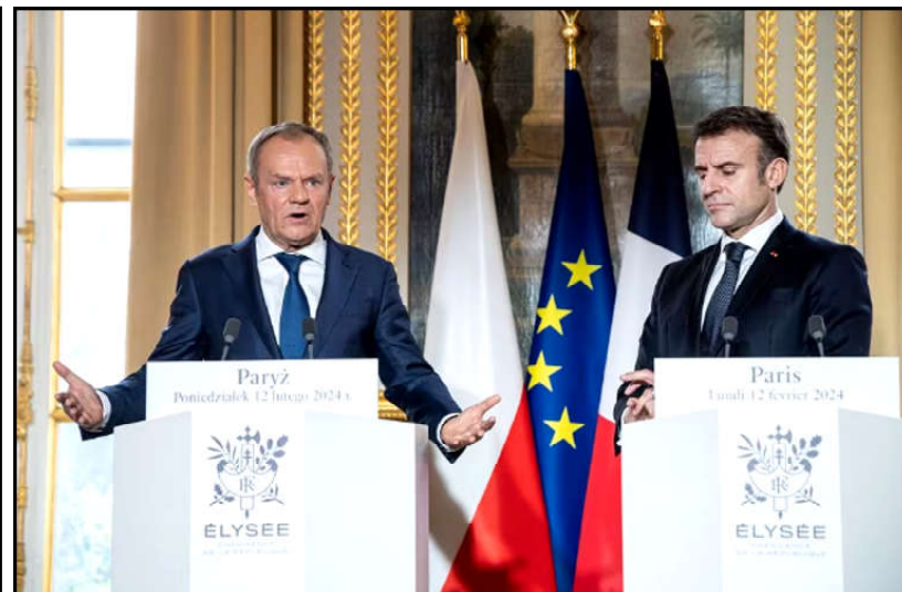
French President Emmanuel Macron and Polish Prime Minister Donald Tusk deliver a statement to the media as part of their meeting at Elysee Palace, Paris, France.