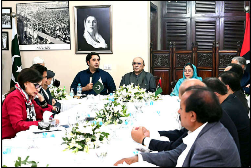
ISLAMABAD: President Pakistan People's Party Parliamentarians Asif Ali Zardari, Chairman Pakistan People's Party Bilawal Bhutto Zardari chairing PPP Central Executive Committee (CEC) at Zardari House in the Federal Capital.

Ph: 2841470/2841473 Vol: XIX No. 244, Shaban 02, 1445 AH Tuesday February 13, 2024, Pages 04, Price Rs.15