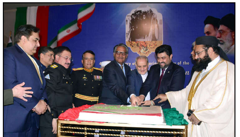
ISLAMABAD: Foreign Minister Jilani Abbas Jilani, Governor Sindh Kamran Tessori, Ambassador of Iran to Pakistan Dr Reza Amiri Moghaddom, and others cutting the cake during National Day of Iran ceremony at a local hotel, in the Federal Capital.