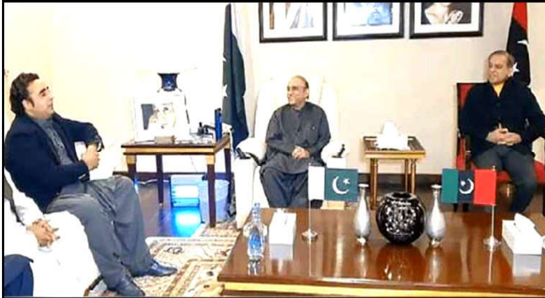
LAHORE: President PML (N) Muhammad Shahbaz Sharif meeting with Chairman Pakistan Peoples Party Bilawal Bhutto Zardari and Co-Chairman Asif Ali Zardari.

Ph: 2841470/2841473 Vol: XIX No. 243, Shaban 01, 1445 AH Monday February 12, 2024, Pages 04, Price Rs.15