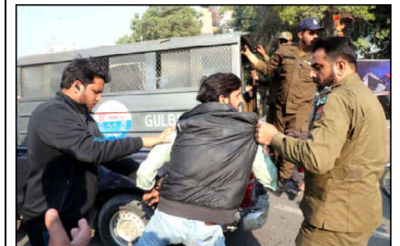
LAHORE: Police officials are arresting the workers of Tehreek-e-Insaf (PTI) who came to protest against rigging in General Election 2024, at Liberty Chowk in Lahore.