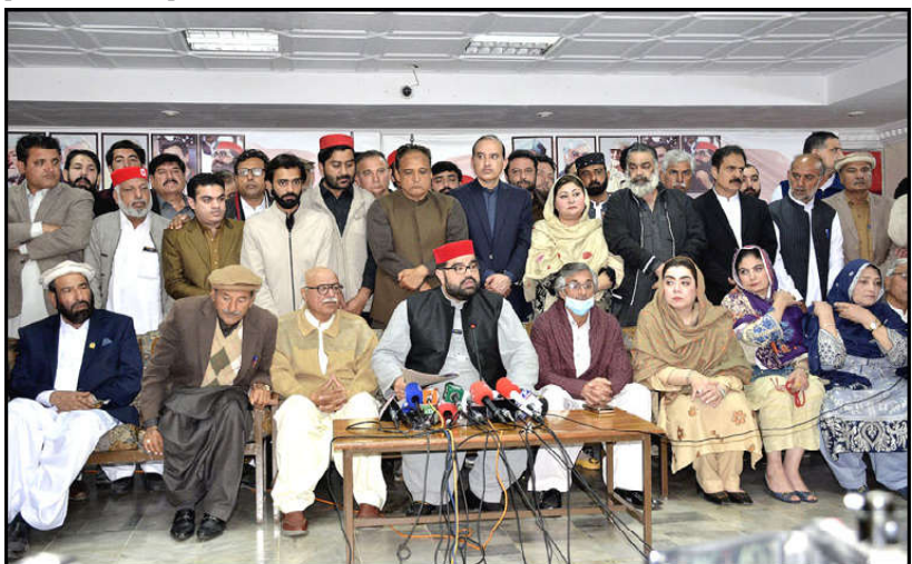
PESHAWAR: President Awami National Party (ANP) Aimal Wali Khan along with other party leaders addressing a Press conference at Bacha Khan Markaz.

Elections in two out of total 115 KP Assembly constituencies have been postponed due to the death of candidates, while the result of one was withheld due to vandalism. In the the Balochistan Assembly, the PPPP and the JUI-P lead the tally with 11 seats each, followed by PML-N with 10, Balochistan Awami Party four, National Party three, Awami National Party two, and Balochistan National Party, Balochistan National Party (Awami), Haq Do Tehreek Balochistan and JI-P one each. Independent candidates also grabbed six seats.