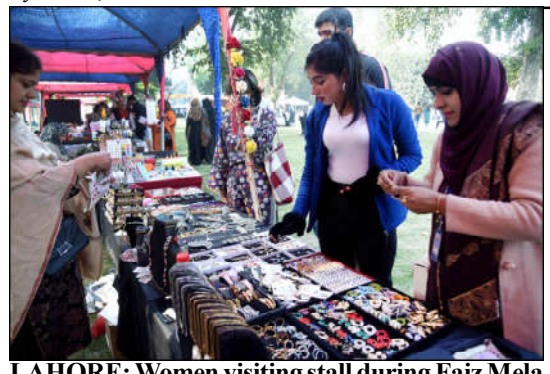
LAHORE: Women visiting stall during Faiz Mela at Al-Hamra.

He also lauded the efforts of ADD for focusing on women in green jobs and said that women could fill critical skills gaps in industries including renewable energy. "Climate change and natural disasters including floods are the gravest challenges that have emphasized the significance of collective efforts to mitigate losses and build back better."