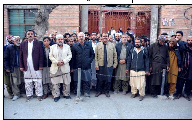
QUETTA: Activists of Balochistan National Party holding a protest against alleged rigging in the general elections.

Congressman Brad Sherman, a prominent member of the influential House of Foreign Affairs Committee stated that "press organizations in Pakistan ought to have liberty to disclose vote tallying and there should not be any needless postponement in declaring the outcome".