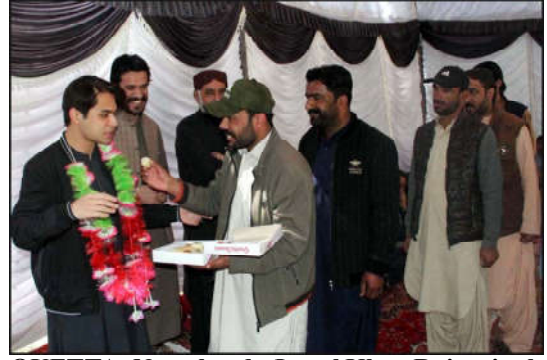
QUETTA: Nawabzada Jamal Khan Raisani celebrates with supporters after his victory in the General Election 2024, in Quetta.