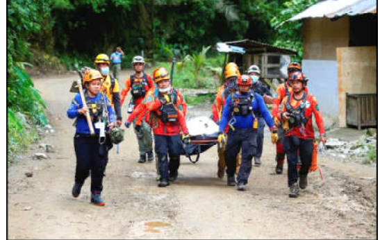
Rescuers carry a body bag as search and rescue operations continue in the landslide-hit village of Masara, Maco, Davao de Oro, Philippines.

world economy "bleak." The IMF recently slightly updated its economic projections, and now expects the global economy to grow by 3.1% this year, but, according to Georgieva, this figure is still "weak by historical standards" if compared to the average growth of 3.8% in the decade before the Covid-19 pandemic. "It is a signal that we are in a more shock-prone world - surprises of this type... mean we have to be in better position to face these repetitive shocks," she warned, suggesting that fiscal authorities around the world should build "buffers" to withstand crises.