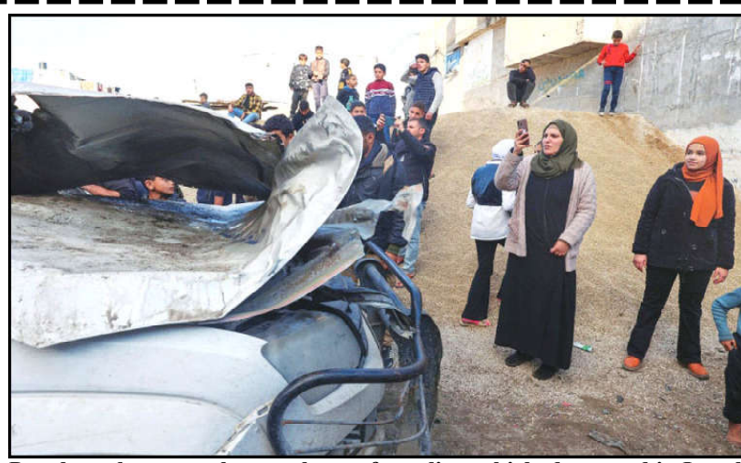
People gather near the wreckage of a police vehicle destroyed in Israeli Rafah.

NEW YORK (INP): Amazon founder Jeff Bezos sold around 12 million shares of the online retail and cloud services firm for roughly $2 billion, according to a company filing, soon after laying out a plan to sell his shares over the next year. The sale took place on Wednesday and Thursday, the filings showed. Last week, Amazon said that Bezos would sell up to 50 million shares in the firm. The sale plan, which is subject to certain conditions, was adopted on Nov. 8, 2023, and would be completed by Jan. 31, 2025, according to the company's latest annual report. Jeff Bezos, who stepped down as the company's chief executive and took over as executive chairman in 2021, founded Amazon as a bookseller in 1994. He is currently the world's second richest person with a net worth of $200 billion, according to Bloomberg Billionaires Index.