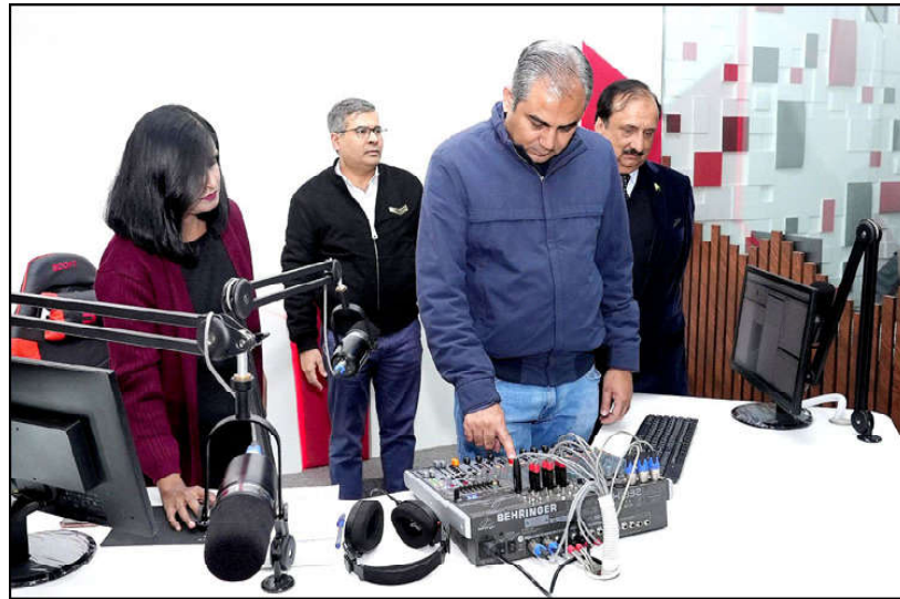
LAHORE: Caretaker Chief Minister Punjab Mohsin Naqvi inaugurates FM Radio "Sehat Zindagi" during his visit to Primary and Secondary Healthcare Department.

health sector. Naqvi apprised that various hospitals had been upgraded in a short span of time while upgradation of few other hospitals was in their final phases of completion. The hospitals which have not been upgraded yet, will be upgraded in the next phase. The CM said, "We have provided non-available facilities in the hospitals. We will arrange new operation theatres, MRI machines and other facilities in collaboration with the private sector." The CM also inaugurated Human Resource Information and Management System (HRIMS), Health Information and Service Delivery Unit (HISDU). He inaugurated the van especially being prepared for the video link along with the coaster project.