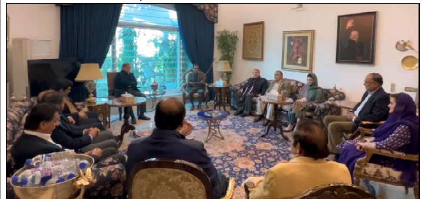
LAHORE: A delegation of MQM Pakistan meeting with PML-N Quaid Muhammad Nawaz Sharif and President Shahbaz Sharif.

ISLAMABAD (Online): The Election Commission of Pakistan has directed a re-polling at 53 polling stations in three constituencies of national and provincial assemblies on Thursday. According to an ECP spokesman, the commission has withheld the results in NA-88 Khushab, PS-18 Ghotki-I, and PK-90 Kohat-I constituencies due to the wastage of polling materials. The results of these constituencies will be announced after 15th of this month. The Commission ordered re-polling in 26 polling stations of NA-88, following the burning of polling material by a crowd at the Returning Officer's office. The commission has mandated the re-polling of 2 polling stations in Ghotki due to the snatching and destruction by unknown miscreants and 25 polling stations in PK-90 Kohat.