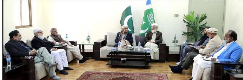
LAHORE: Amir Jamaat-e-Islami Sirajul Haq presiding over meeting of central leadership at Mansoorah