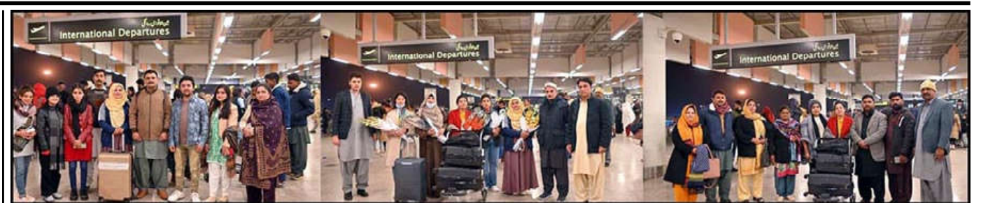
First set of Pakistanis among batch of 600 start Overseas Careers post landmark agreements by Ministry of Overseas Pakistanis and Human Resource Development.

MULTAN (APP): Tanzeem-e-Tajraan Pakistan expressed concerns over rising incidents of dacoities in city's busiest markets and demanded of Punjab government to take immediate notice of the poor law and order situation.