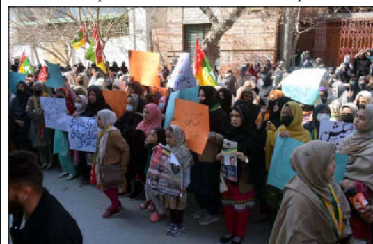
QUETTA: Activists of Hazara Democratic Party (HDP) are holding protest demonstration against rigging in General Election 2024, at Quetta press club.

GWADAR (INP): The Anti-Narcotics Force (ANF) while conducting an intelligence-based operation recovered 852kg hashish from Pansni city of district Gwadar in Balochistan, reported on Sunday. According to an ANF spokesperson, the Force was informed that 852 kilograms hashish was being smuggled on 12 camels in Balochistan's Pansni area. Taking an urgent action, the ANF personnel cordoned off the smugglers and recovered drug worth millions of rupees. ANF claimed that it was committed to eradicate smuggling from the country. Last week, ANF while conducting 11 operations recovered over 724 kg drugs and arrested nine accused. 746 grams hashish was recovered from a passenger going to Sharjah from Islamabad Airport. 91 her-oin-filled capsules were re-covered from a passenger going to Dubai from Islamabad Airport. 159 grams hashish was recovered from two passengers going to China at Karachi Airport.