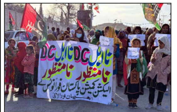
LORALAI: Activists of Peoples Party (PPP) are holding protest demonstration against alleged rigging in General Election 2024, outside DC Office.