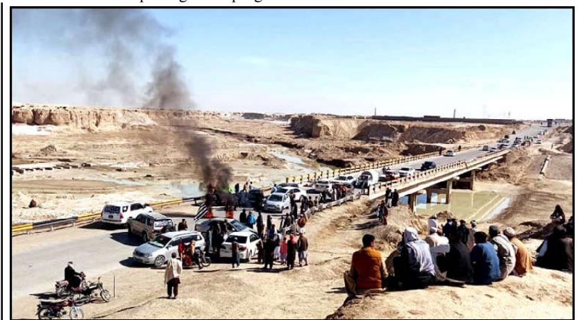
QUETTA: Activists of Jamiat Ulema-e-Islam (JUI-F) are burn tires and blocked road as they are holding protest demonstration against alleged rigging in General Election 2024, at Syed Hameed Crossing Bridge located on Qila Abdullah area of Balochistan.

The PML-N nominated candidates who won the NA seats from Balochistan are included: Sardar Yaqoob Khan Nasar (NA-252), Mir Khan Muhammad Jamali (NA-255), Jam Kamal Khan (NA-257) and Jamal Shah Kakar (NA-263).